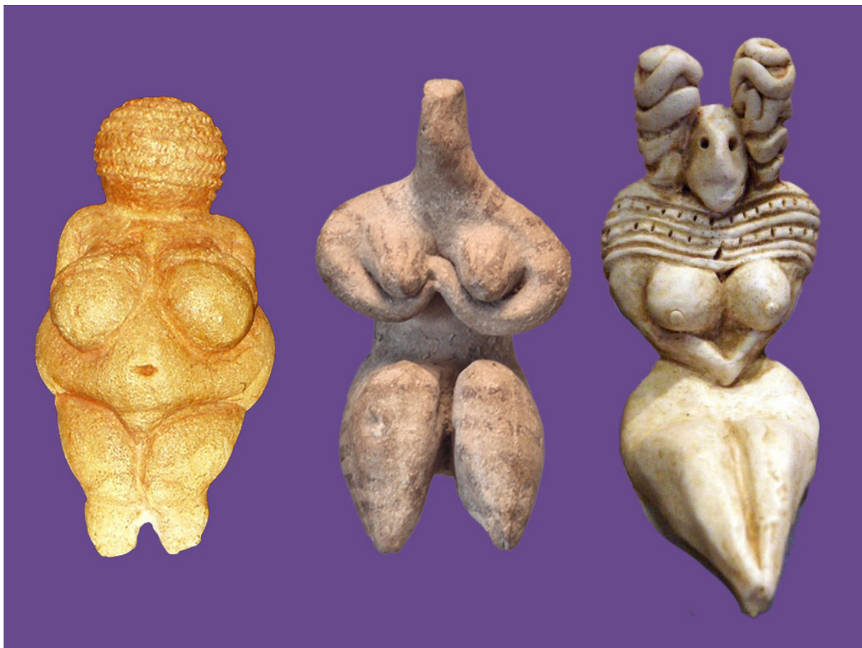
From left: Venus of Willendorf, c. 25,000 BC; fertility figurine of the Halaf culture, Mesopotamia, c. 6000-5100 BC; fertility figurine from Mehrgarh, Indus Valley, c. 3000 BC.