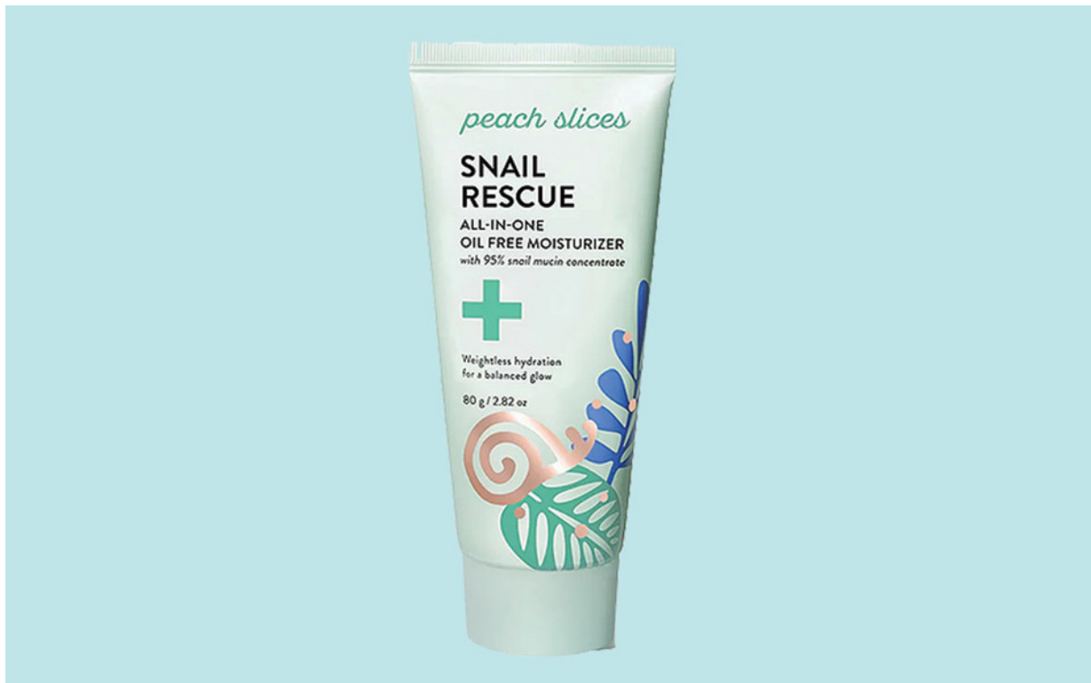
Peach & Lily