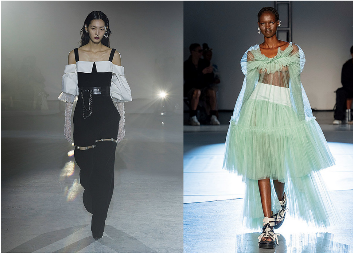
Runway looks from the fall/winter 2023 (left) and spring/summer 2024 collections.

see people mixing women's wear, menswear, and everything in between. I wanted to capture that spirit."