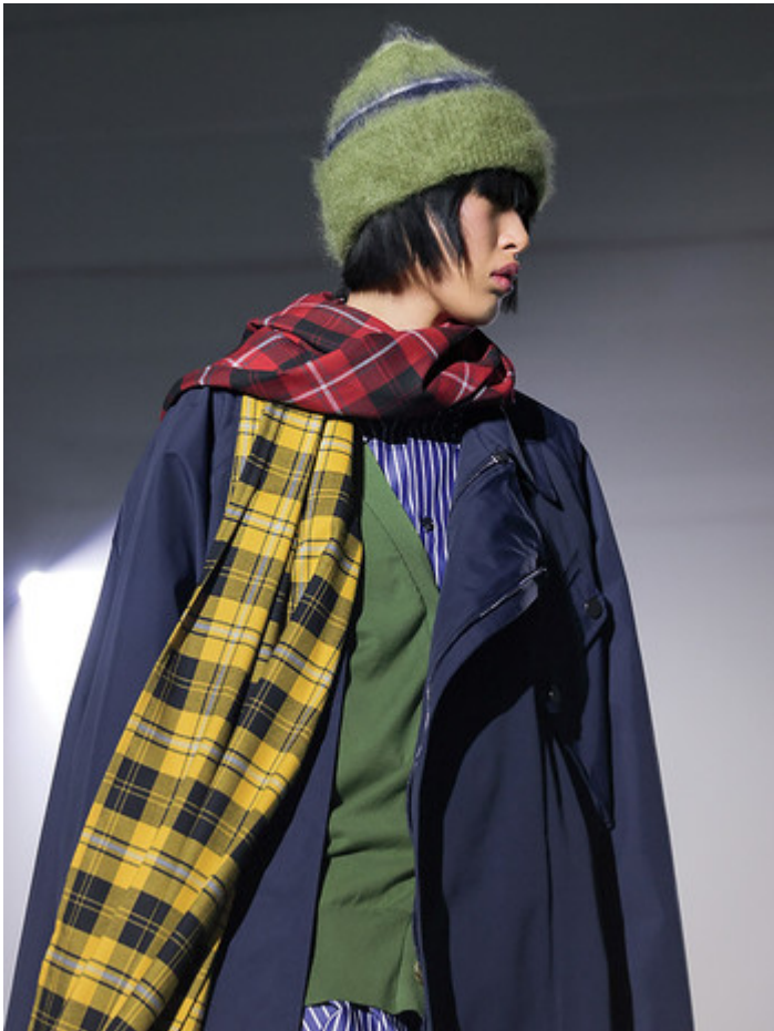
A look from the Ichi collection

majoring in art history and anthropology, she interned at Vogue and completed a summer design intensive in Paris. “I learned that fashion is more than just pretty clothes,” she says. “Every brand has a unique story, and it’s the stories that inspire people.”