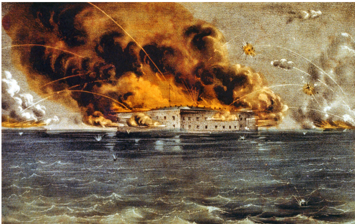
Bombardment of Fort Sumter, Charleston Harbor, April 12-13, 1861.

Exactly how did the American Civil War begin? This was the question Erik Larson was pondering when he began working on a new book in the first weeks of the COVID pandemic. After writing three histories of wartime Europe, most recently