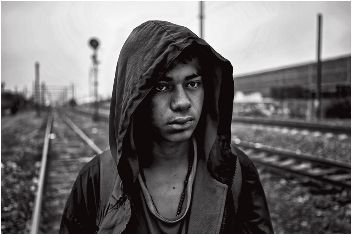
Twelve-year-old Honduran migrant, Lecheria rail yard, State of Mexico