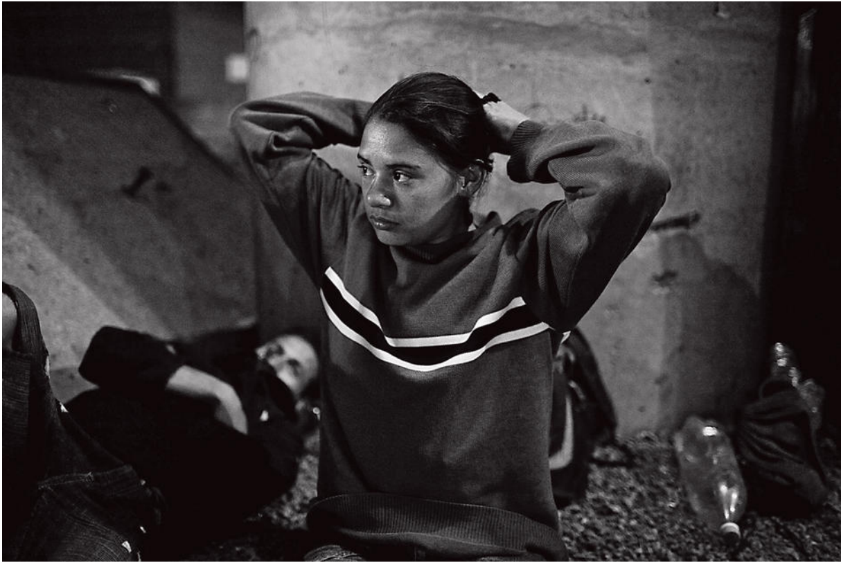
Honduran migrant, Lecheria rail yard, State of Mexico

Central American migrants are the most vulnerable community in all of Mexico, and the drug war has threatened them further: human trafficking has become a lucrative business, largely controlled, according to the Mexican government, by the notoriously brutal Zetas cartel. (I was fortunate to have taken these photos in 2008; a year or so later, to walk along some of the same tracks would have been a death sentence.) And while the drug war holds the attention of the news media, economic refugees from countries such as Honduras, El Salvador, and Guatemala continue to leave their homes and risk their lives in search of work.