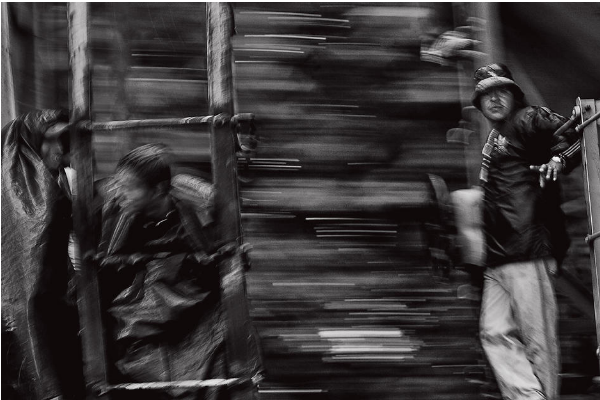
La Esperanza, Veracruz (Kate Orlinsky)

When Americans imagine the treacherous paths of undocumented immigrants, they likely picture the Texas-Mexico border. Crossing the Rio Grande or the Sonoran Desert is indeed dangerous, and many people end up deported, imprisoned, or dead. But for thousands of undocumented Central American migrants each year, the US-Mexico border is merely the home stretch. The deadliest part of the journey starts at Mexico's southern border with Guatemala.