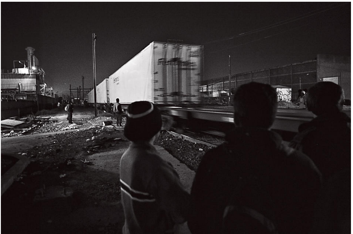
Lecheria rail yard, State of Mexico