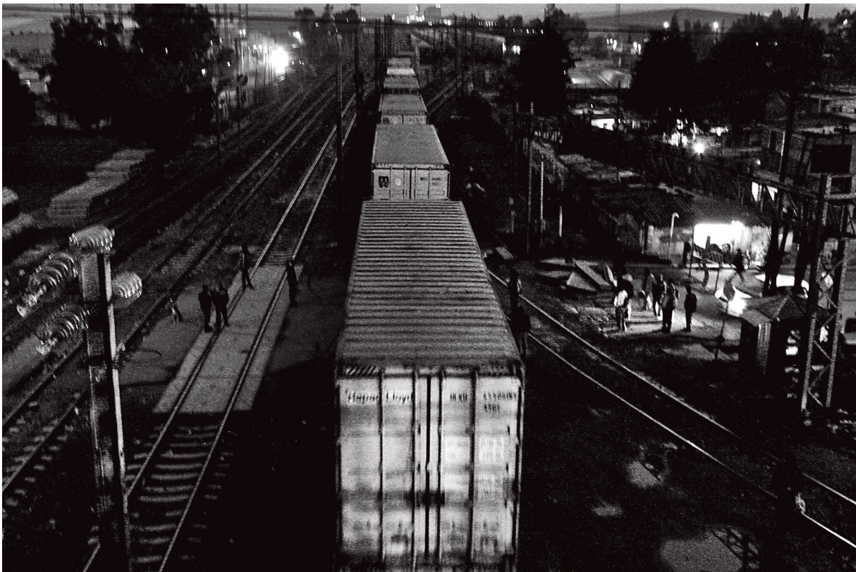
Lecheria rail yard, State of Mexico.

On an unseasonably cold summer night in the Lecheria rail yard, outside Mexico City, I sat under a bridge with a group of young people in their late teens and early twenties. Some tried to sleep, despite the deafening rumble of the trains as they passed. Others lay awake chatting, flirting, and keeping an eye out for robbers. Spirits were high. These young men and women were migrants from Central