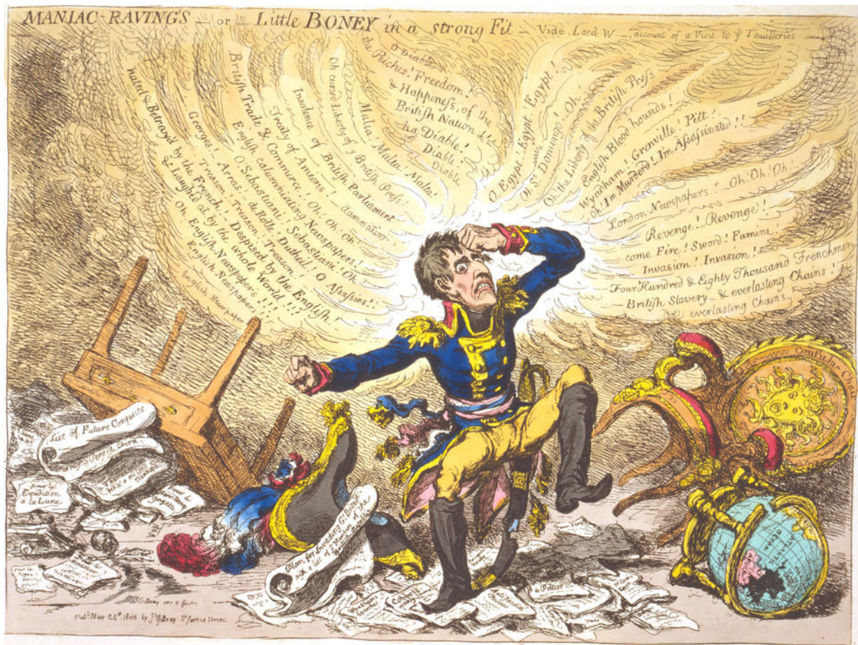
James Gillray, Maniac Ravings, or Little Boney in a Strong Fit, 1803.