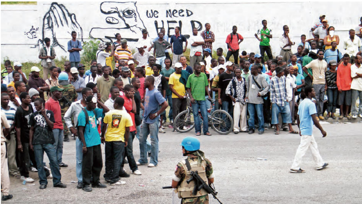
UN peacekeeper in Haiti, 2009.

Today, because so much blood has been spilled and there is deep hatred and fear on both sides, a negotiated solution is much harder to find. Assad is in a stronger position now than he was in 2012. Unless overwhelming force is used, as it was in Iraq, he won't be removed. And if overwhelming force were used — which it won't be, because there's no support for it — it would be a leap into the unknown.