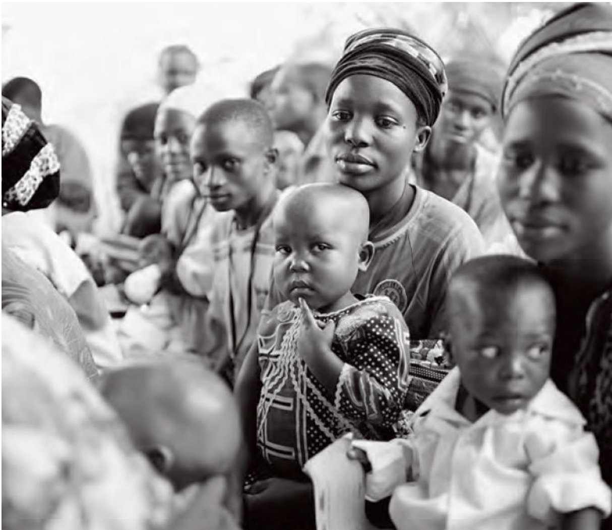
Families gather at Village Health Works' annual community forum in December.