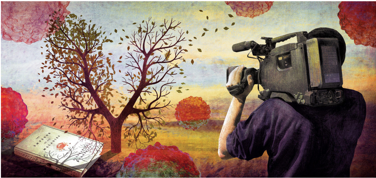
ALE + ALE