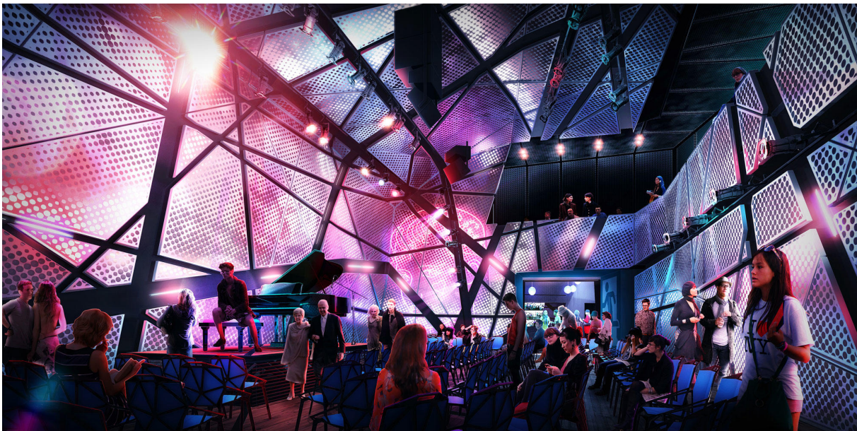
Rendering of the finished stage.