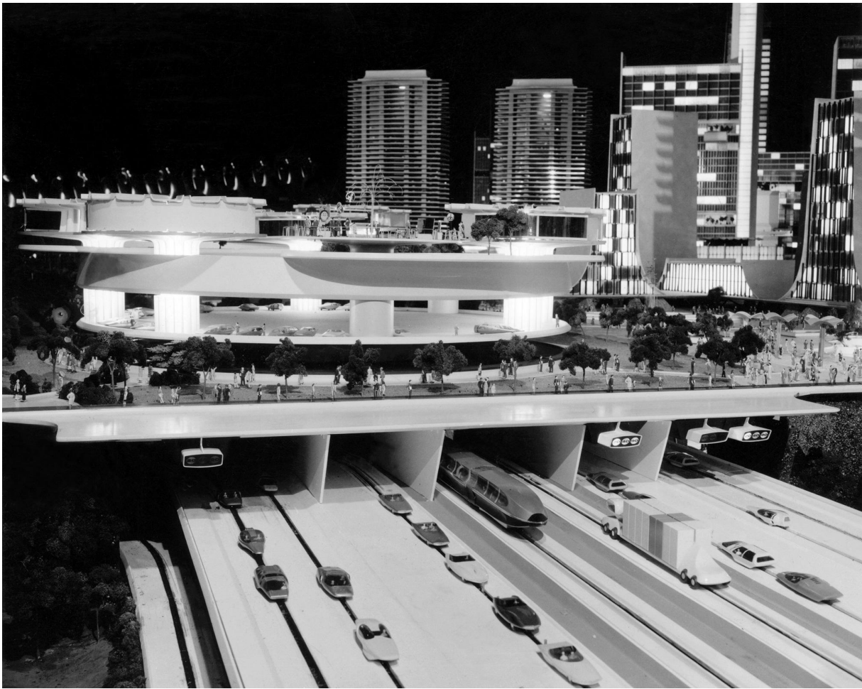
The GM exhibit at the 1939 World's Fair, Futurama, featured an automated highway system.

Yes, a lot of people will lose their jobs, and not just truck drivers and taxi drivers. Dozens more professions will be transformed. The body shop, where people fix cars after collisions — that's going away. And how many healthcare hours are devoted to car accidents? A huge number. How much income do parking tickets generate for cities? It's not negligible. There's this cascade effect.