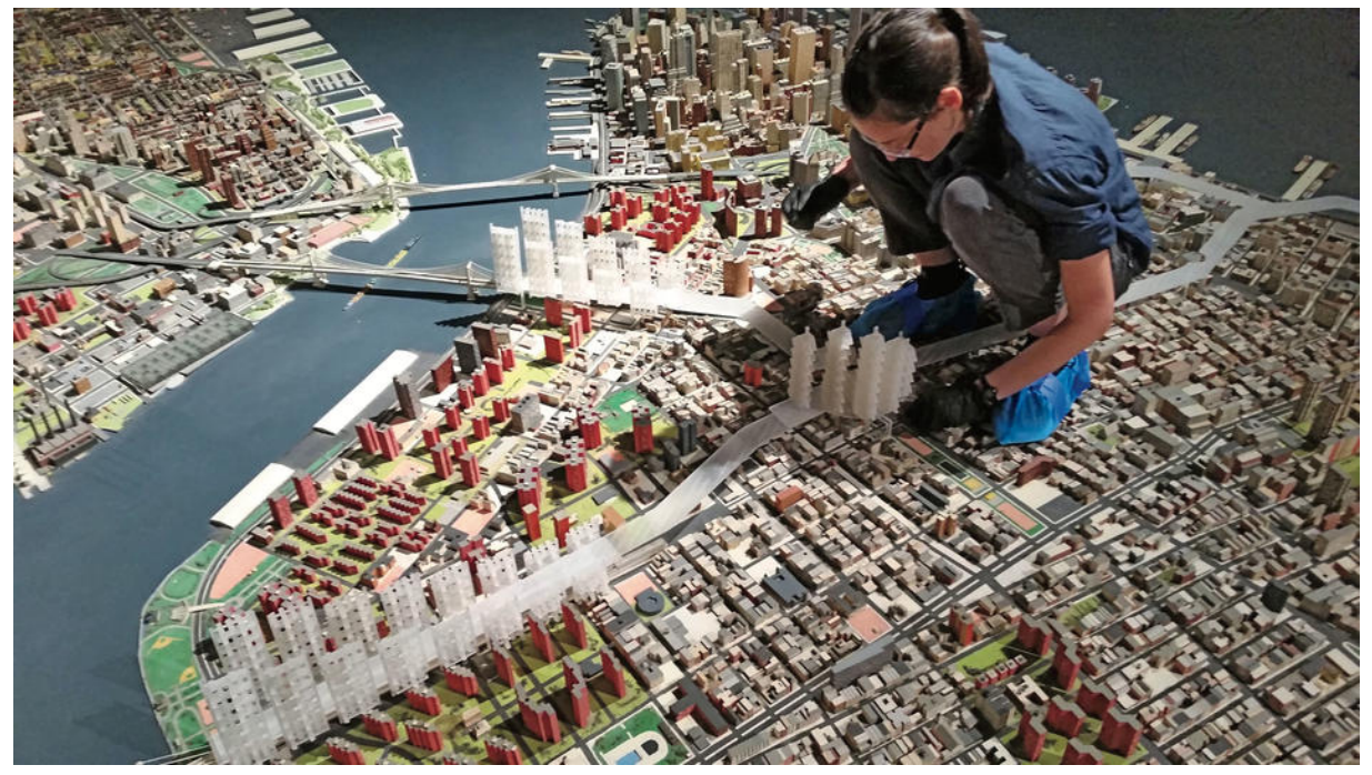
Installing Robert Moses's Lower Manhattan Expressway

The students produced all their models in GSAPP's Fabrication Lab, using a 3D printer for the most intricate structures and sculpting others out of Plexiglas with laser-guided cutting tools.