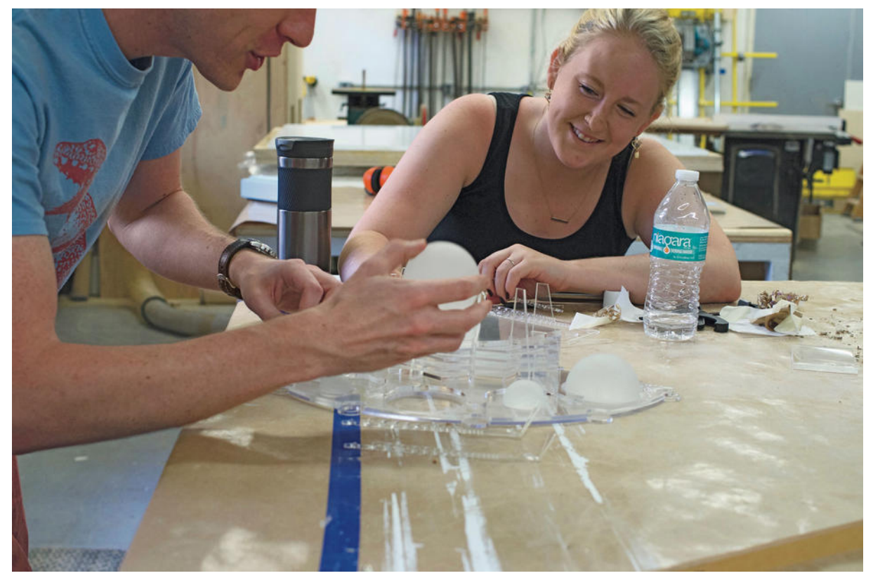
Building a model from Plexiglas

have been brought to life in miniature by a team of students at Columbia's Graduate School of Architecture, Planning, and Preservation. The students recently made models of fifty-six such projects and inserted them into the Panorama of the City of New York, a room-sized, 1:1,200 scale replica of the five boroughs at the Queens Museum. The students' temporary makeover of the Panorama, which was originally built for the 1964 New York World's Fair and was last updated in 1992, is part of the museum's new Never Built New York exhibition, which is on display through February 18.