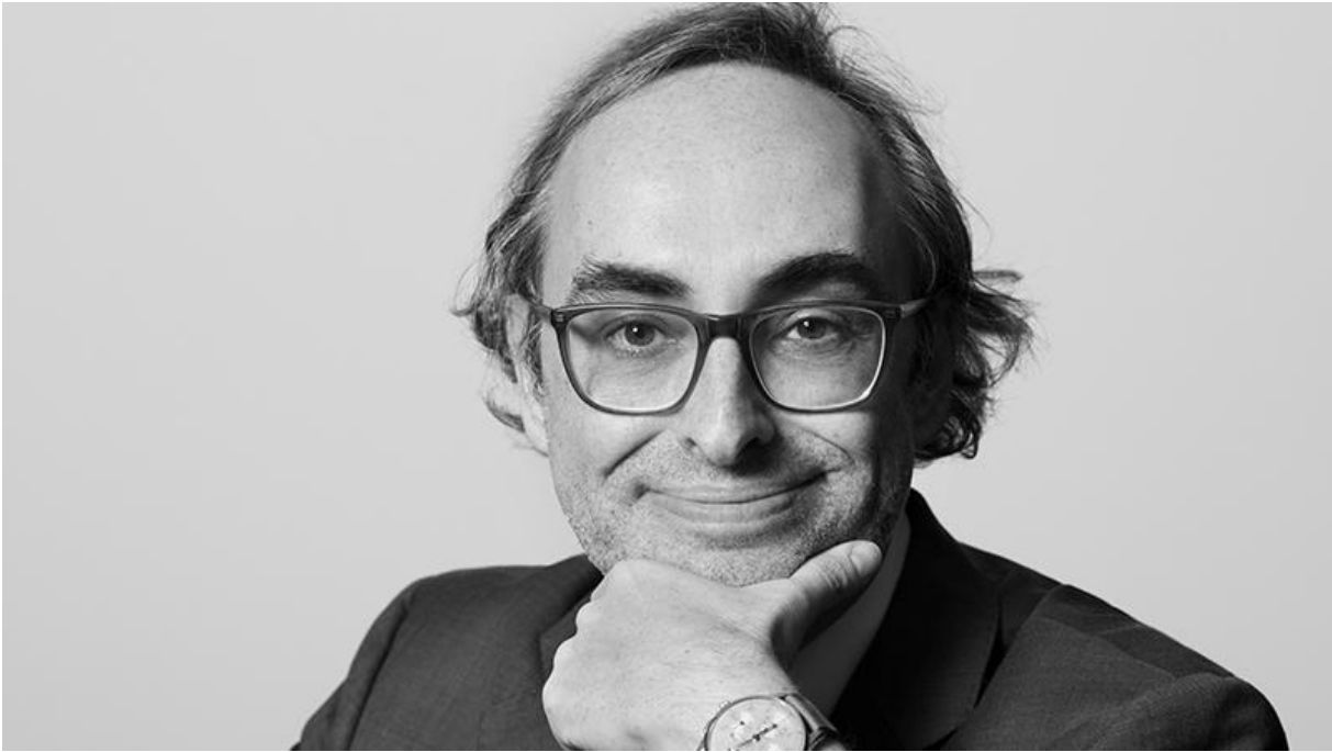
Gary Shteyngart

Along the way, he scores crack in Baltimore, suffers a breakdown in Phoenix, and has a cringingly awkward stay with Layla's parents in Richmond. He finally finds Layla in El Paso, and as he falls into an effortless intimacy with his former love and her son, there's enough space in the narrative for us to ask painful questions about what's stopping him from having the same kind of relationship with his own wife and child back home. Barry is so divorced from reality that he spends his days tooling around El Paso, reveling in the suburban Texas lifestyle: why, he wonders, did "people who were just upper-middle-class in New York [choose] to stay there, given that they could live like minor dictators in the rest of the country?"