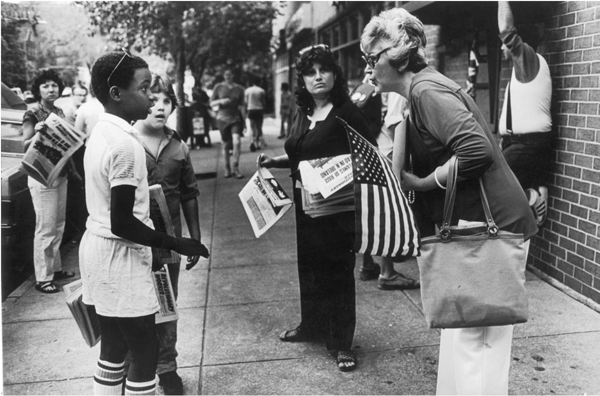
"Political Debate," 1981

"We called this block The Strip, and for many years it was the center of both commerce and the rich street life of the 1970s and '80s. In the words of a reporter, it's 'where the '60s came to die.' Fortunately, they were still alive enough here for me to have made this picture. The kid is part of a Trotskyite group that demonstrated each week outside the local bank, which was especially busy for obvious reasons on Friday afternoons. The woman was a very patriotic Republican conservative in a generally liberal neighborhood and was a lot of fun. Scenes like this rarely take place these days. People don't talk to each other as readily."