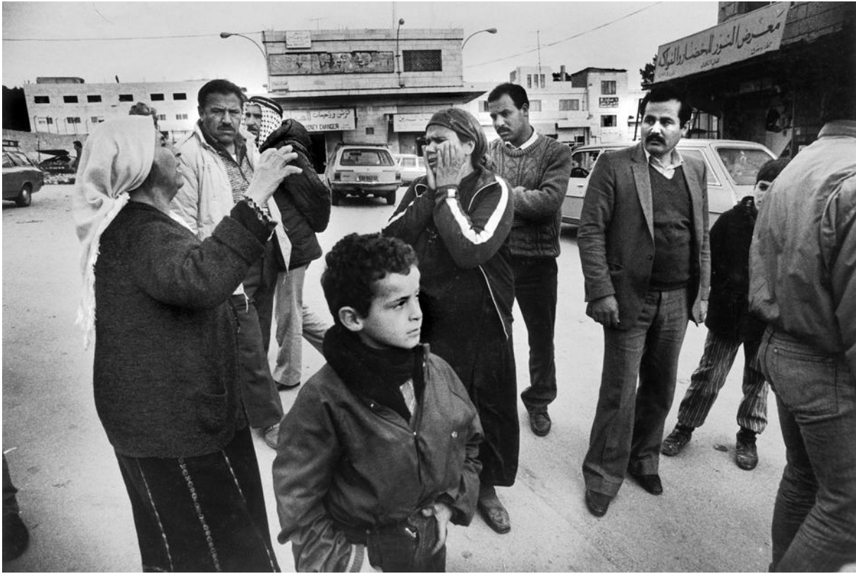
"Ramallah," January 1988

"I was in Ramallah during the rioting that marked the beginning of the first intifada when I came across these two women. The mother, on the left, was telling people that her son had been arrested by the Israeli Army. But the boy in front is what struck me."