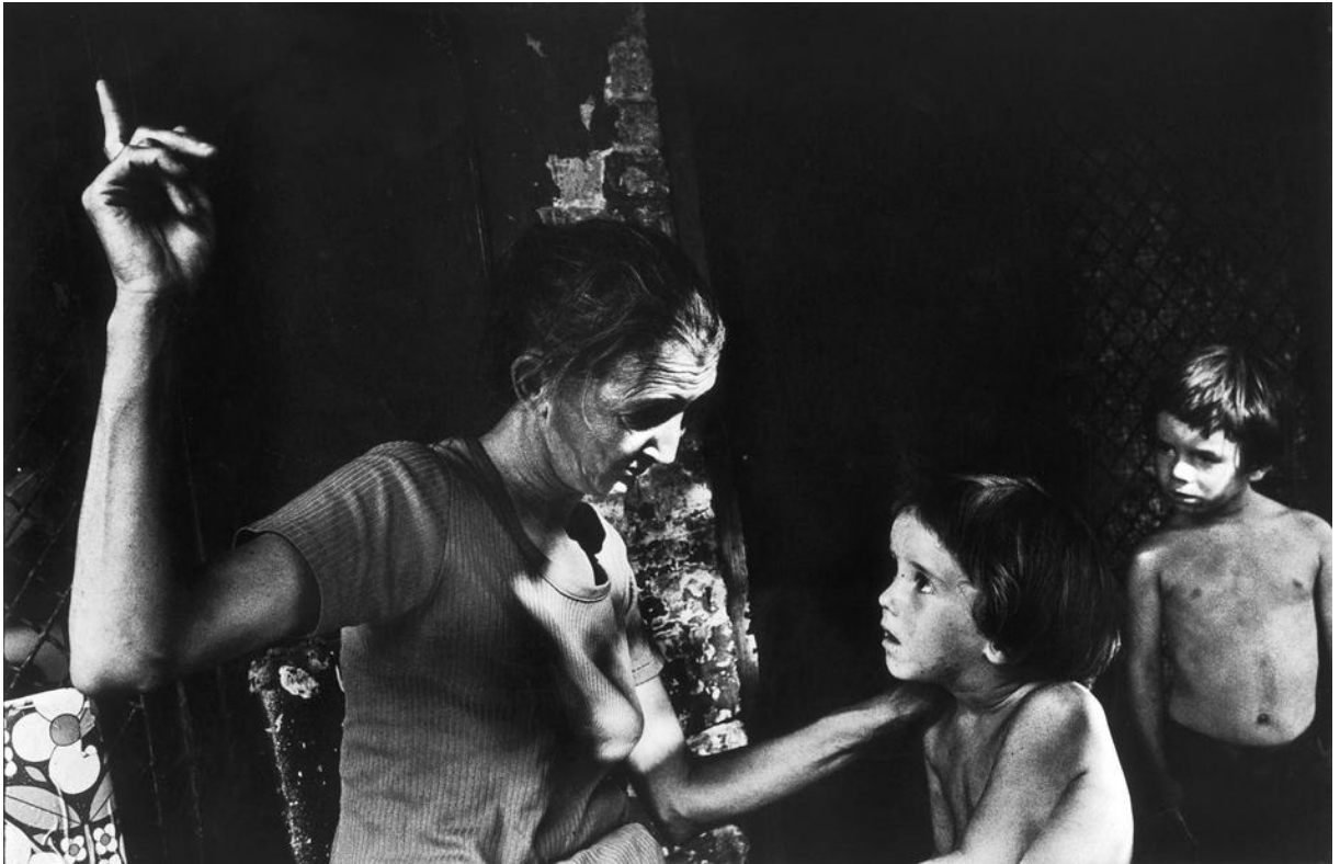
"The Explanation," 1980