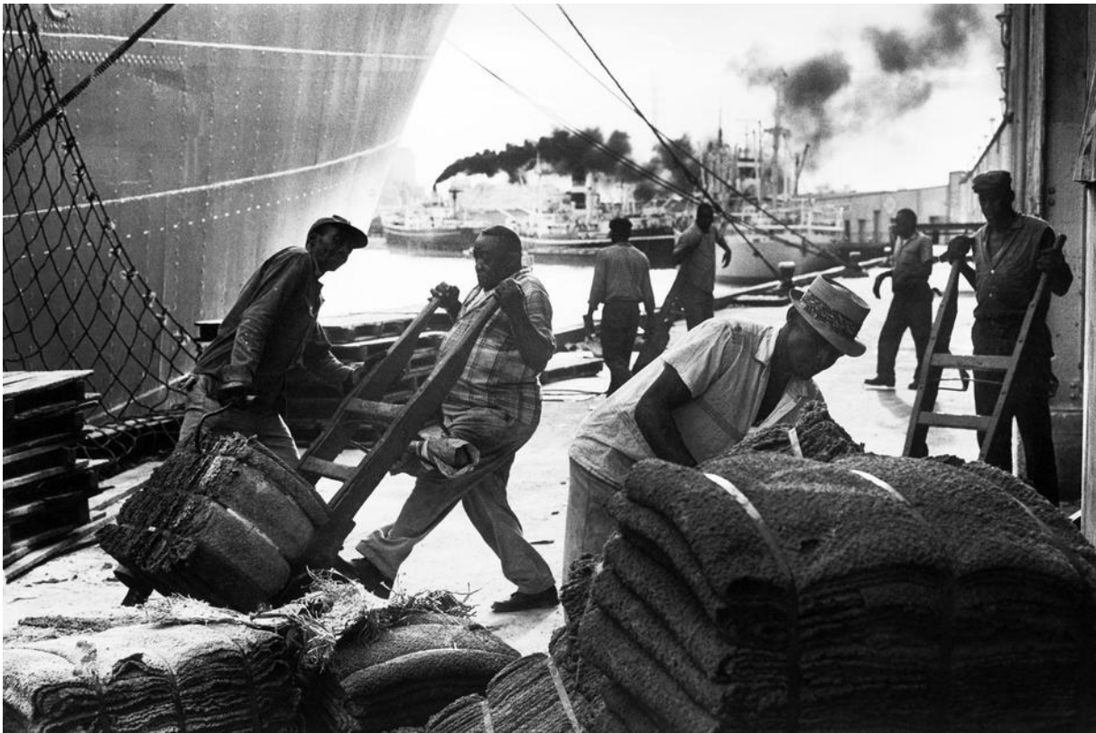
"New Orleans Dock," 1966

"I took this picture while on vacation from my social work job at the Baltimore Department of Public Welfare. The men are unloading rubber from the Philippines. Scenes like this were already disappearing after the introduction of container shipping, and the picture takes on added meaning given the recent Katrina tragedy. It's one of my first good pictures, and I still consider it one of my very best."