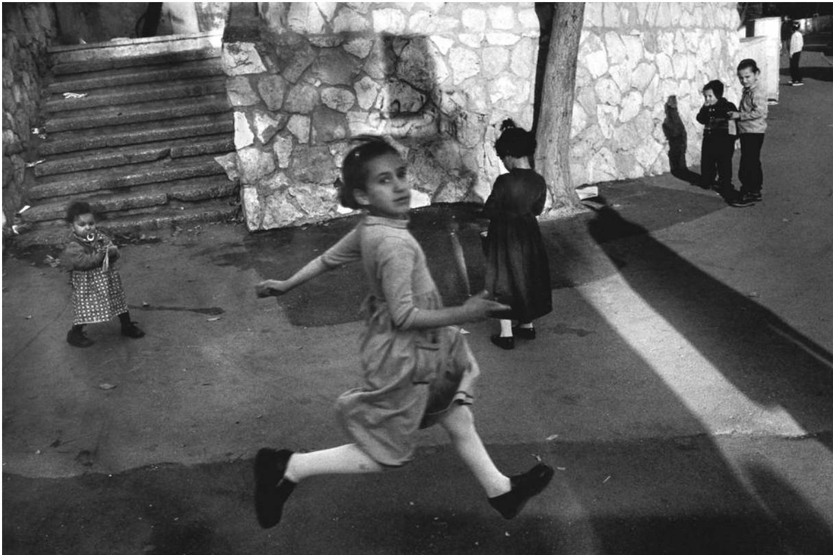
"Leap of Faith," 2000

"I was coming from the funeral of a high school teacher, who had been murdered in the West Bank with several of her students the day before by terrorists. These children were playing near the bus stop in Sanhedria, Jerusalem, where I awaited the bus home."