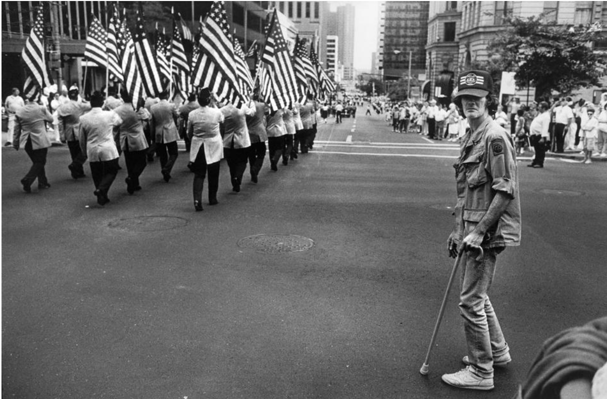
"Lest We Forget," 1988

“I was photographing the Memorial Day Parade in Baltimore when I saw the vet with the brace: He was so alienated from the others in the parade. It wasn’t hard to recognize that he’d been badly damaged by ‘Nam not only physically but psychologically as well.”