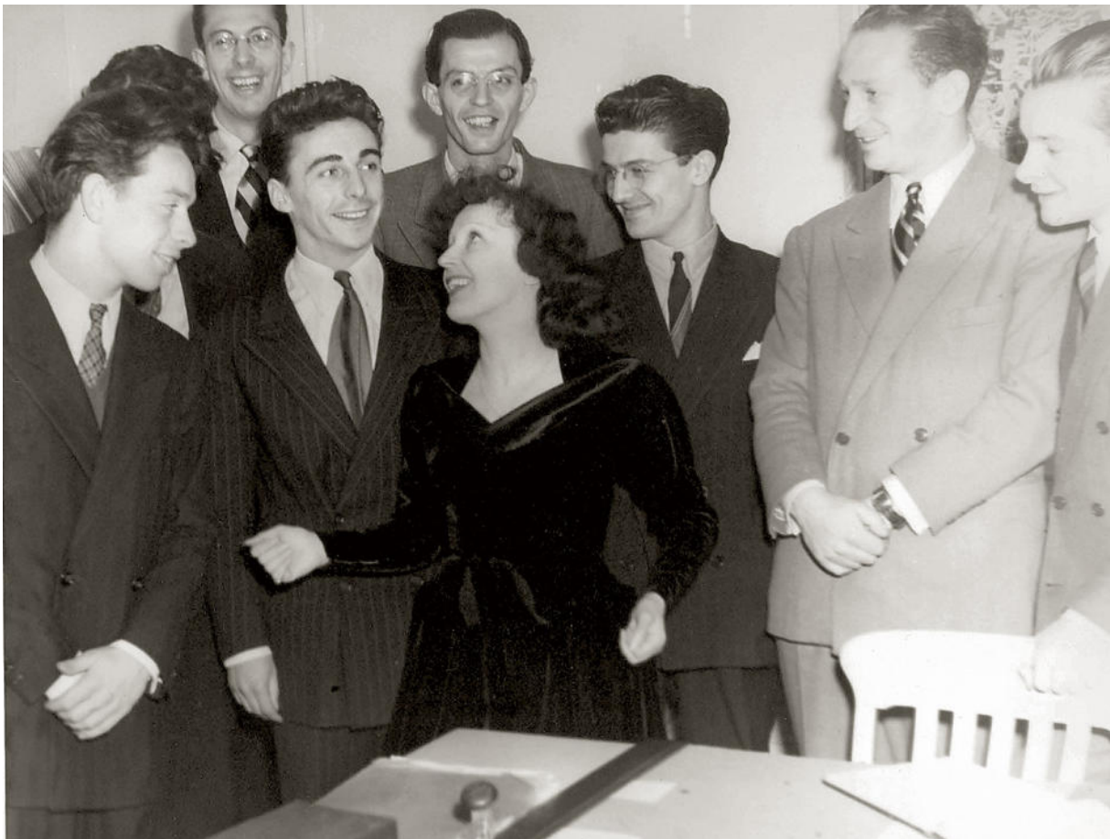
Edith Piaf meets with students at Columbia's Maison Française in 1947.