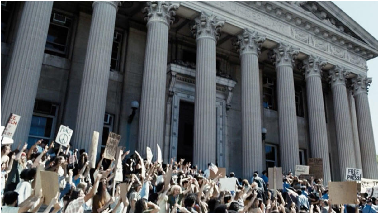
A scene from "The Post."