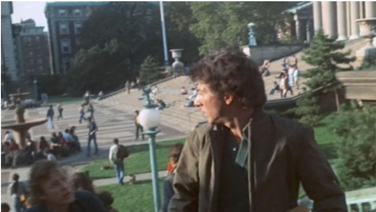
Dustin Hoffman in "Marathon Man."

This crime thriller was adapted from the 1974 novel by William Goldman '56GSAS, who also wrote the screenplay. Dustin Hoffman plays a Columbia history PhD student and avid runner who becomes entangled in a criminal plot devised by a former Nazi, played by Laurence Olivier.