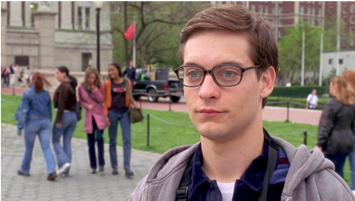
Tobey Maguire in "Spider-Man."

Peter Parker's superhero transformation begins during a high-school field trip to a Columbia science lab, where he gets bitten by a genetically engineered spider. James Franco '11SOA, who later got an MFA in writing at Columbia, costars as Parker's friend Harry Osborn.