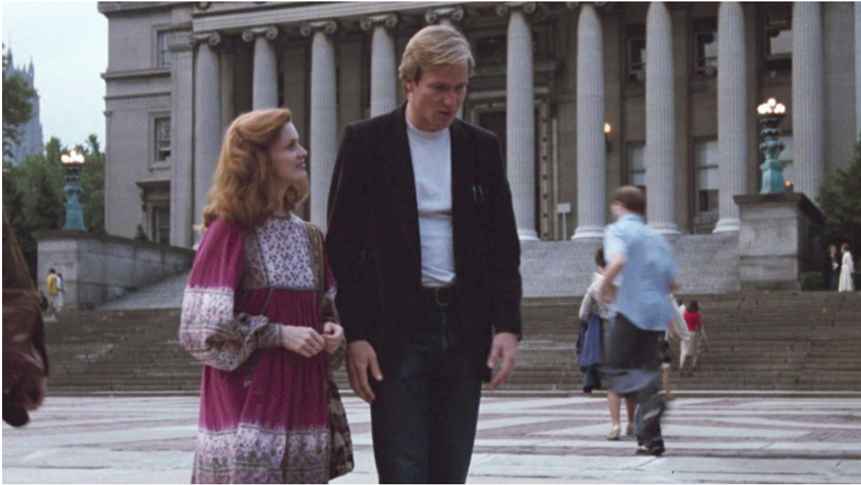
Blair Brown and William Hurt in "Altered States."

William Hurt broke into Hollywood with this trippy sci-fi horror flick about a psychopathologist who experiments with psychedelic drugs. The film also marked the film debut of Drew Barrymore, then five years old.