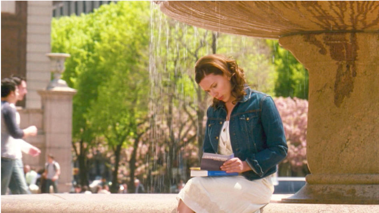
Scarlett Johansson in "The Nanny Diaries."

Will Smith stars as Alex “Hitch” Hitchens, a professional dating consultant, in this mid-2000s rom-com. A flashback scene of Hitch’s college days, shot on the steps of Low Library with actress Robinne Lee ’00LAW, reveals that his own love life wasn’t always so smooth.