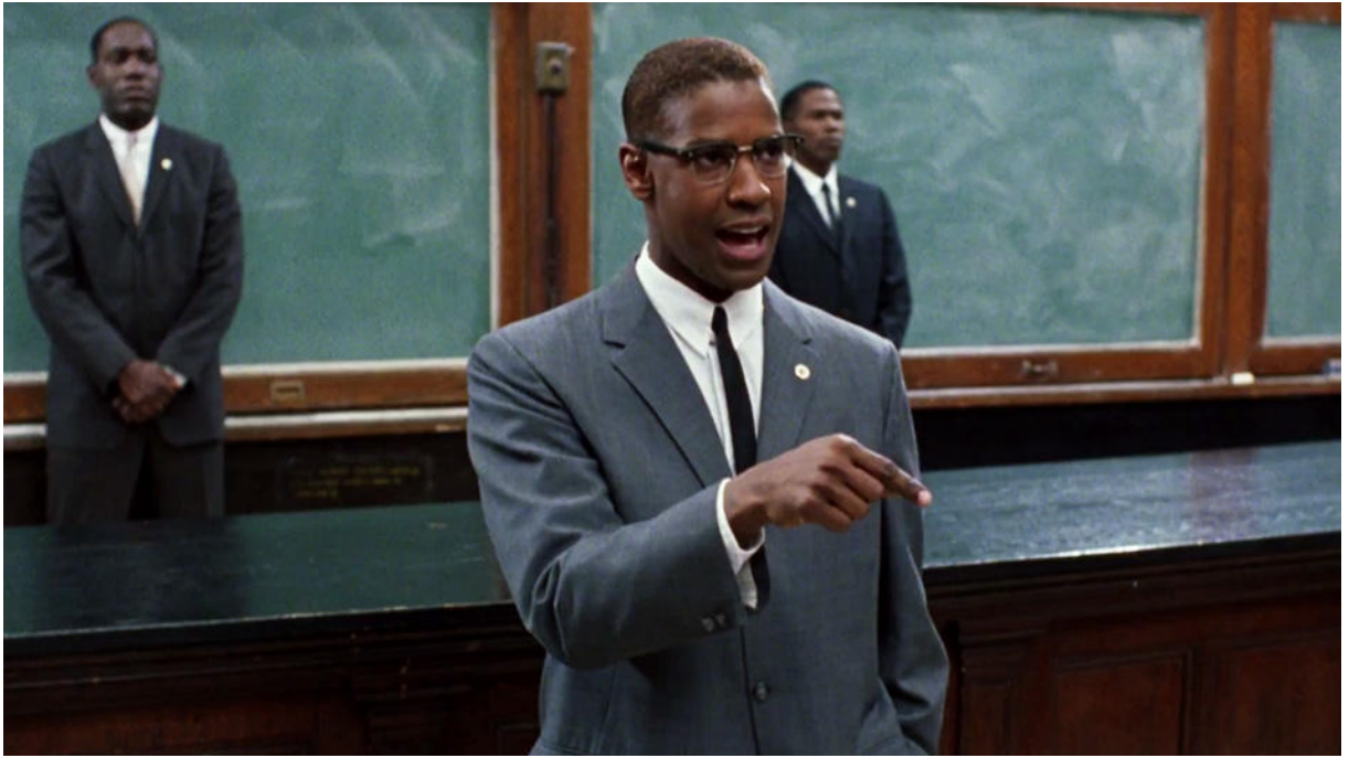
Denzel Washington in "Malcolm X."

Spike Lee's biopic of Malcolm X, which stars Denzel Washington as the civil-rights icon, is one of several films and television shows to use Columbia's 309 Havemeyer Hall as a filming location.