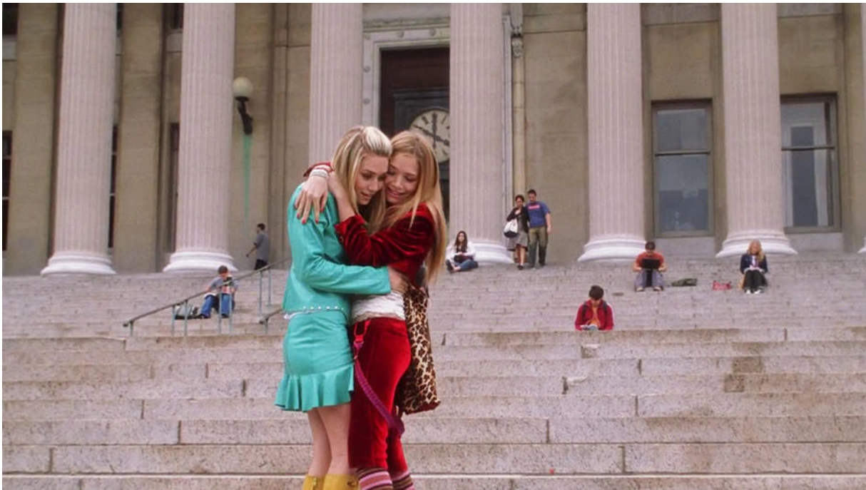
Ashley and Mary-Kate Olsen in "New York Minute."

It might have a rating of only 11 percent on Rotten Tomatoes, but this kid-friendly comedy starring Mary-Kate and Ashley Olsen — the last in which the twins appear together! — is worthy for its brief Columbia cameo.