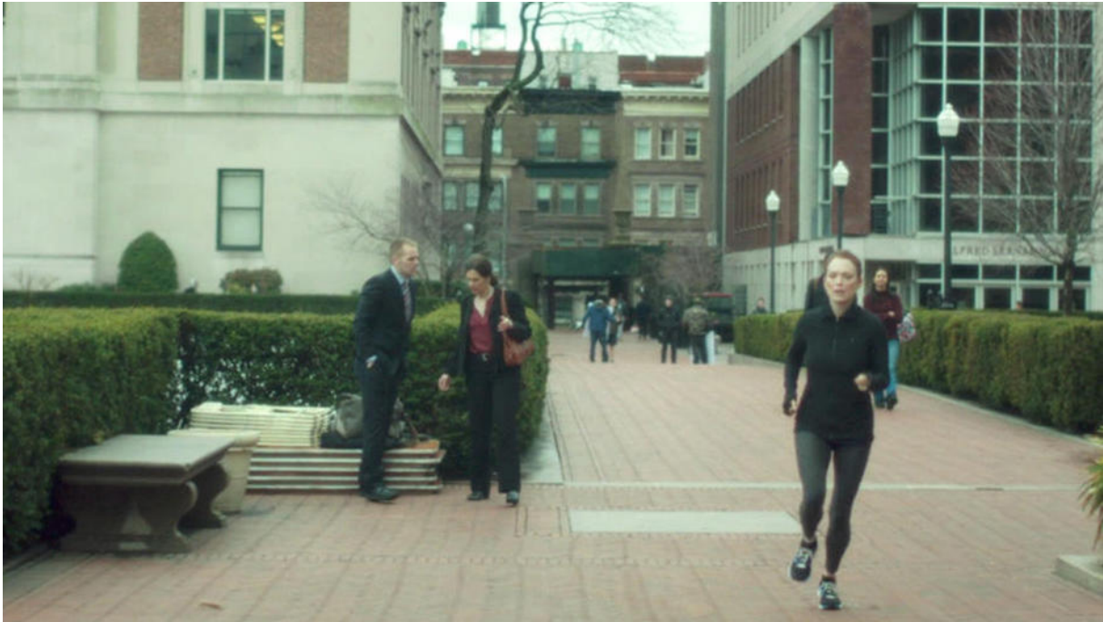
Julianne Moore in "Still Alice."

Julianne Moore won an Oscar for Best Actress for playing a Columbia linguistics professor who receives a devastating diagnosis of Alzheimer's at age fifty. Several of the film's scenes show her walking and jogging around campus, as well as stopping for fro-yo at the Pinkberry on 112th and Broadway.