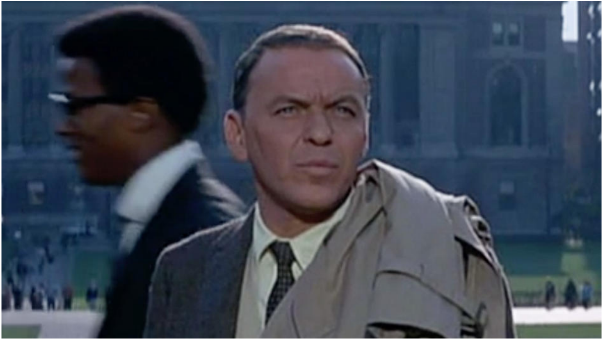
Frank Sinatra in "The Detective."

Frank Sinatra stars as Joe Leland, a New York City detective who investigates the brutal murder of a gay man, in this neo-noir thriller. Lee Remick plays Leland's estranged wife, a Columbia professor.