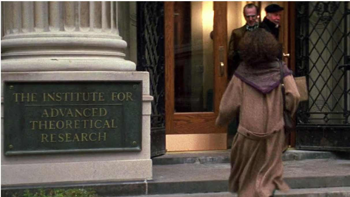
Sigourney Weaver in "Ghostbusters 2."

The Ghostbusters franchise returned to Morningside Heights for this 1989 sequel, which shows Sigourney Weaver strolling into the fictional “Institute for Advanced Theoretical Research.” (The building is actually Avery Hall.)