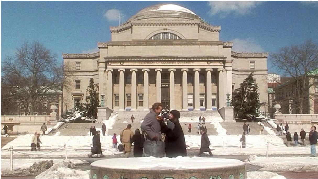
Jeff Bridges and Barbra Streisand in "The Mirror Has Two Faces."

Barbra Streisand produced, directed, and starred in this Columbia romance about two middle-aged professors — played by Streisand and Jeff Bridges — who meet through a personals ad and fall in love.