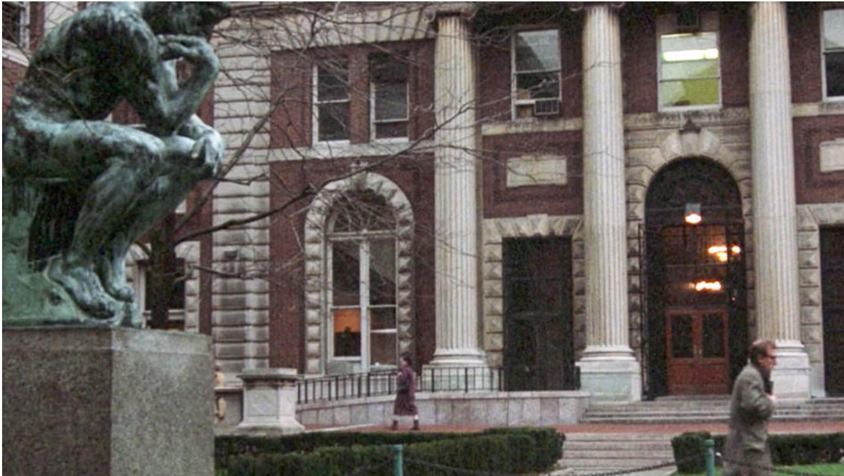
Woody Allen in "Hannah and Her Sisters."

New York City plays a dominant role in nearly all of Woody Allen's films, and the Oscar-winning Hannah and Her Sisters is no exception. In one scene, Allen takes a pensive walk past Columbia's Kent Hall and the replica of The Thinker .