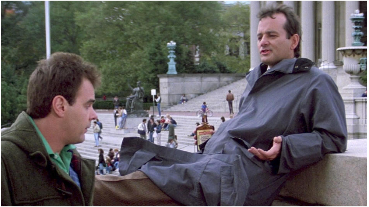
Dan Aykroyd and Bill Murray in "Ghostbusters."

At the beginning of this hit 1984 comedy, the soon-to-be Ghostbusters, played by Bill Murray, Dan Aykroyd, and Harold Ramis, get fired from Columbia's (sadly fictional) parapsychology department.