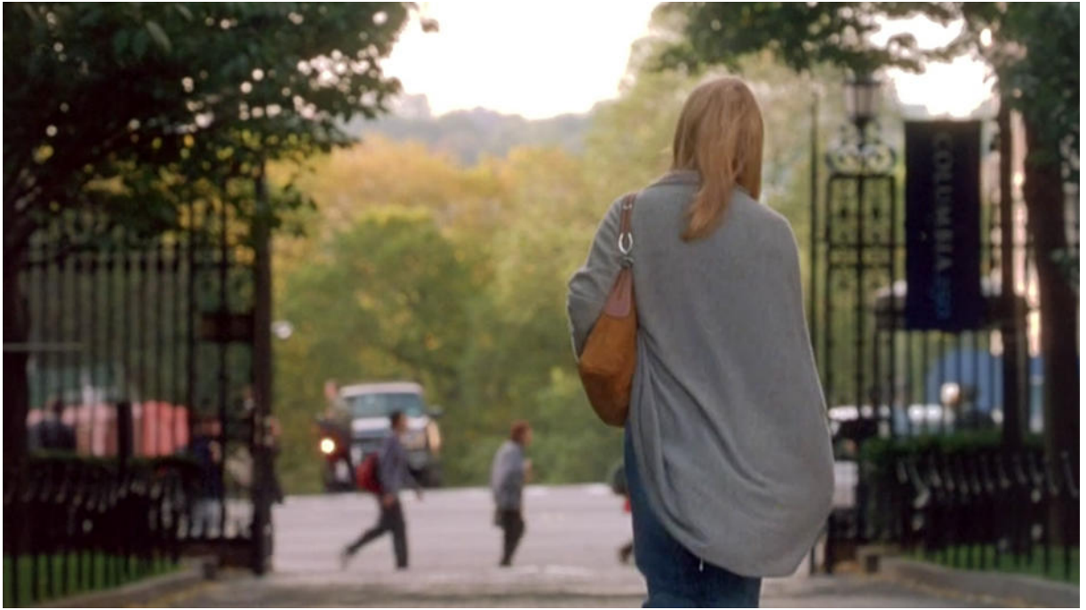
Laura Linney in "P.S."