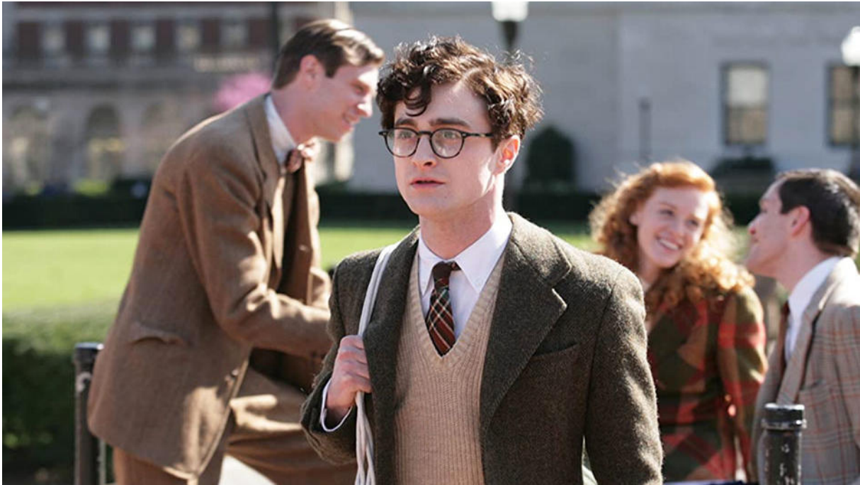
Daniel Radcliffe in "Kill Your Darlings."

This film, which stars Daniel Radcliffe as poet Allen Ginsberg '48CC, brought an infamous Columbia true-crime story to the screen: the 1944 Riverside Park murder of David Kammerer by Lucien Carr, a Columbia College student and member of the Beat Generation.