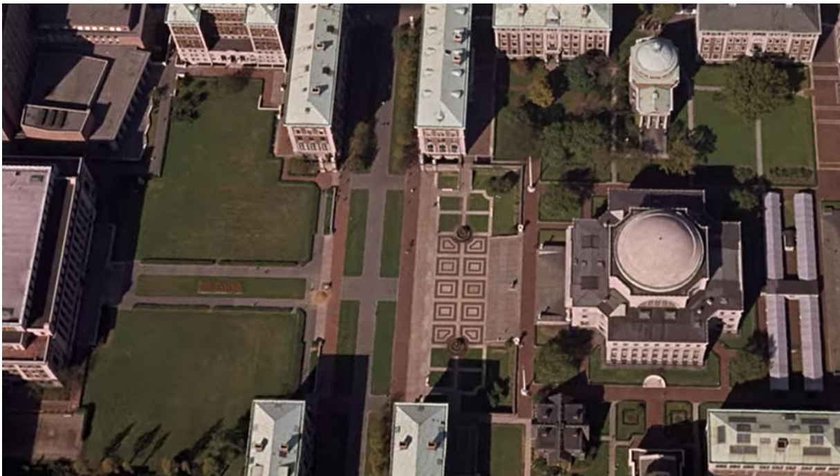
West Side Story