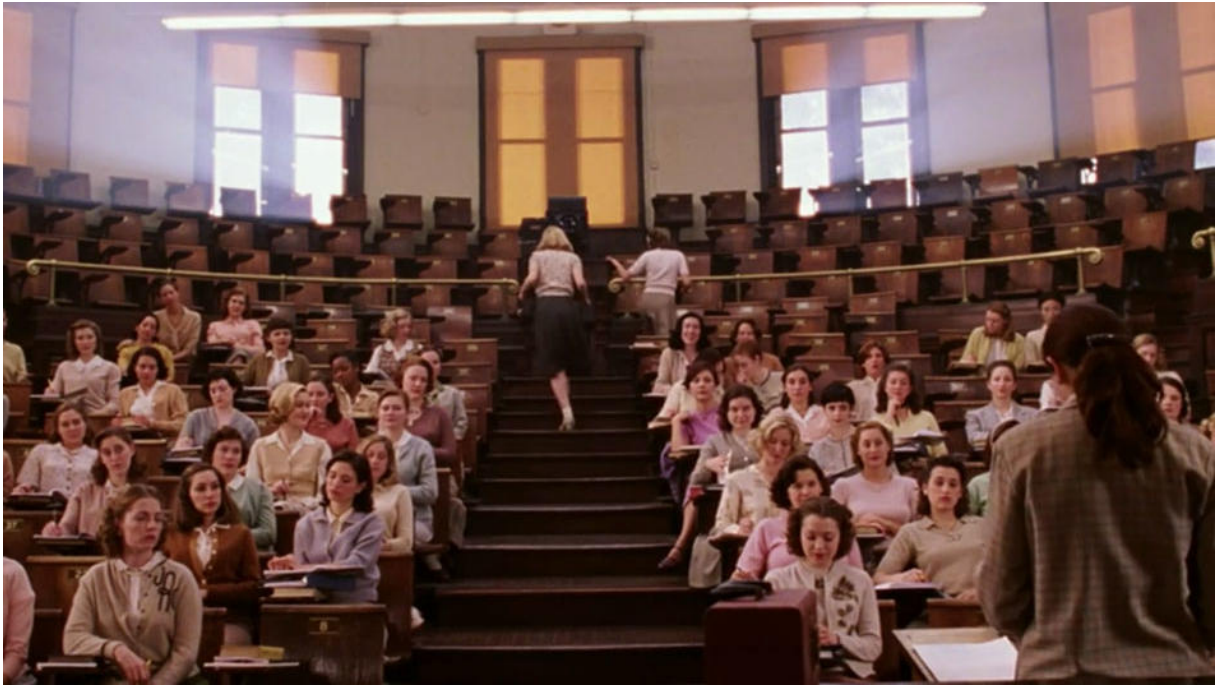
Julia Roberts (bottom right) and cast members of "Mona Lisa Smile."

309 Havemeyer made for the perfect vintage backdrop for this 1950s period drama. The classroom isn't the film's only Columbia connection — alumnae Maggie Gyllenhaal '99CC and Julia Stiles '05CC are costars.