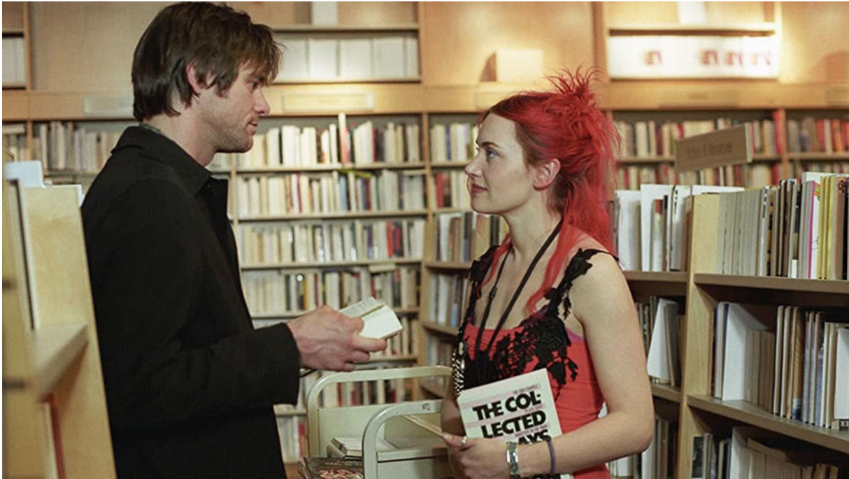
Jim Carrey and Kate Winslet in "Eternal Sunshine of the Spotless Mind."

In this supernatural romance, Kate Winslet's character, Clementine, works at Barnes & Noble. In reality, the location is the Columbia University Bookstore at 2922 Broadway.