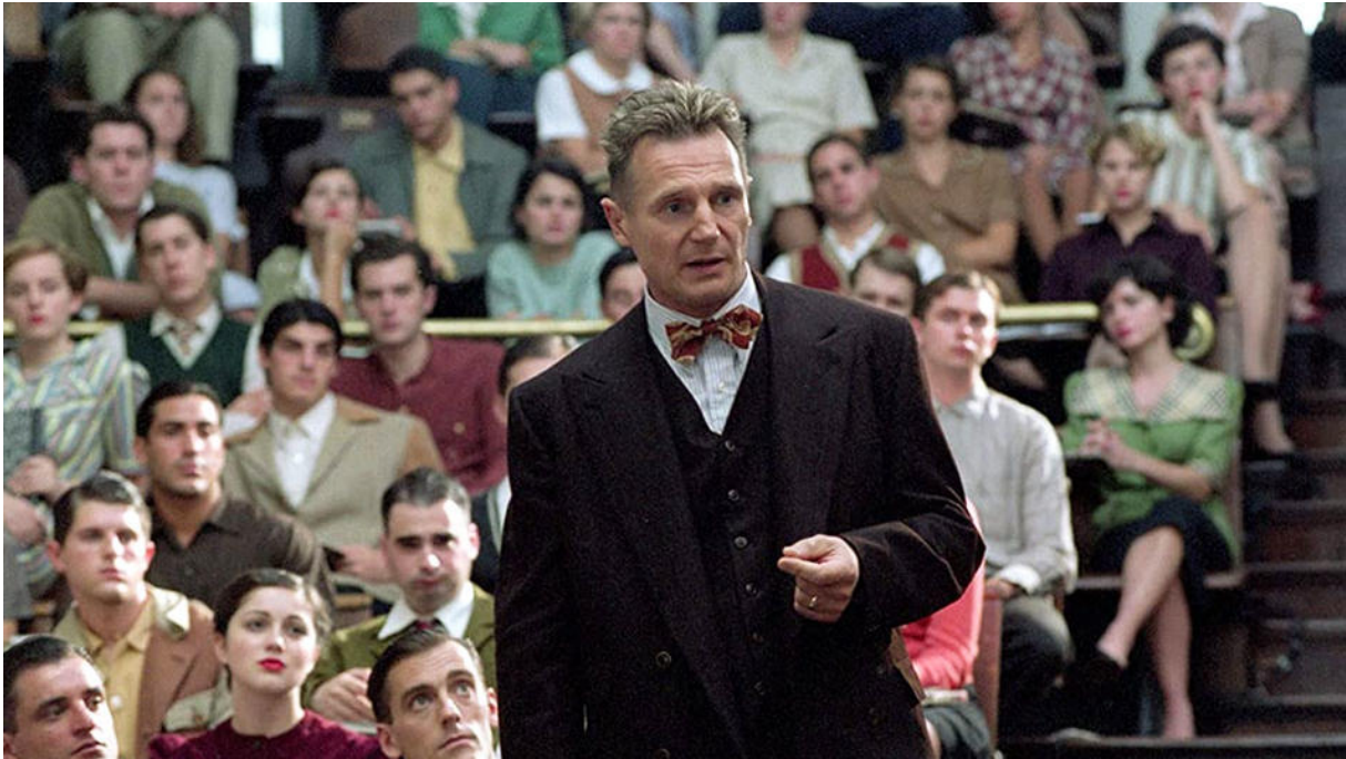
Liam Neeson in "Kinsey."

309 Havemeyer appears yet again in this biopic of Alfred Kinsey, the influential sexologist who broke taboos and founded the Institute for Sex Research at Indiana University in 1947. College alum Bill Condon '76CC wrote and directed the film.