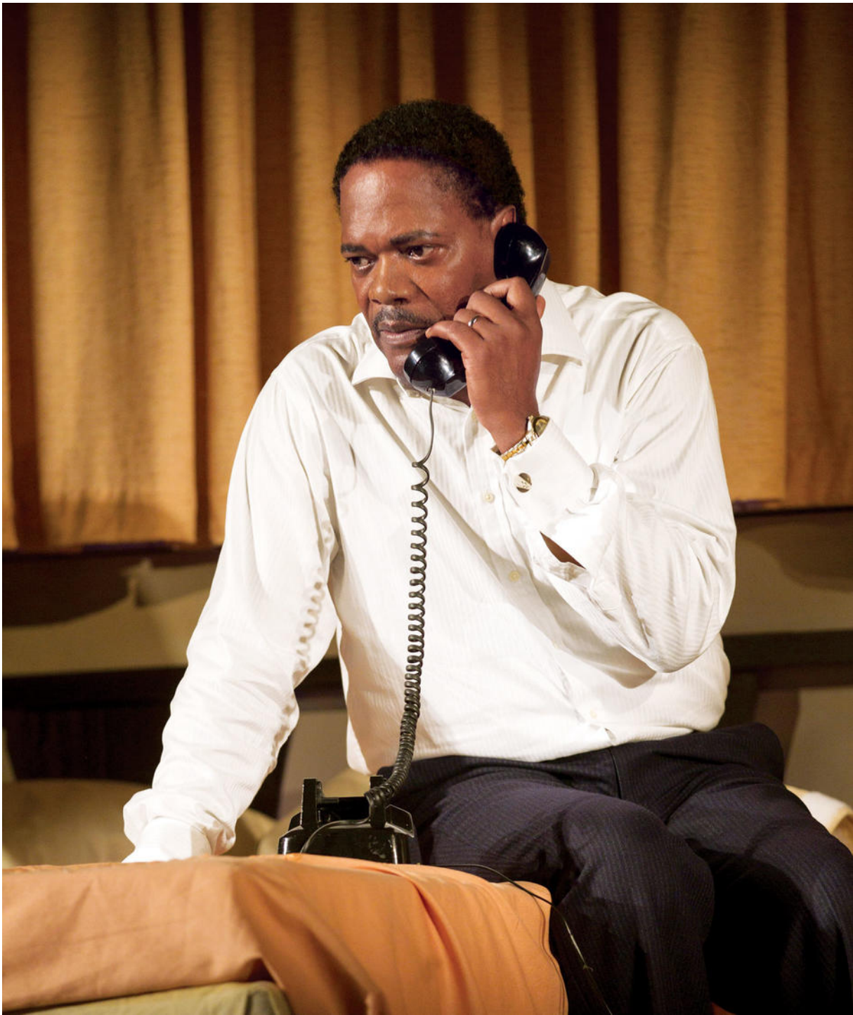
Samuel L. Jackson as Martin Luther King Jr.