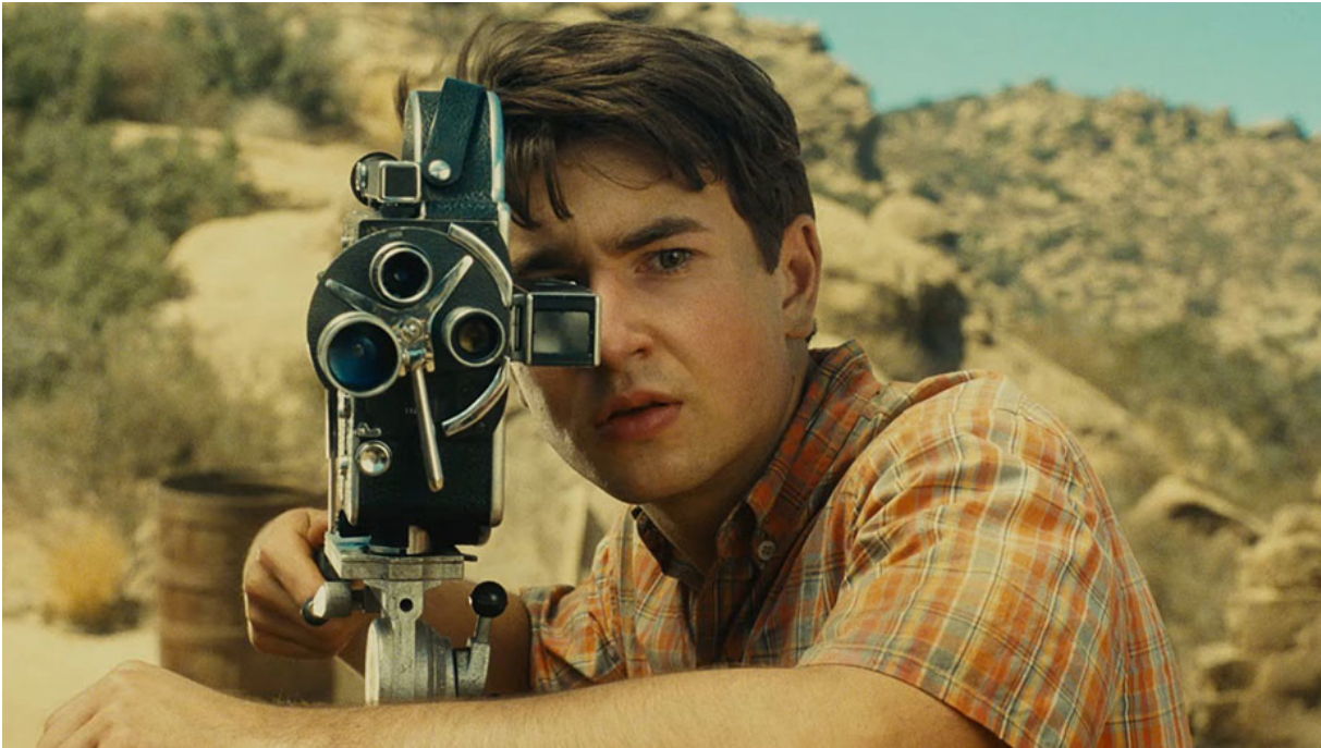
Gabriel LaBelle in "The Fabelmans."