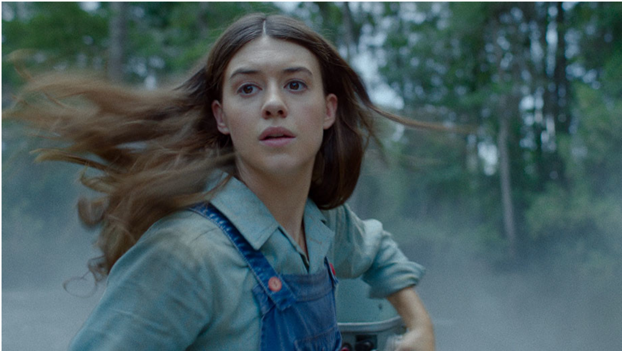
Daisy Edgar-Jones in "Where the Crawdads Sing."

This long-awaited sequel to the 1986 blockbuster Top Gun was directed by Joseph Kosinski '99GSAPP, who studied architecture at Columbia and is known for his work with computer-generated imagery and other special effects. Theatrical release: May 27 / Stream on Paramount+