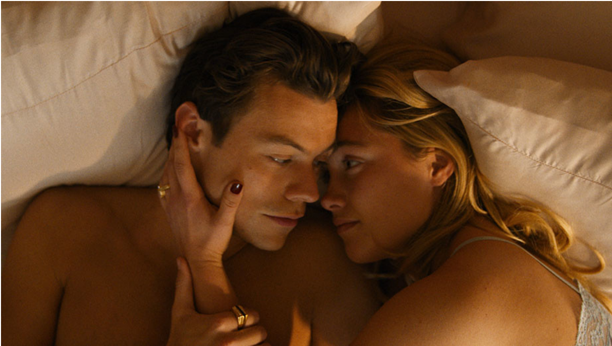
Harry Styles and Florence Pugh in "Don't Worry Darling."