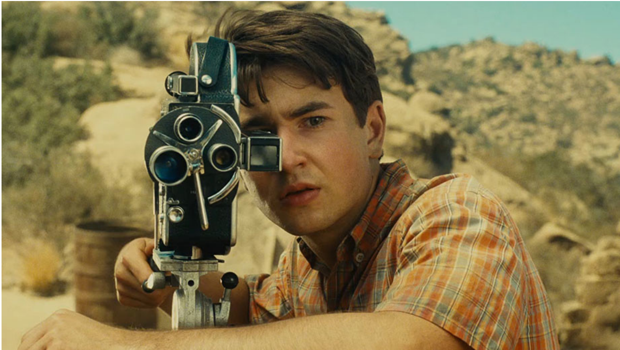
Gabriel LaBelle in "The Fabelmans."