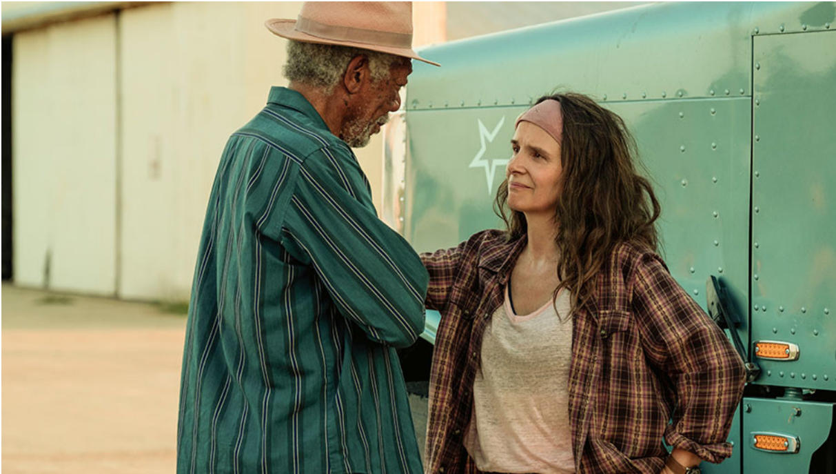
Morgan Freeman and Juliette Binoche in "Paradise Highway." (Lionsgate)