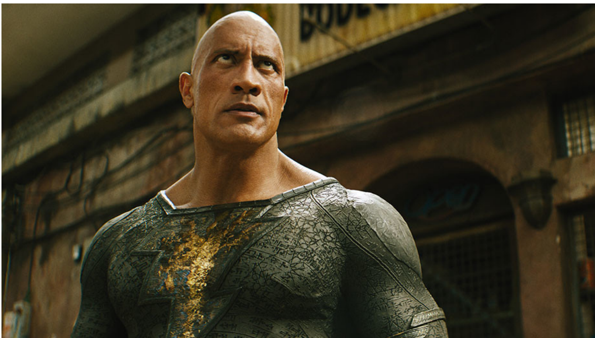
Dwayne Johnson in "Black Adam." (Warner Brothers Pictures)