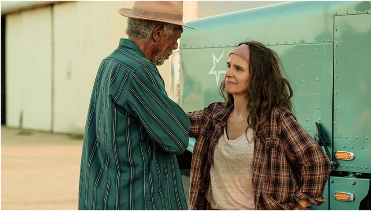
Morgan Freeman and Juliette Binoche in "Paradise Highway."