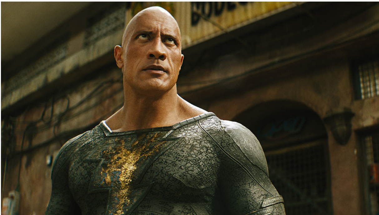
Dwayne Johnson in "Black Adam." (Warner Brothers Pictures)