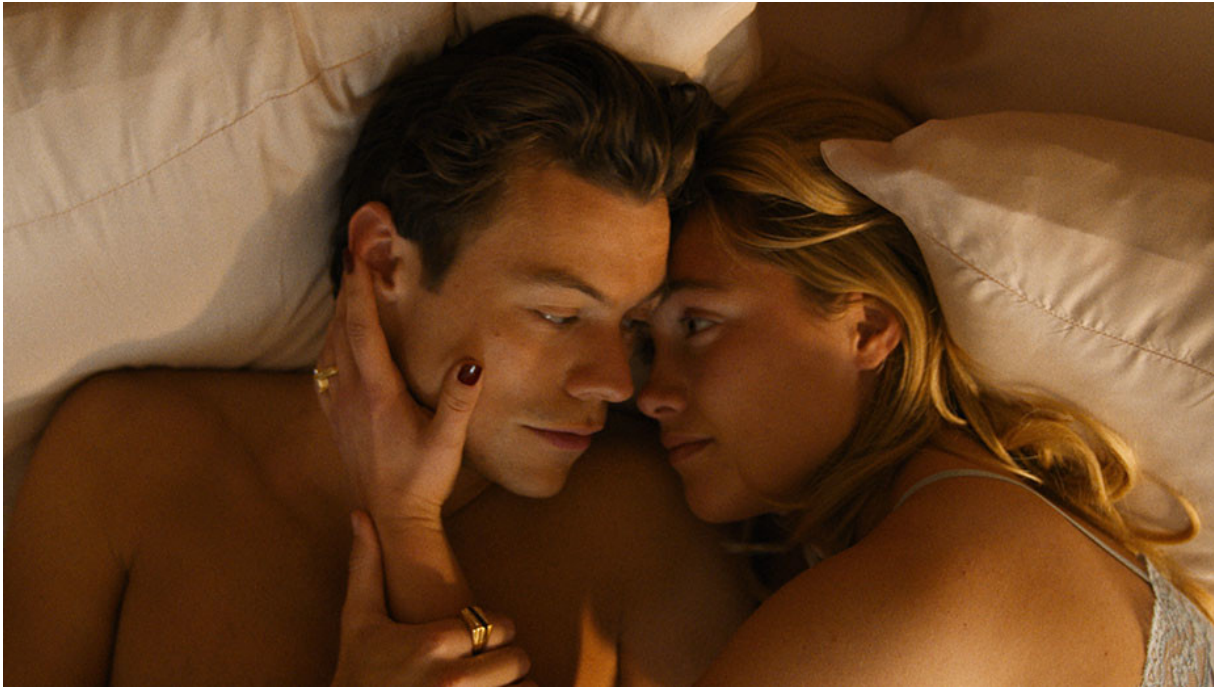
Harry Styles and Florence Pugh in "Don't Worry Darling."