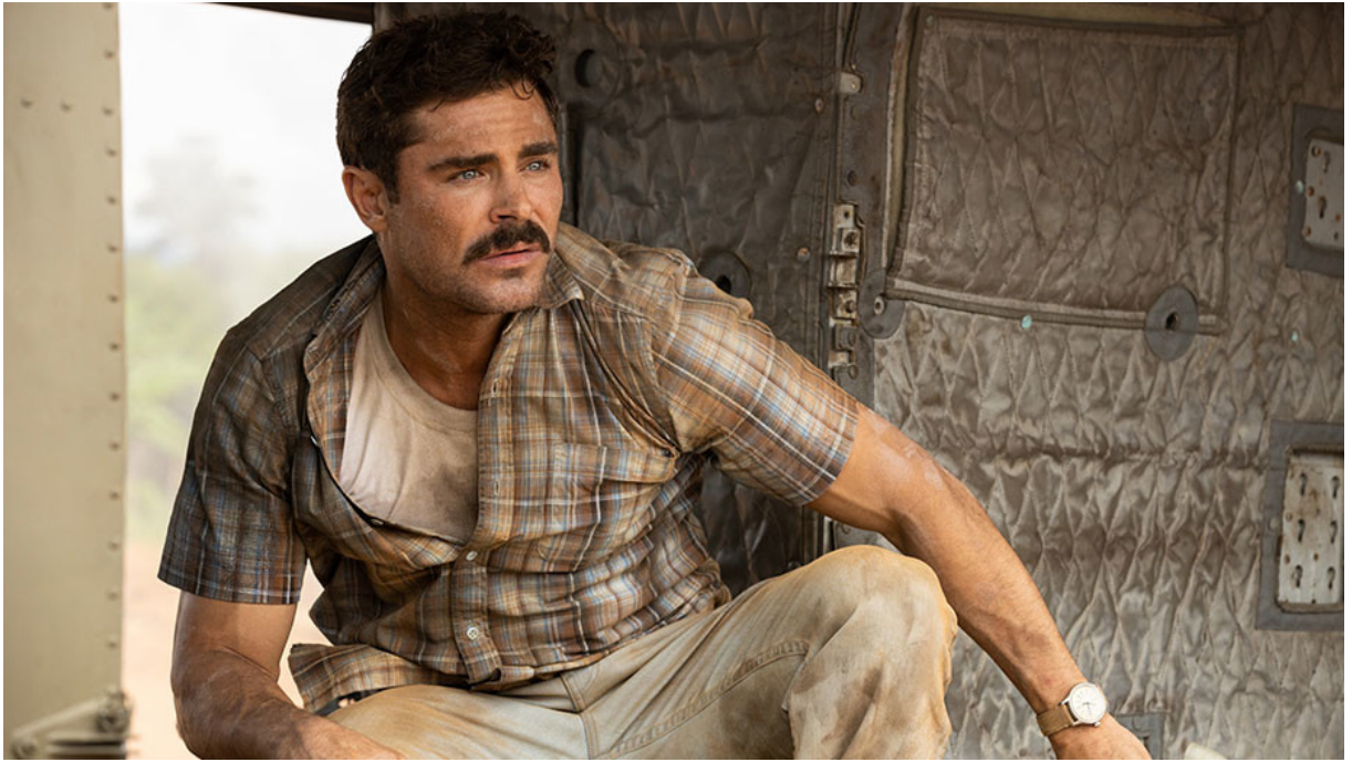
Zac Efron in "The Greatest Beer Run Ever."