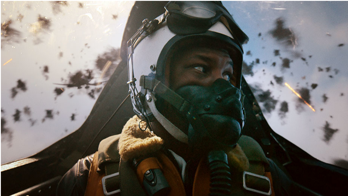
Jonathan Majors in "Devotion."