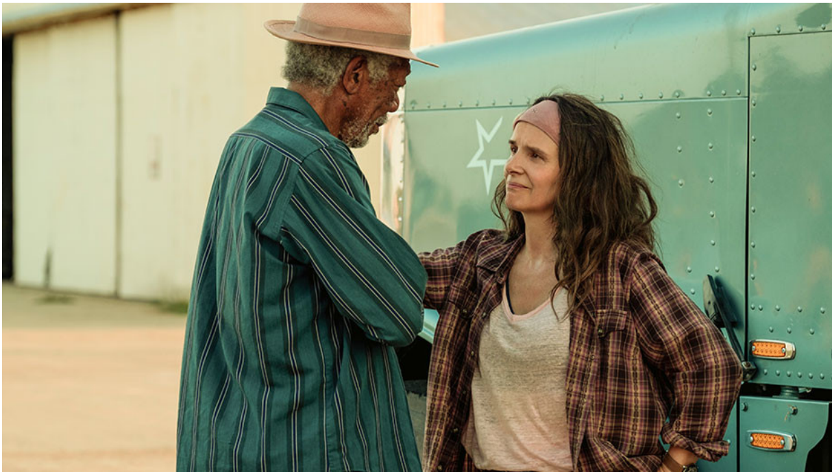
Morgan Freeman and Juliette Binoche in "Paradise Highway."