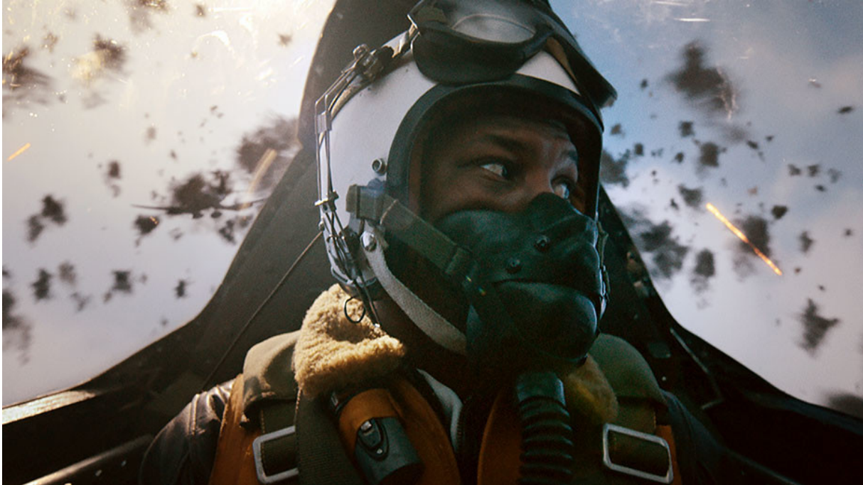
Jonathan Majors in "Devotion."