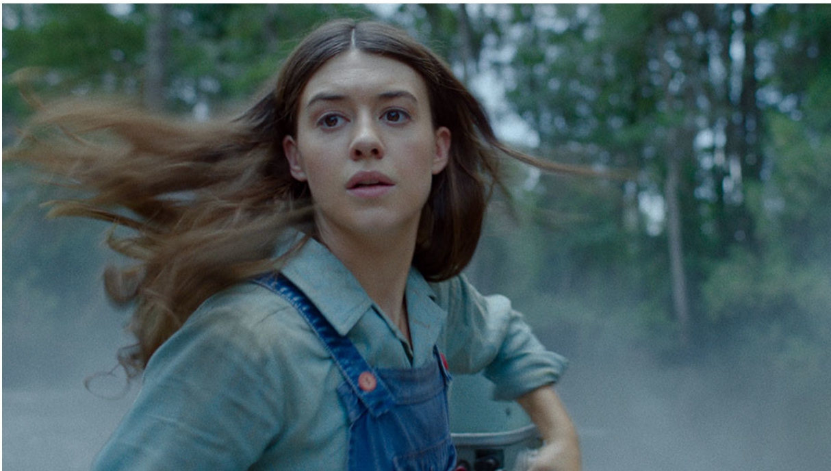
Daisy Edgar-Jones in "Where the Crawdads Sing."

This long-awaited sequel to the 1986 blockbuster Top Gun was directed by Joseph Kosinski '99GSAPP, who studied architecture at Columbia and is known for his work with computer-generated imagery and other special effects. Theatrical release: May 27 / Stream on Paramount+