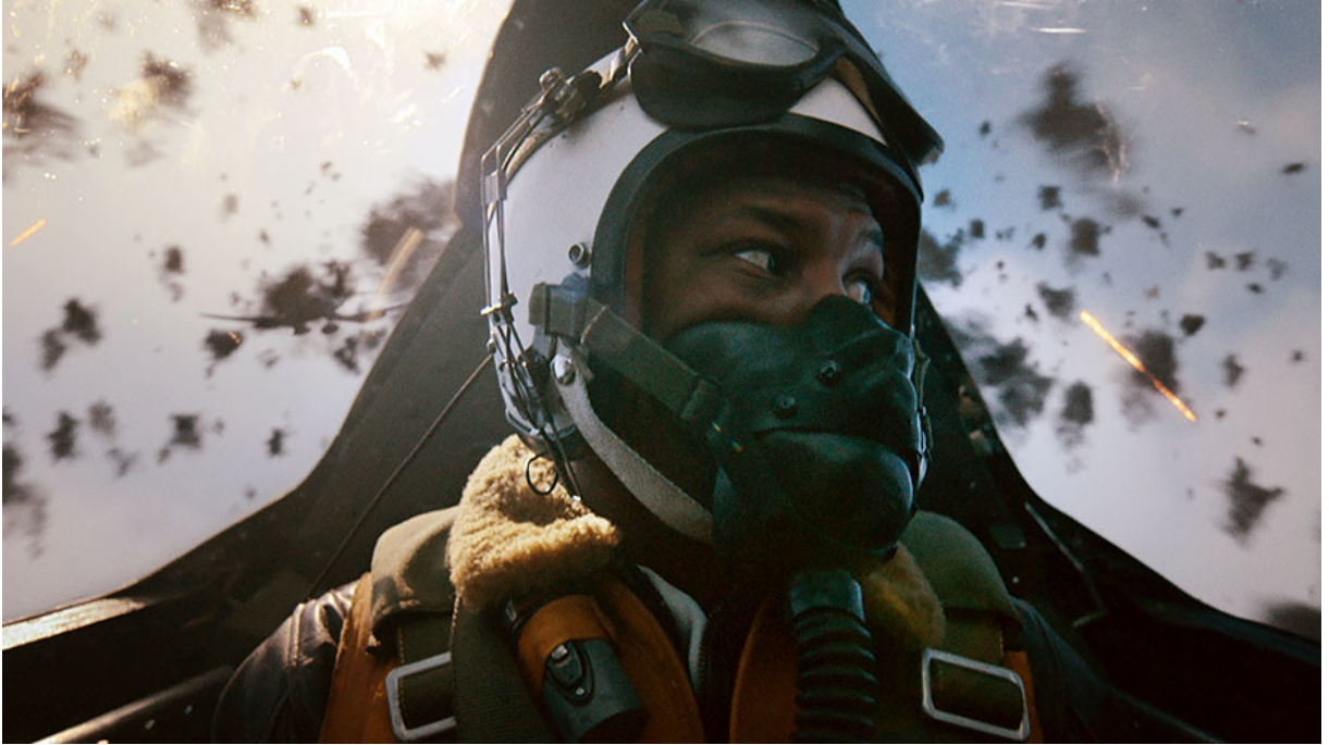
Jonathan Majors in "Devotion."