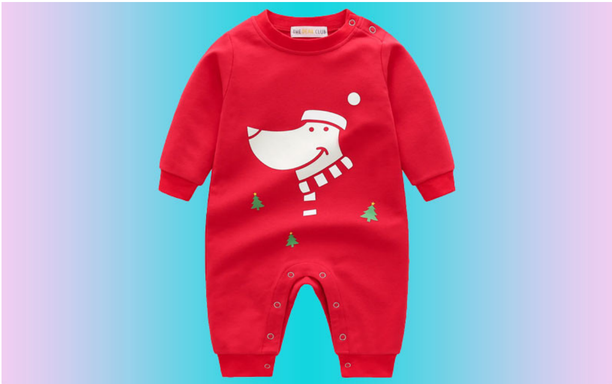
The Dear Club