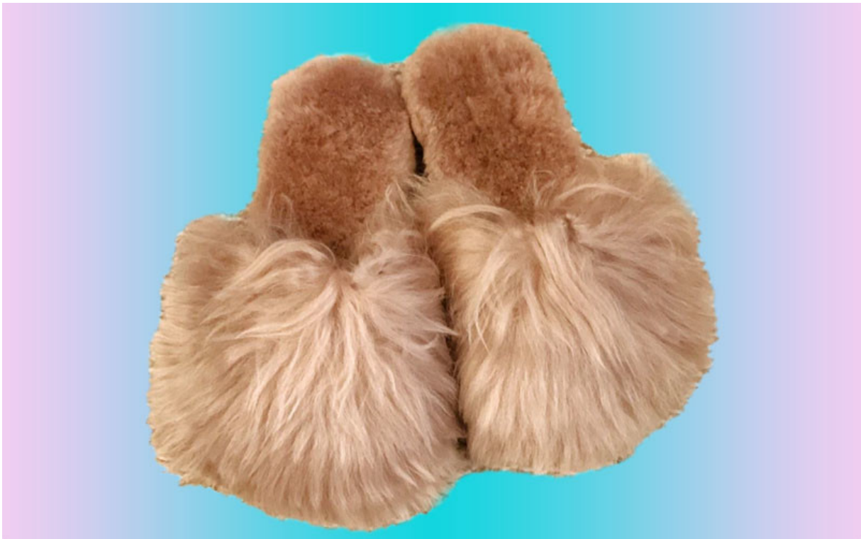
Côte à Coast