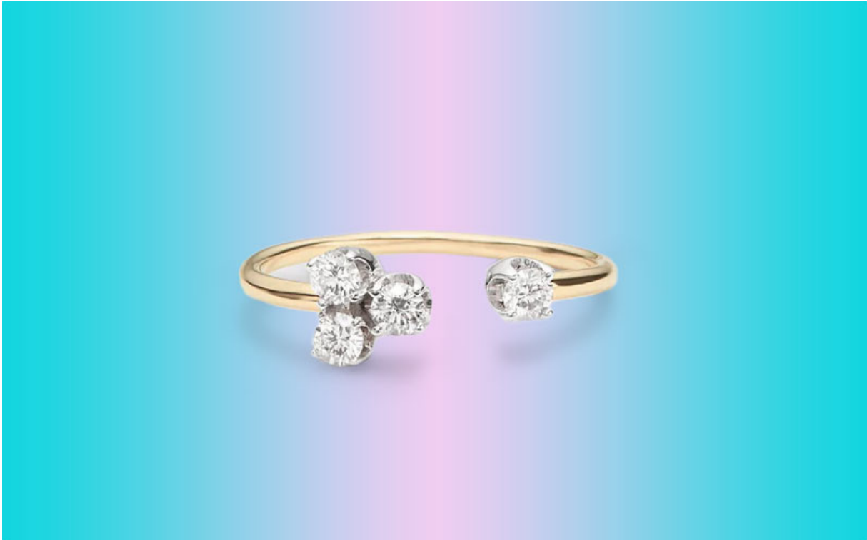
The Clear Cut