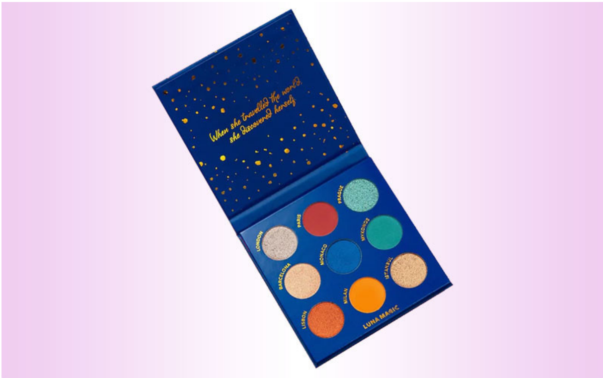
AMP Beauty LA