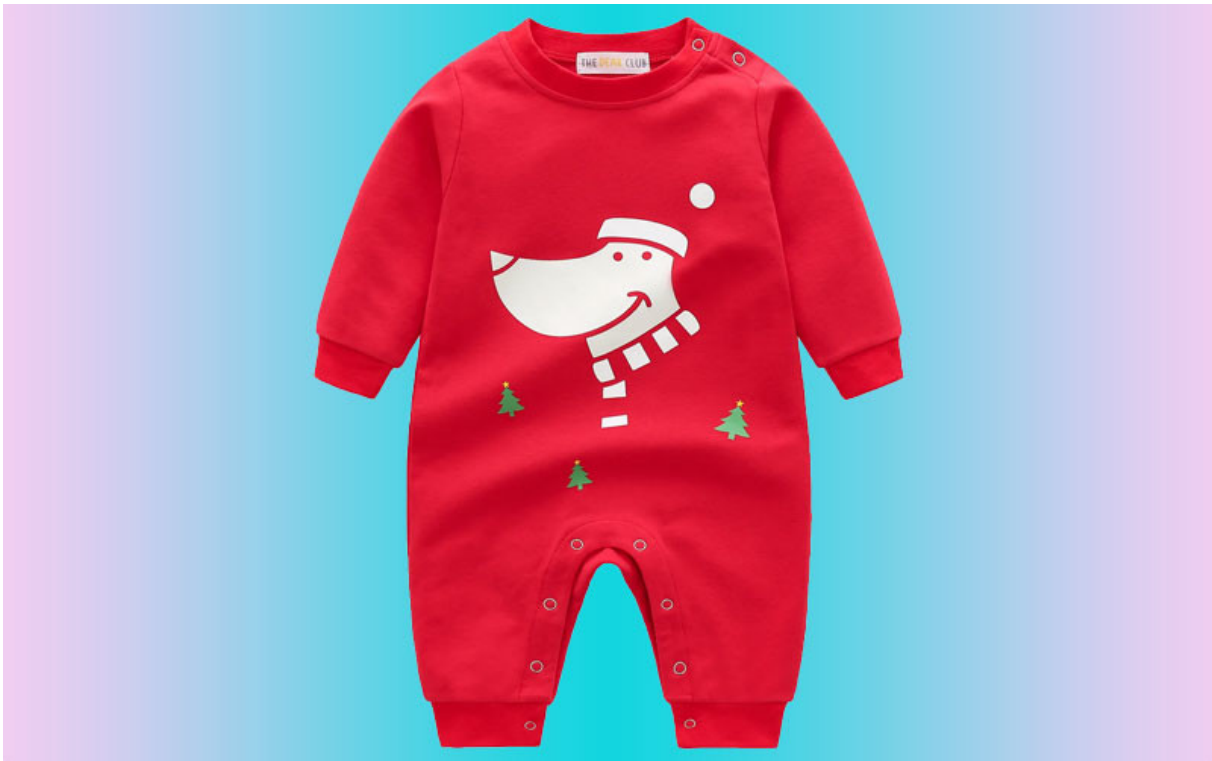
The Dear Club