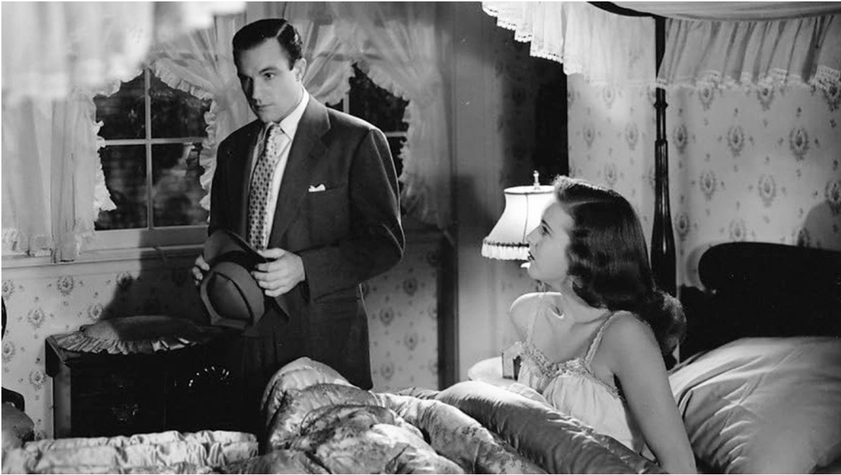
Gene Kelly and Deanna Durbin in "Christmas Holiday."