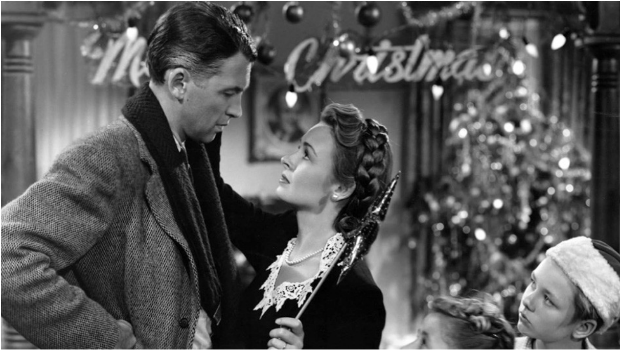
James Stewart and Donna Reed in "It's a Wonderful Life."