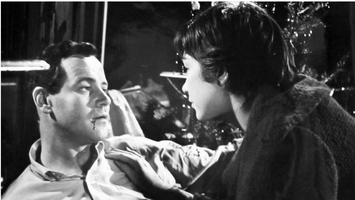
Jack Lemmon and Shirley MacLaine in "The Apartment."