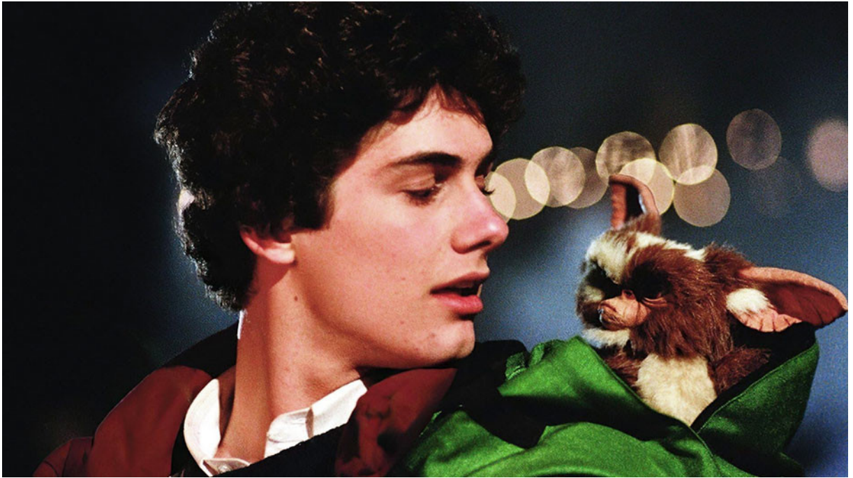
Zach Galligan in "Gremlins."