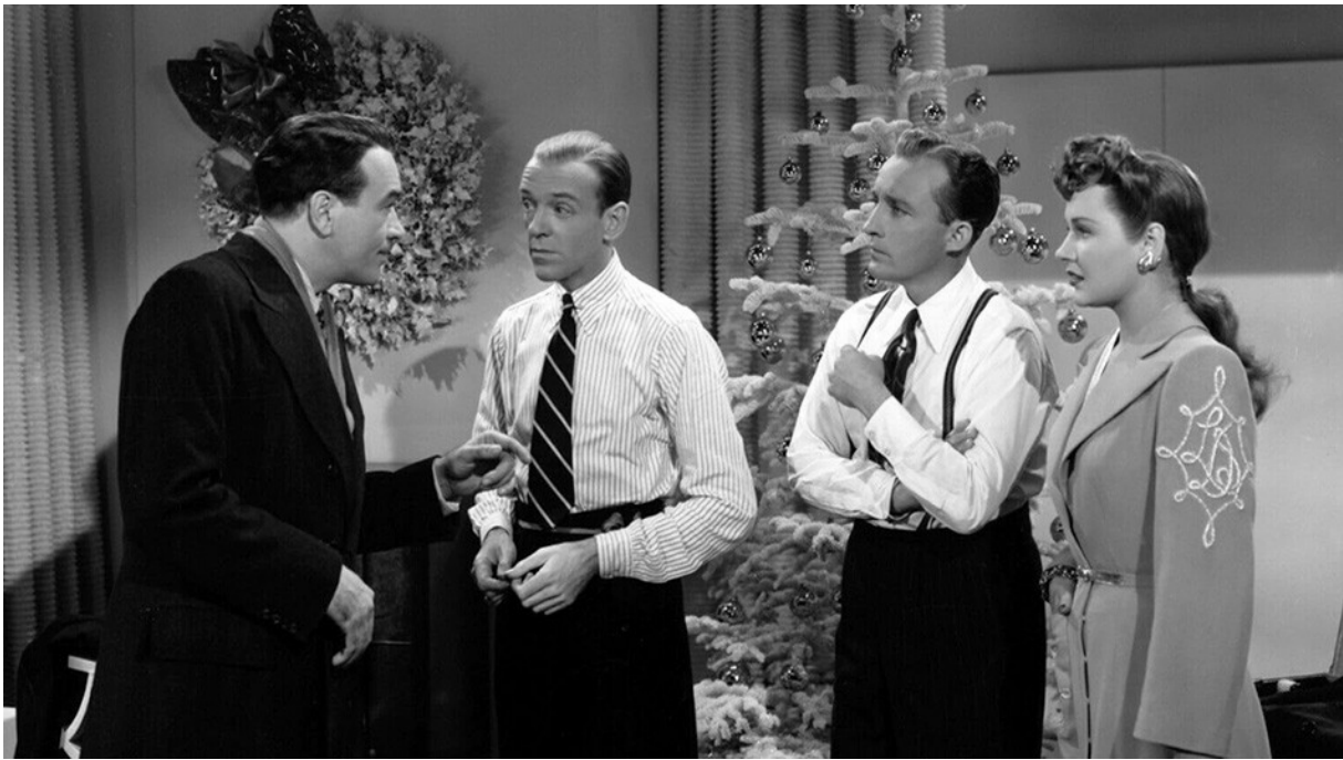
Walter Abel, Fred Astaire, Bing Crosby, and Virginia Dale in "Holiday Inn."