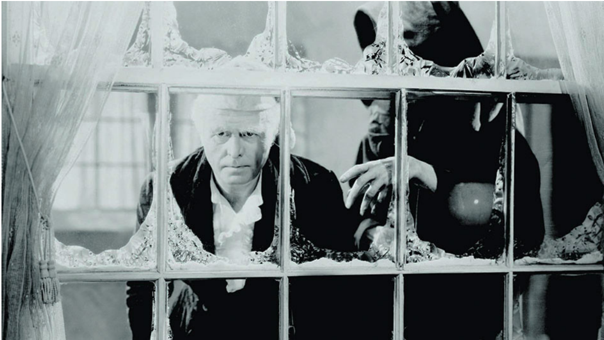
Reginald Owen in "A Christmas Carol."

the 1959 classic Some Like it Hot . Their follow-up comedy The Apartment , which takes place over Christmas and New Year's Eve, is about a corporate drudge (Jack Lemmon) who lets senior managers use his Upper West Side bachelor pad for their extramarital romps. The film garnered five 1960 Oscars, including best picture, best director, and best original screenplay.