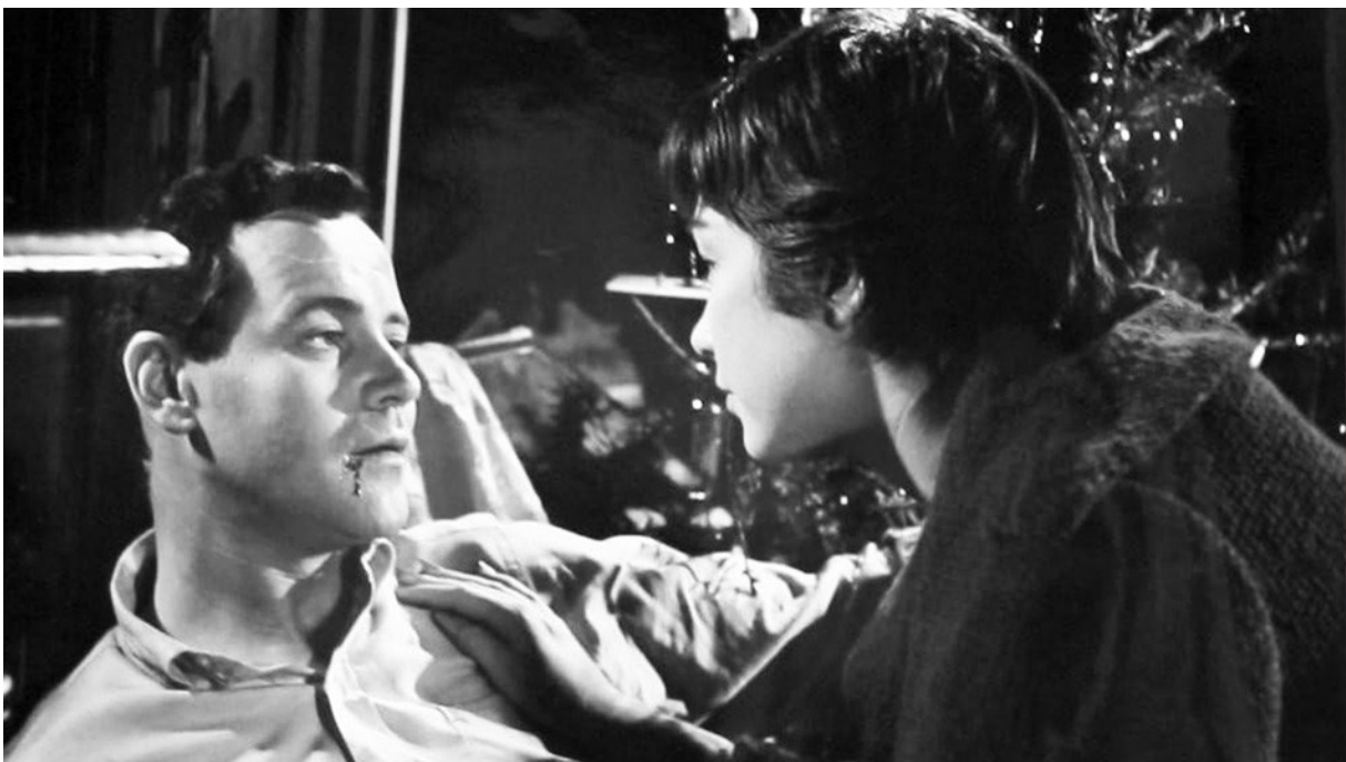
Jack Lemmon and Shirley MacLaine in "The Apartment."