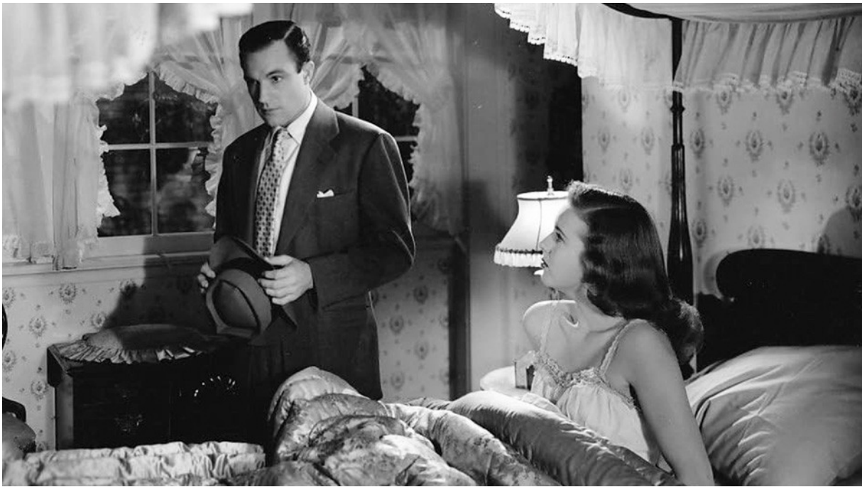
Gene Kelly and Deanna Durbin in "Christmas Holiday."