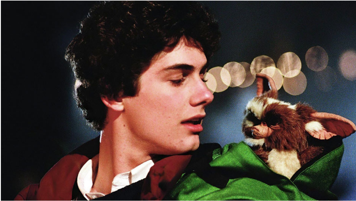
Zach Galligan in "Gremlins."