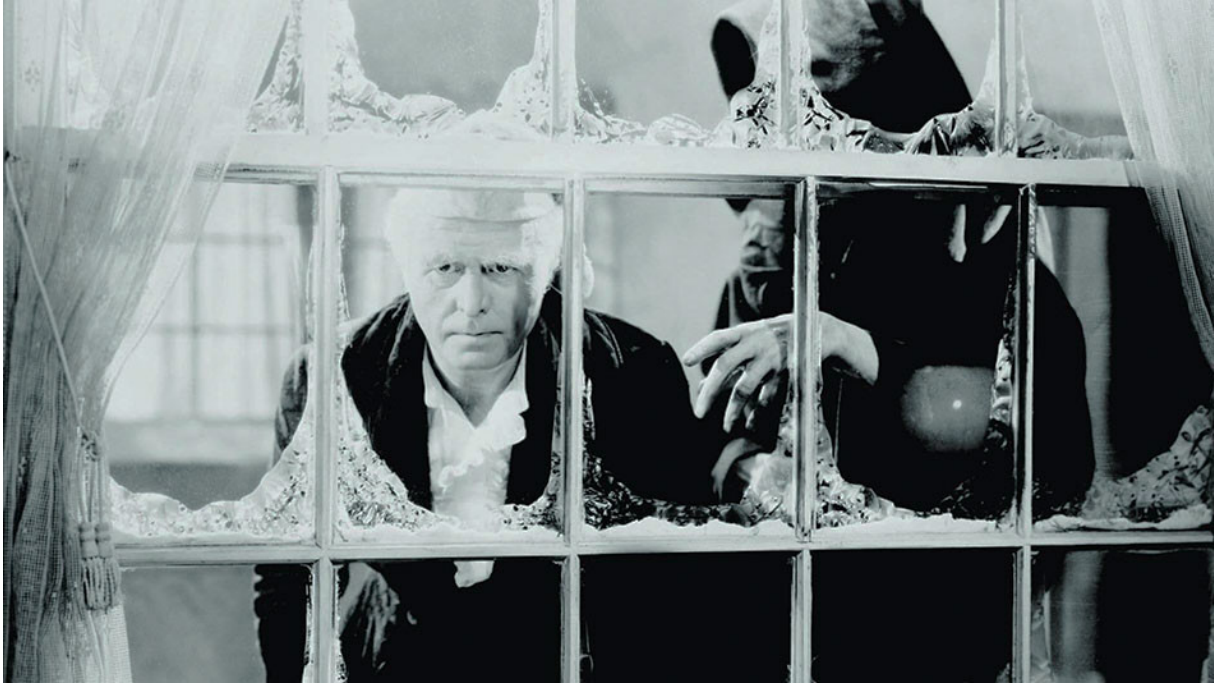
Reginald Owen in "A Christmas Carol."

the 1959 classic Some Like it Hot . Their follow-up comedy The Apartment , which takes place over Christmas and New Year's Eve, is about a corporate drudge (Jack Lemmon) who lets senior managers use his Upper West Side bachelor pad for their extramarital romps. The film garnered five 1960 Oscars, including best picture, best director, and best original screenplay.