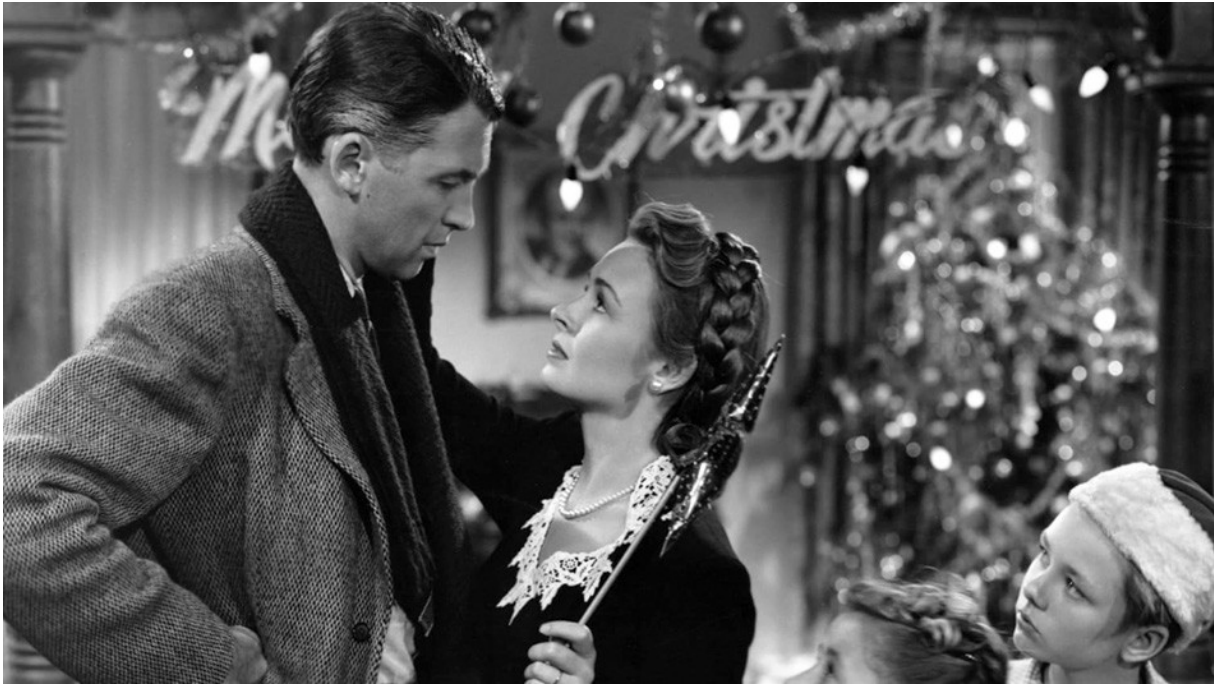
James Stewart and Donna Reed in "It's a Wonderful Life."