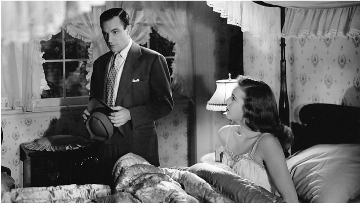
Gene Kelly and Deanna Durbin in "Christmas Holiday."