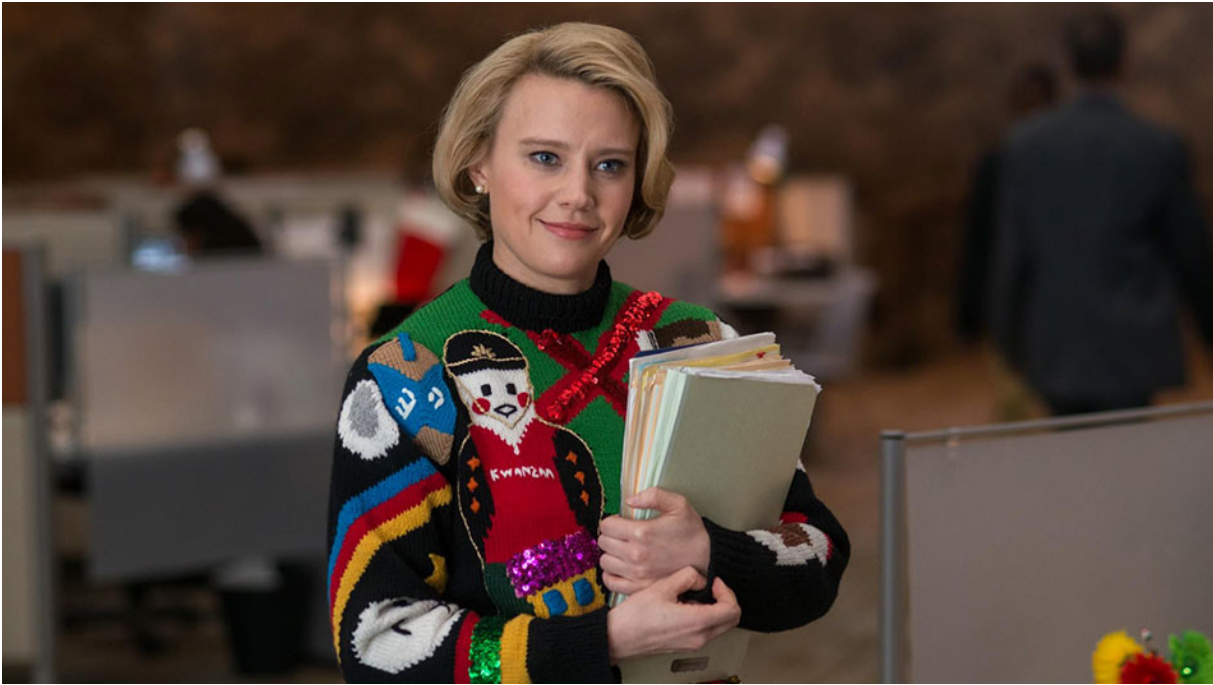
Kate McKinnon in "Office Christmas Party."