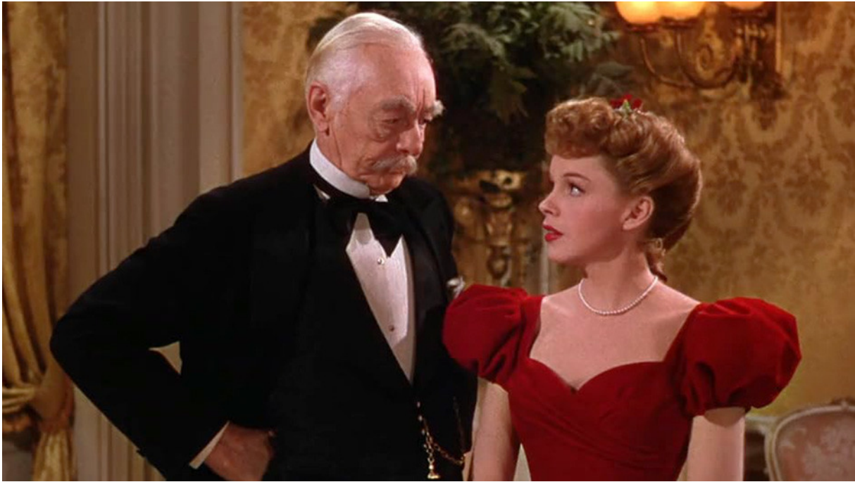
Harry Davenport and Judy Garland in "Meet Me in Saint Louis."