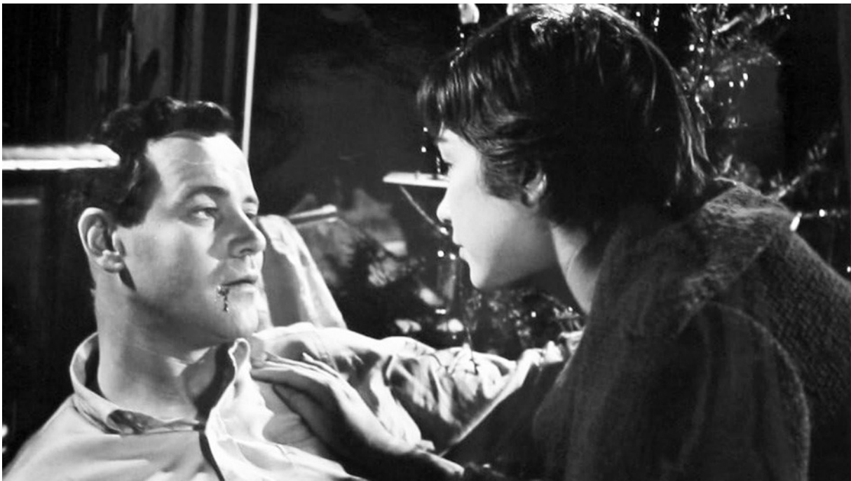
Jack Lemmon and Shirley MacLaine in "The Apartment."