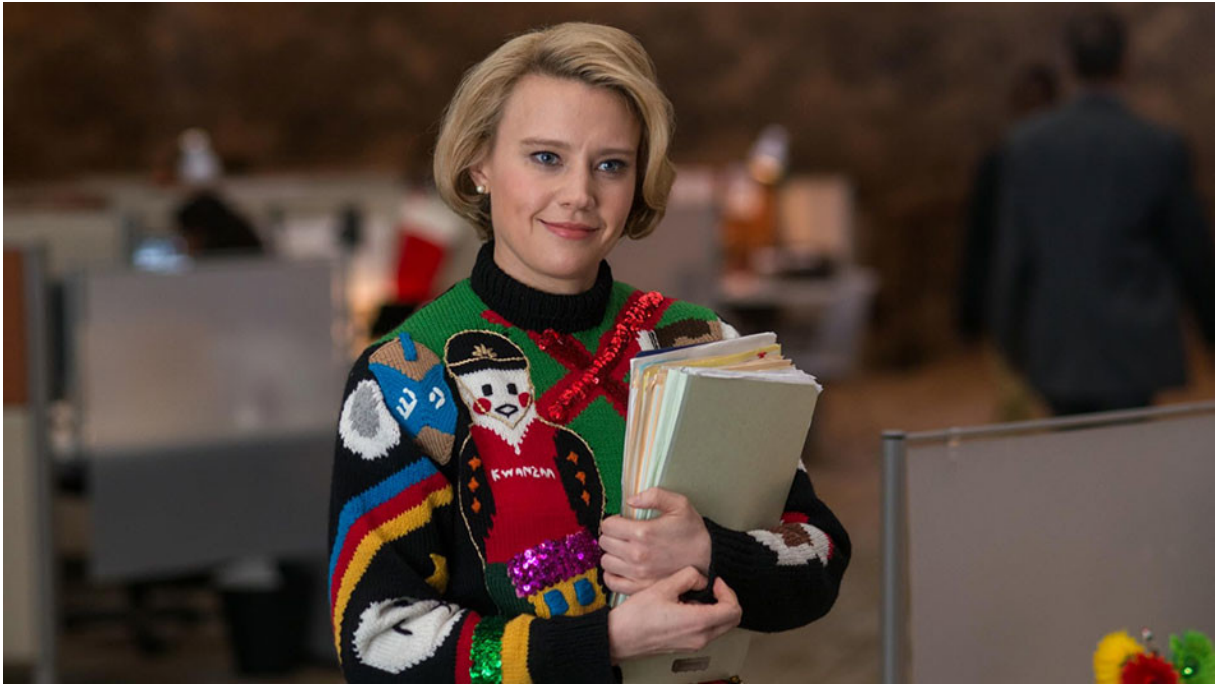
Kate McKinnon in "Office Christmas Party."