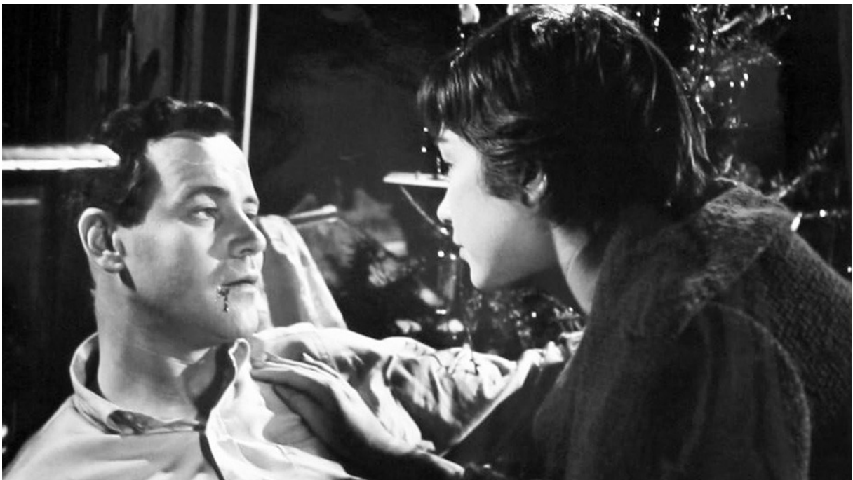
Jack Lemmon and Shirley MacLaine in "The Apartment."