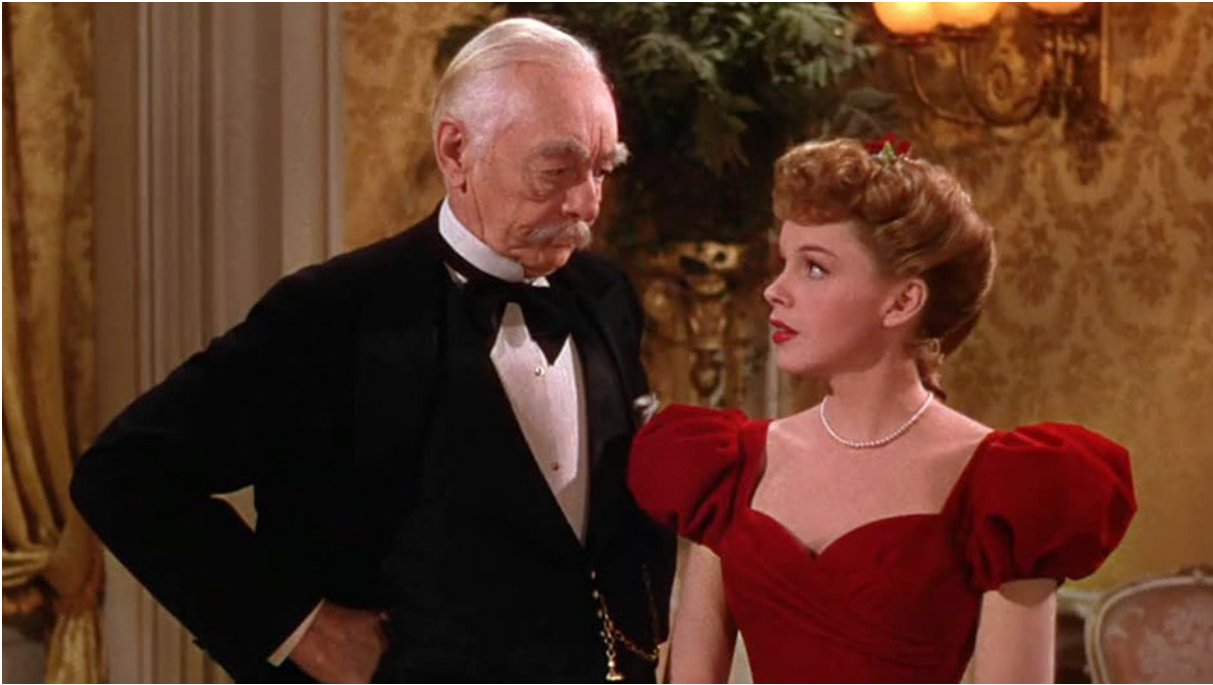
Harry Davenport and Judy Garland in "Meet Me in Saint Louis."