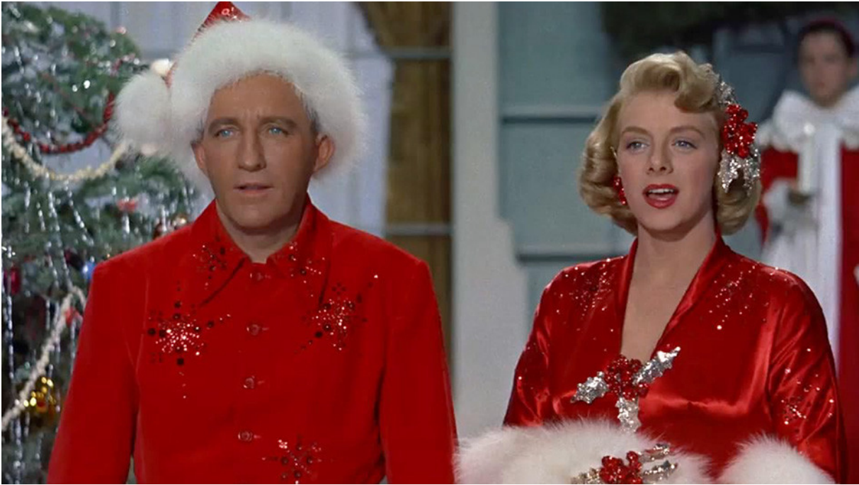
Bing Crosby and Rosemary Clooney in "White Christmas."