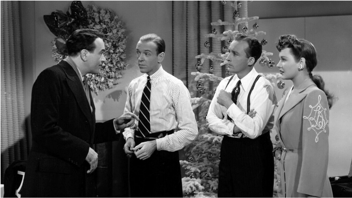
Walter Abel, Fred Astaire, Bing Crosby, and Virginia Dale in "Holiday Inn."