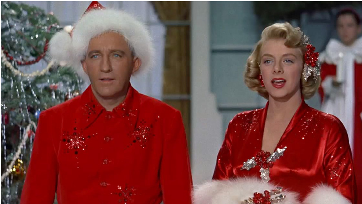
Bing Crosby and Rosemary Clooney in "White Christmas."