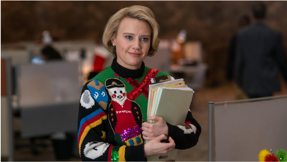
Kate McKinnon in "Office Christmas Party."