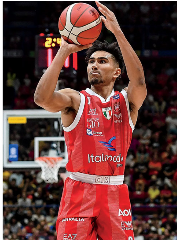
Lô playing for the Columbia Lions (above) and Olimpia Milano (right).

Maodo Lô '16CC , a former Columbia Lions basketball player, helped Team Germany win its first-ever gold medal at the FIBA Basketball World Cup, held this past summer in Manila. Lô, who was born and raised in Berlin, has won several national championships with German professional teams since graduating from Columbia and represented his home country at the 2020 Tokyo Olympics. He is currently a guard for the Italian team Olimpia Milano.