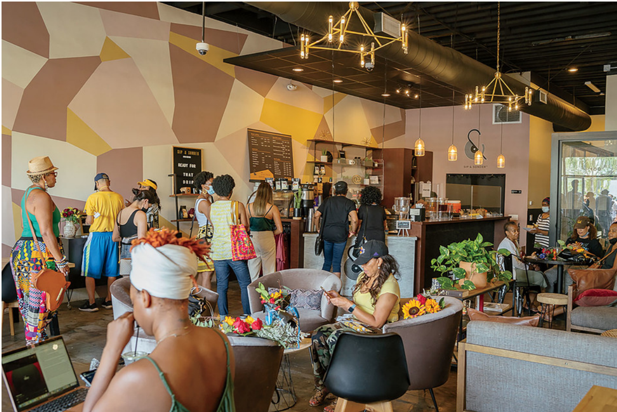
Sip & Sonder in Inglewood, California.