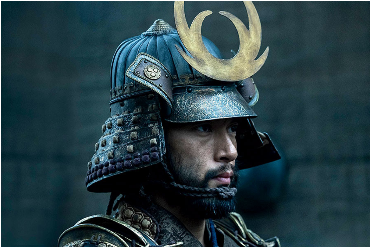
A scene from Shōgun.