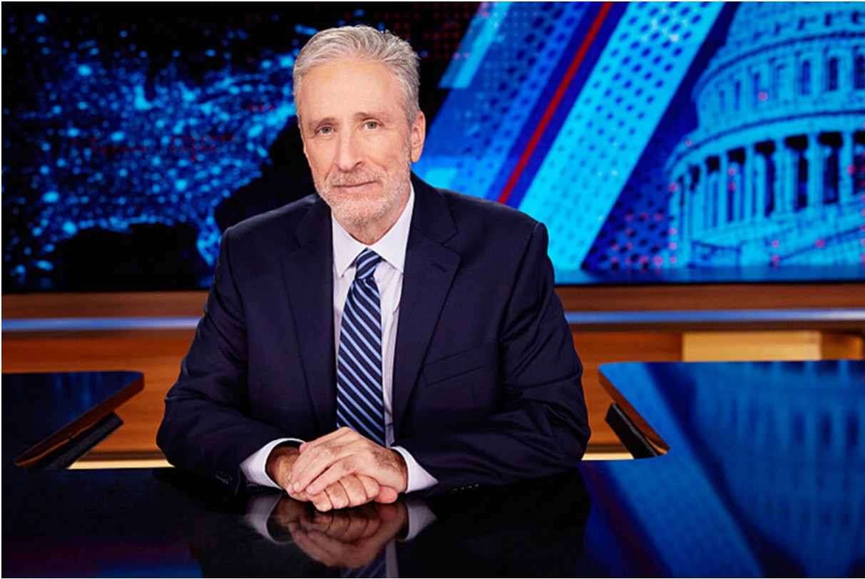
Jon Stewart on The Daily Show.