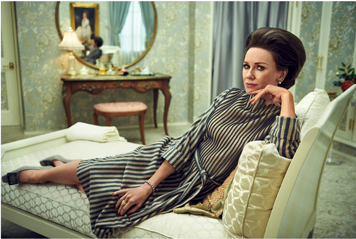
Naomi Watts in Feud: Capote vs. The Swans .