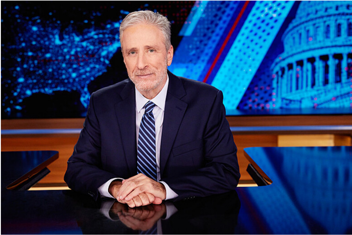
Jon Stewart on The Daily Show.