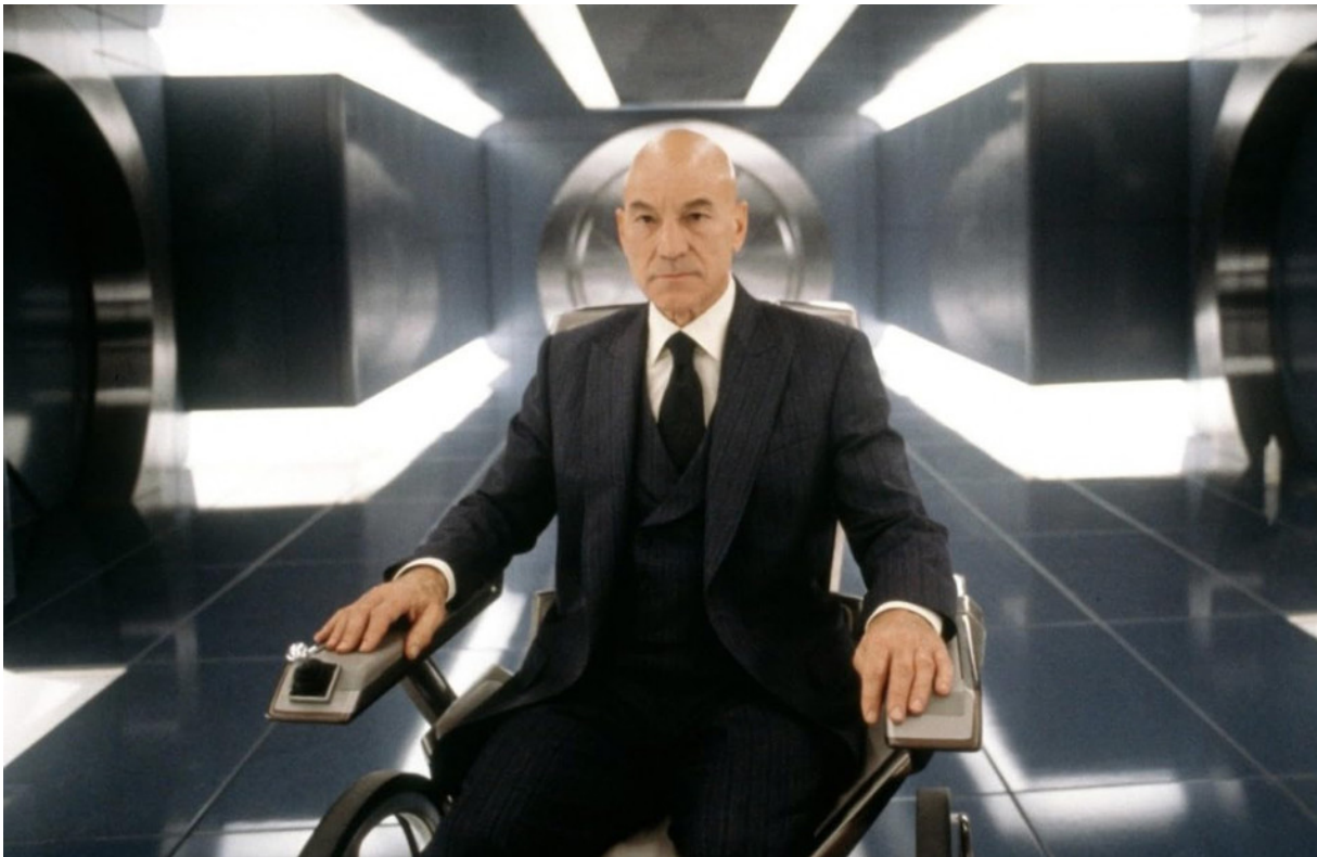
Patrick Stewart as Professor X in X-Men, 2000.