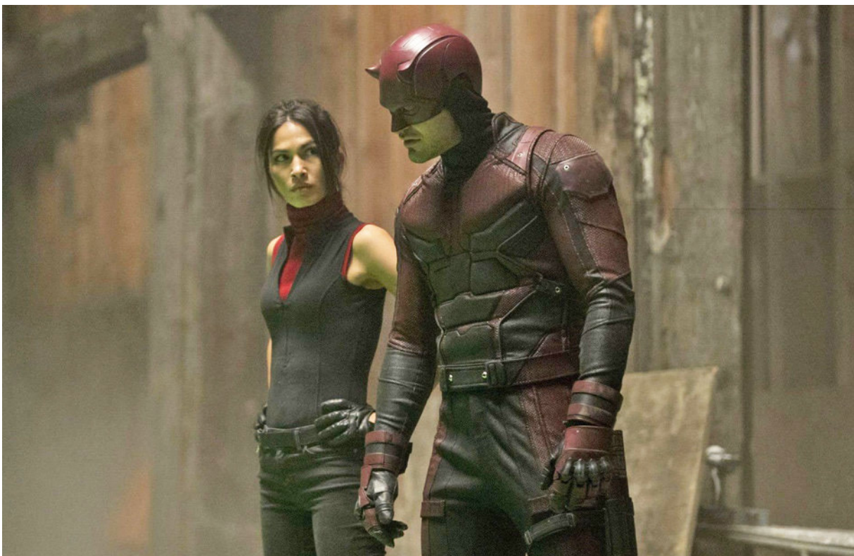
Elodie Yung and Charlie Cox as Elektra Natchios and Matt Murdock in the Netflix series Daredevil.