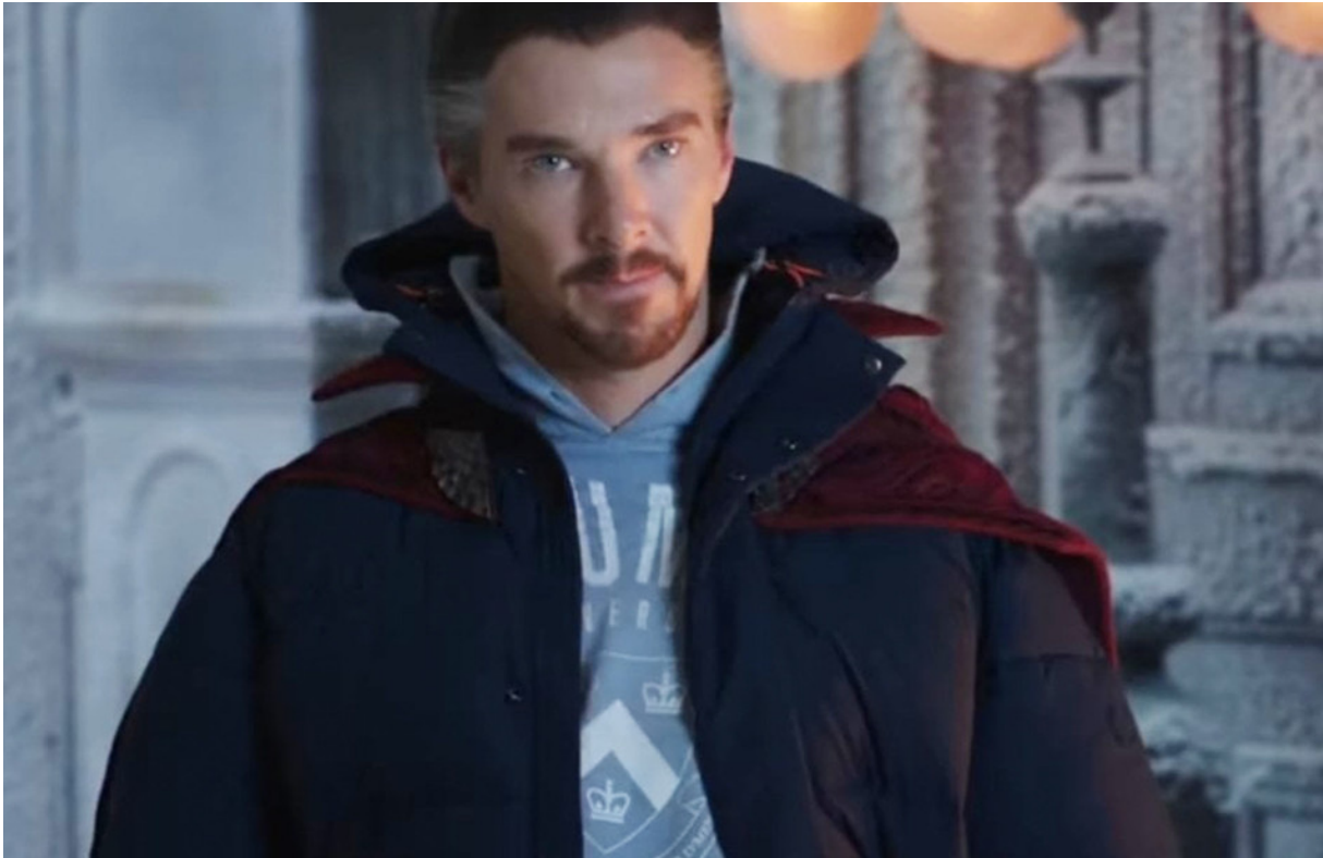
Benedict Cumberbatch flaunts a Columbia hoodie as Dr. Strange in Spider-Man: No Way Home, 2021.