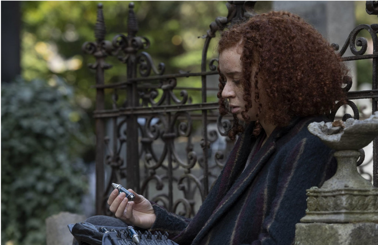
Erin Kellyman as Karli Morgenthau, a female version of Karl Morgenthau, in the limited series The Falcon and the Winter Soldier, 2021.