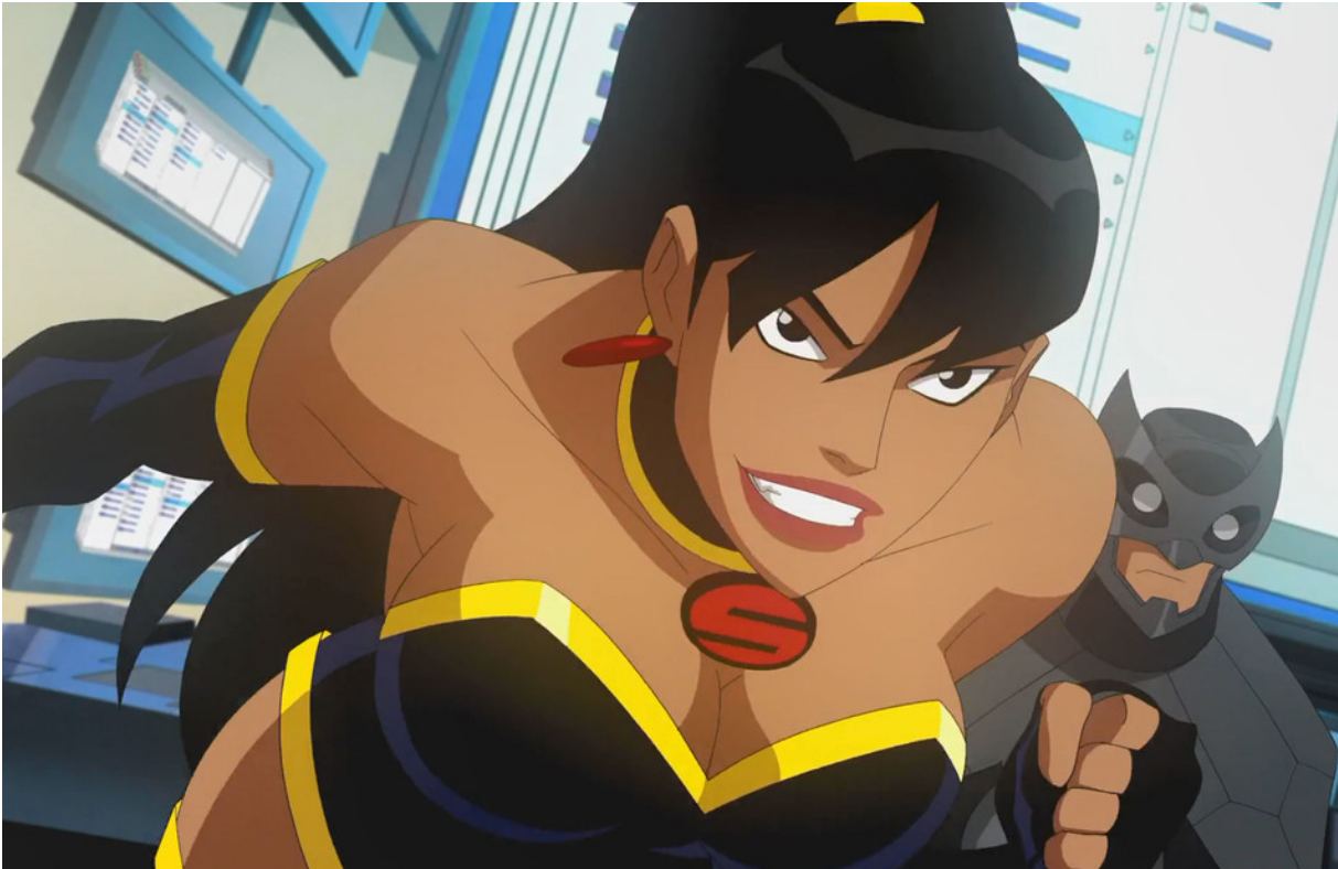
The character of Superwoman in Justice League: Crisis on Two Earths , 2010. (Warner Bros. Animation / DC Entertainment)