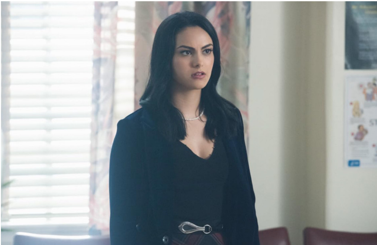
Camila Mendes as Veronica Lodge in the TV series Riverdale . (Berlanti Productions / Archie Comics / CBS)