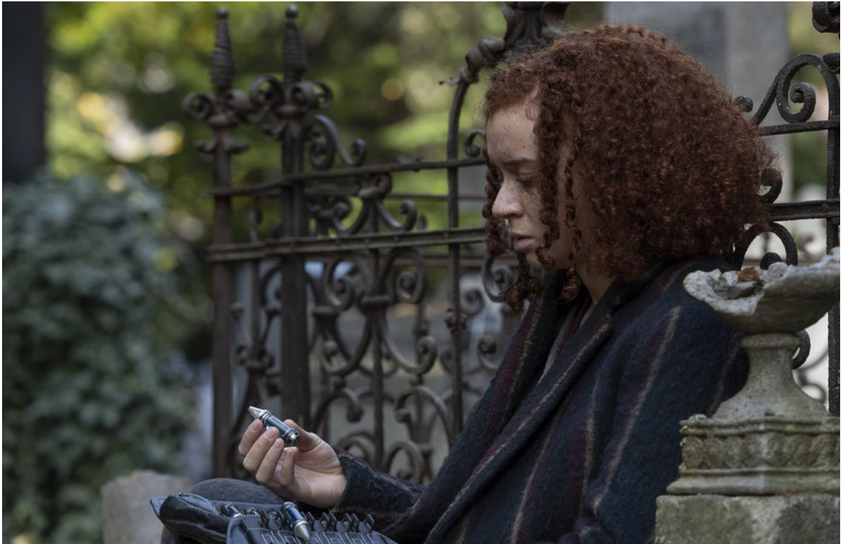
Erin Kellyman as Karli Morgenthau, a female version of Karl Morgenthau, in the limited series The Falcon and the Winter Soldier, 2021.