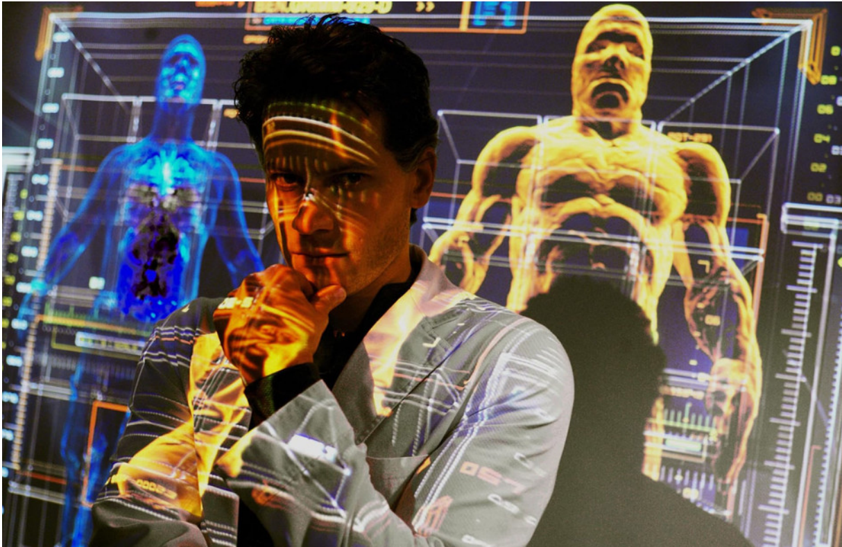
Ioan Gruffudd as Reed Richards in Fantastic Four, 2005.

Being blind didn't stop superhero Matt Murdock from getting an Ivy League education. According to the Daredevil series, the lawyer and vigilante majored in pre-law at Columbia , where he met love interest and fellow superhero Elektra Natchios , arch nemesis Lawrence Cranston (aka Mister Fear), and best friend and legal partner Foggy Nelson .