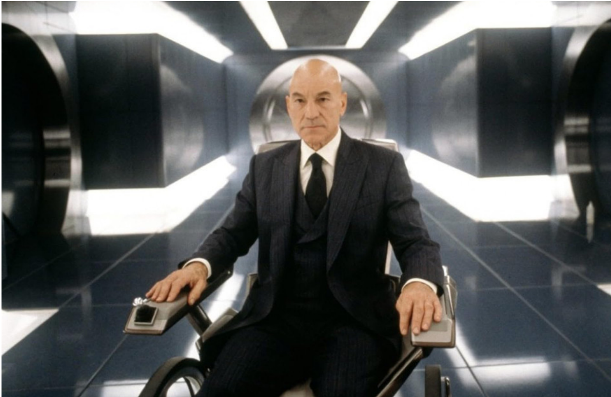
Patrick Stewart as Professor X in X-Men, 2000.