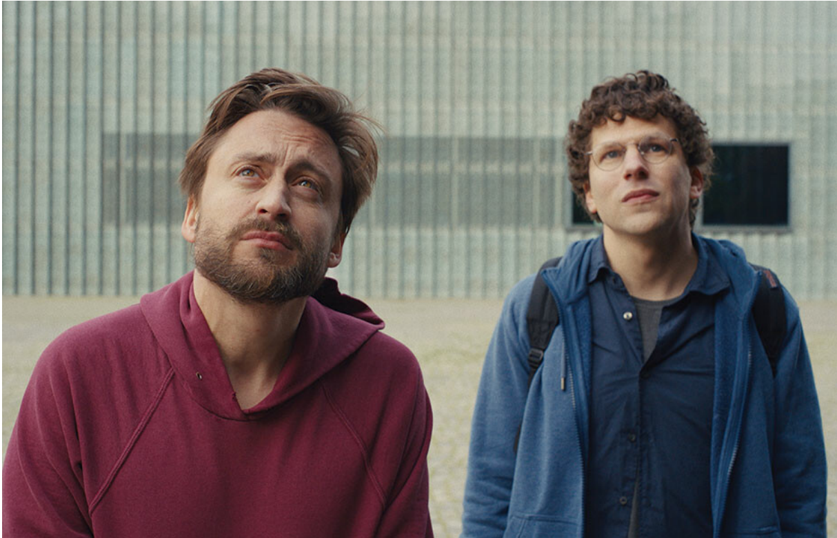
Kieran Culkin and Jesse Eisenberg in A Real Pain.

James Mangold '99SOA cowrote and directed this Bob Dylan biopic, which stars former Columbia student Timothée Chalamet. The film portrays the legendary singer-songwriter as he makes a controversial shift from acoustic to electric.