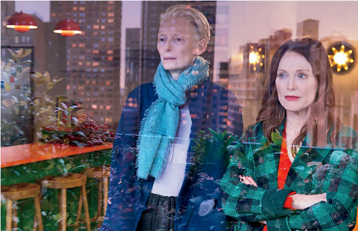
Tilda Swinton and Julianne Moore in The Room Next Door.