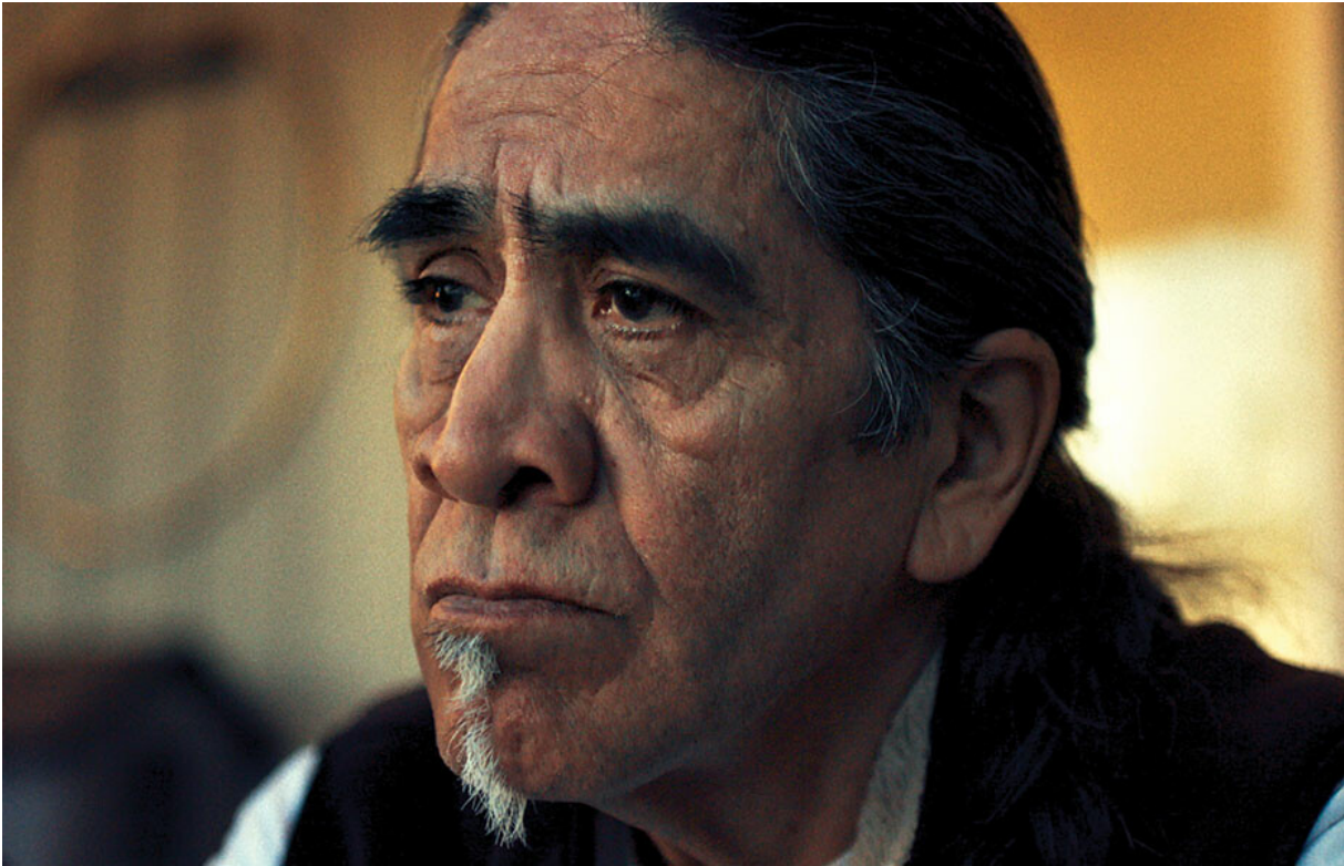
Emily Kassie / Sugarcane Film LLC