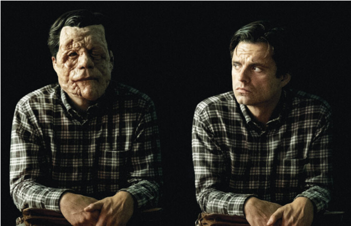
Adam Pearson and Sebastian Stan in A Different Man.