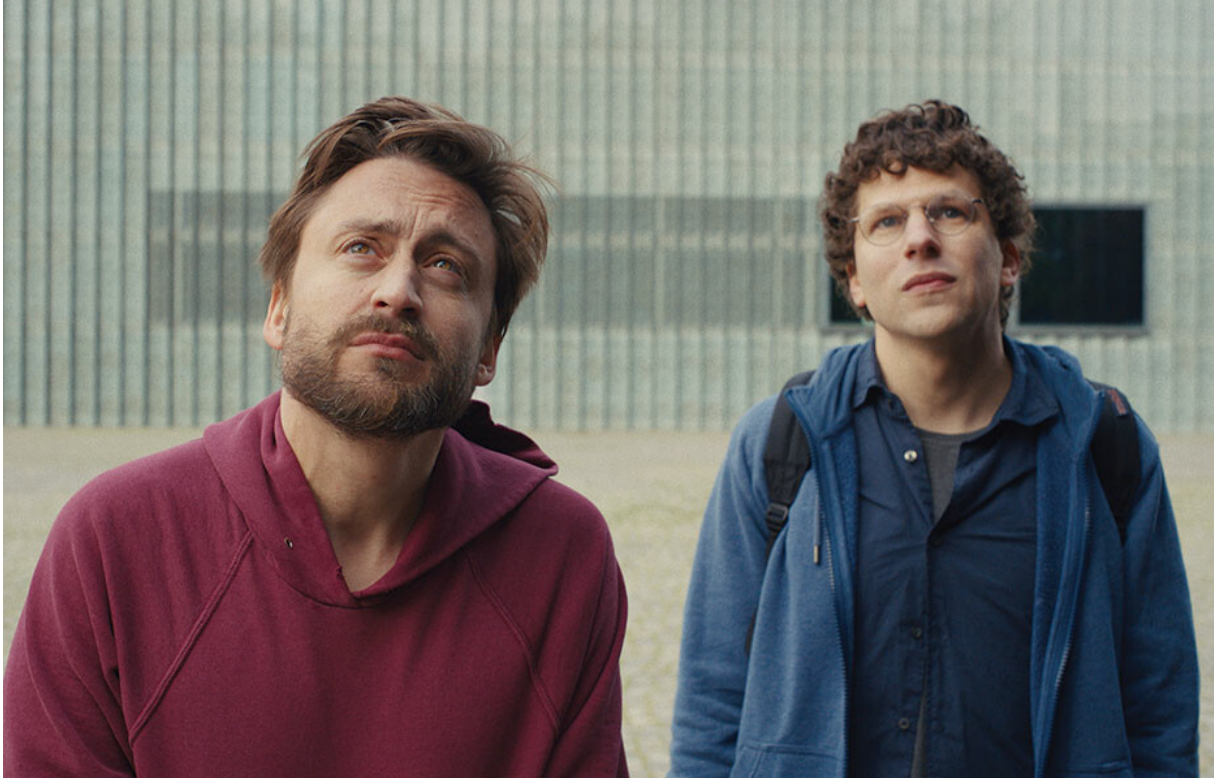
Kieran Culkin and Jesse Eisenberg in A Real Pain.

James Mangold '99SOA directed this Bob Dylan biopic, which stars former Columbia student Timothée Chalamet. The film portrays the legendary singer-songwriter as he makes a controversial shift from acoustic to electric.