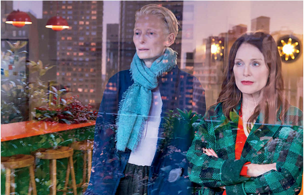
Tilda Swinton and Julianne Moore in The Room Next Door.