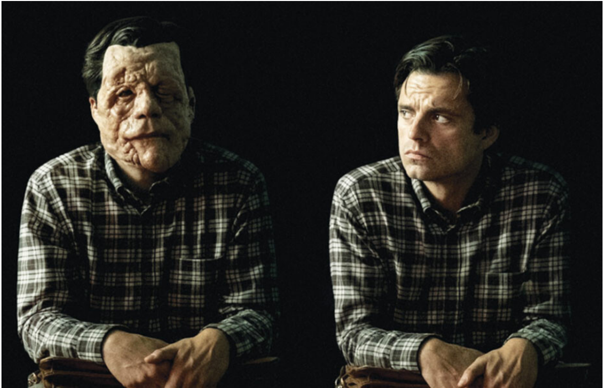
Adam Pearson and Sebastian Stan in A Different Man.