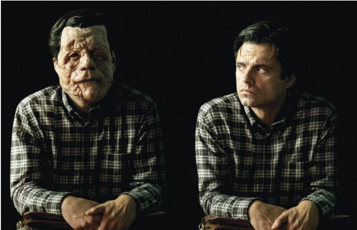
Adam Pearson and Sebastian Stan in A Different Man.