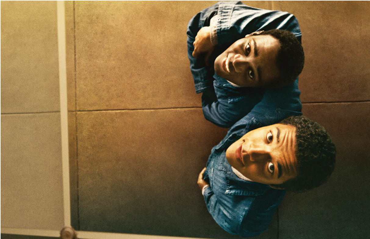
Amazon MGM Studios