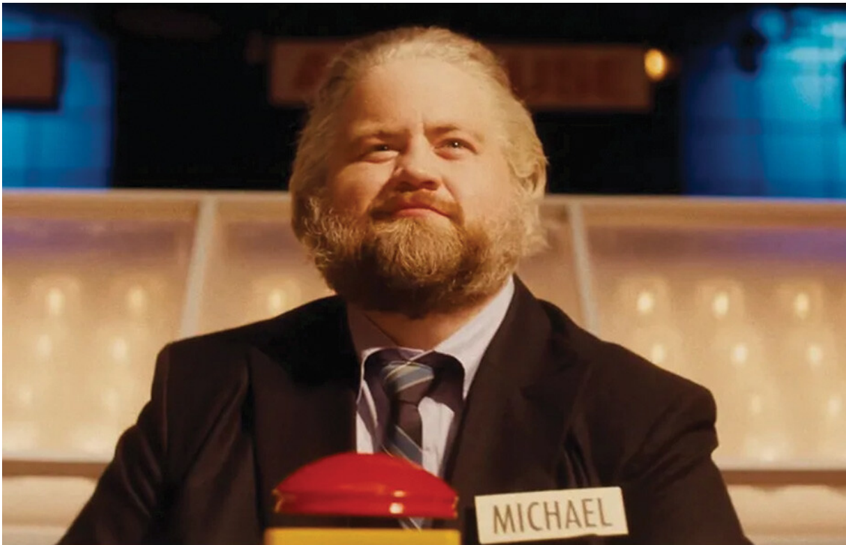
Paul Walter Hauser in The Luckiest Man in America.