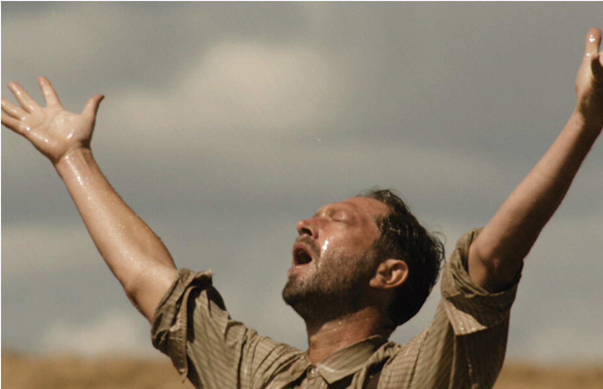
Ebon Moss-Bachrach in Hold Your Breath .