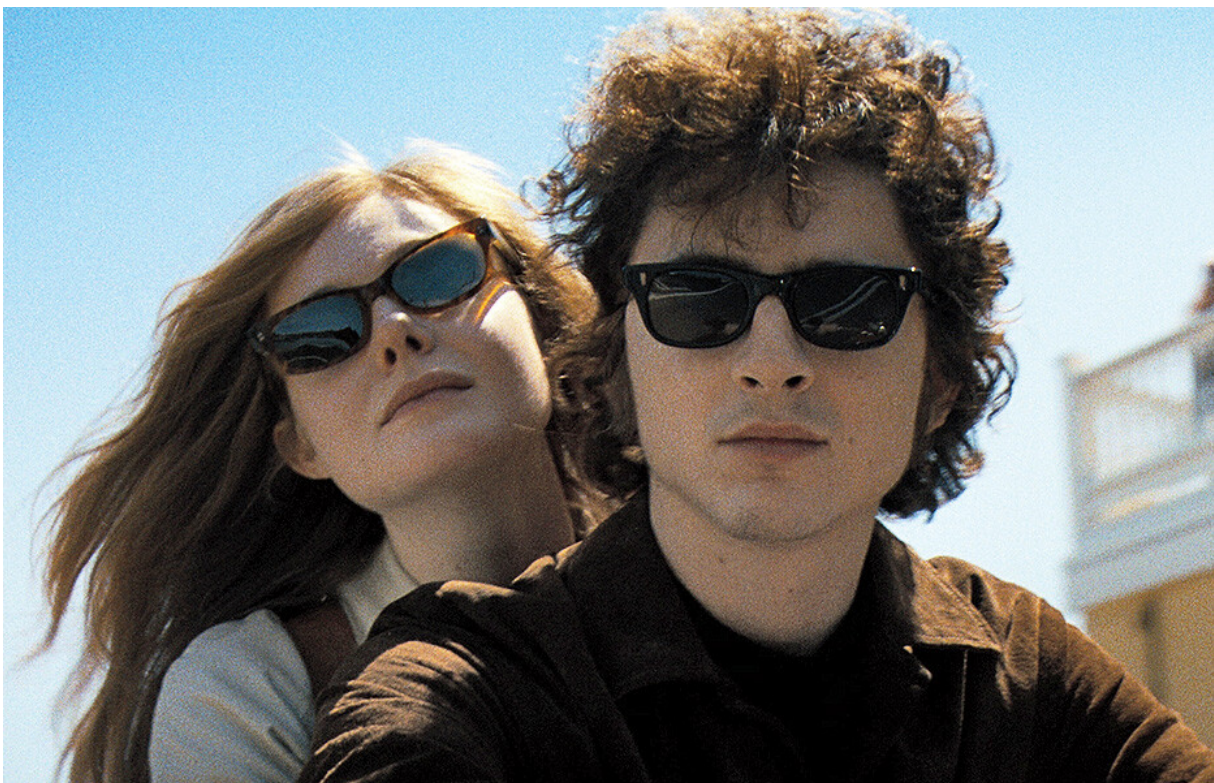
Elle Fanning and Timothée Chalamet in A Complete Unknown .