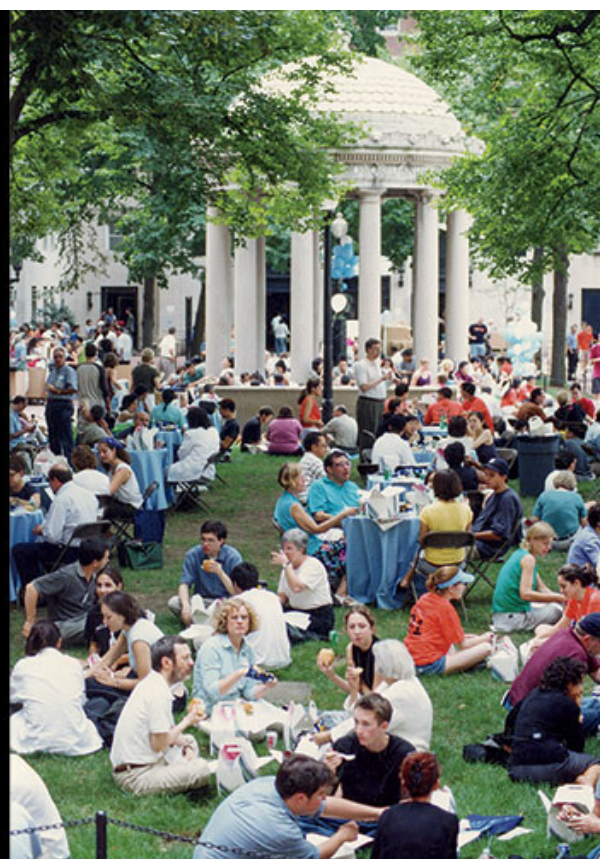
Left: graduating seniors of the College's first coed class in 1987. Right: a student-orientation picnic in 2001.

This article appears in the Winter 2024-25 print edition of Columbia Magazine with the title Pillars of Strength."