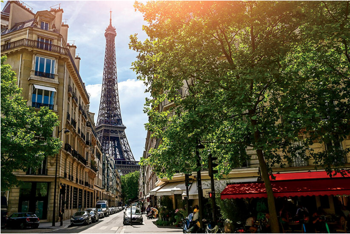
Best Paris Strolls