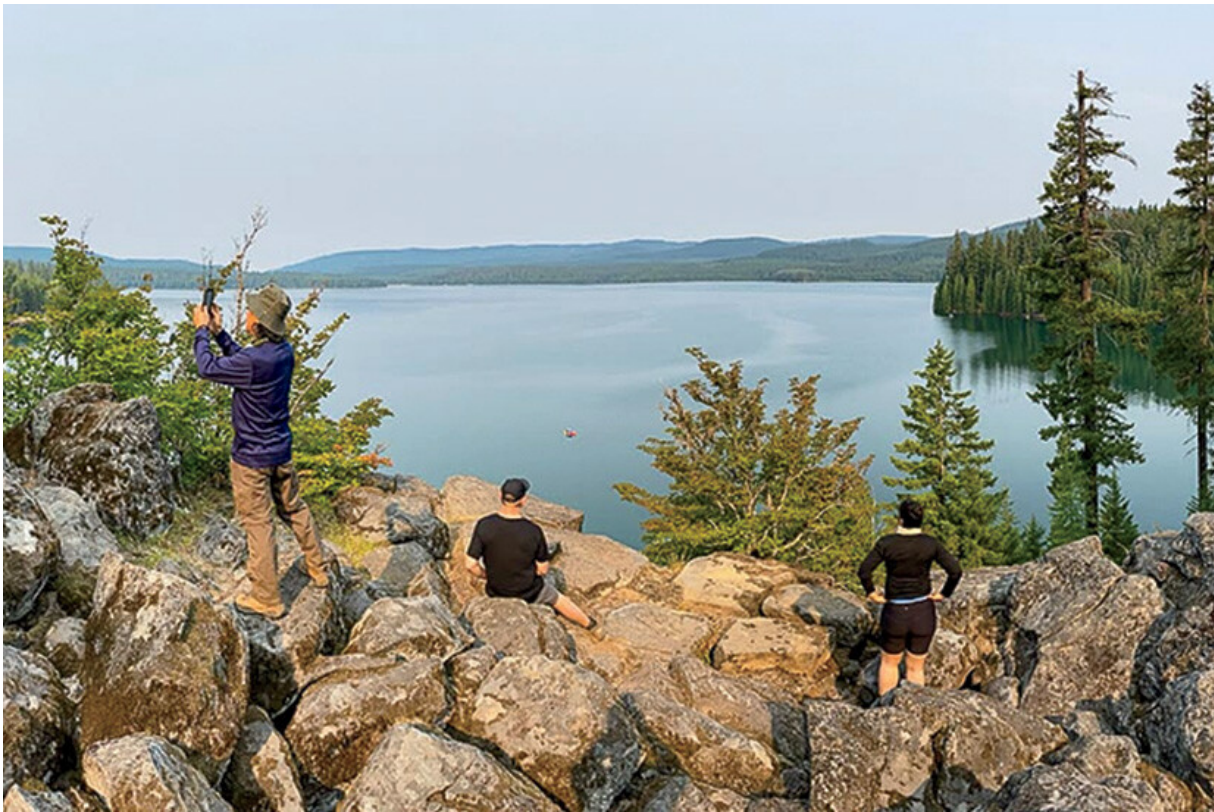
Rare Earth Adventures