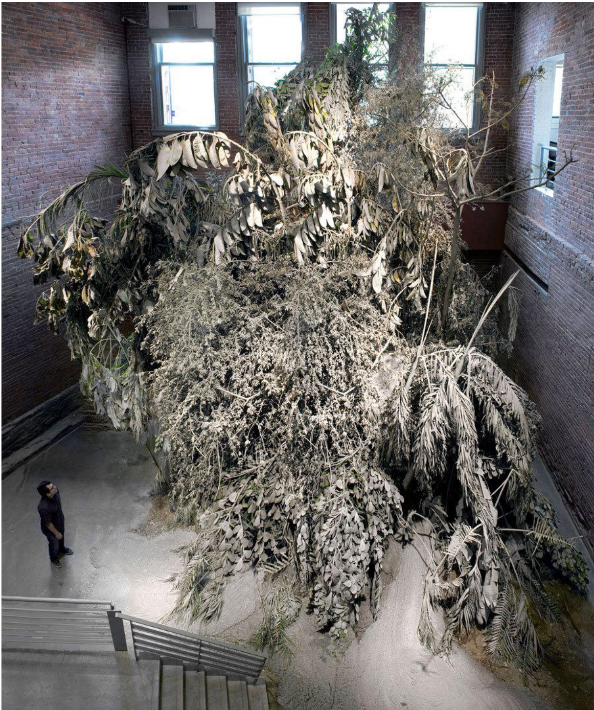
David Brooks. "Preserved Forest" (2010) Nursery-grown trees, earth, and concrete. (Dimensions variable)

Visiting David Brooks's live-work loft studio in the Dumbo neighborhood of Brooklyn is like taking a trip to a natural-history museum. Mantels are lined with skulls, teeth, petrified wood, and taxidermied creatures: a bobcat, a fish, a flock of migratory birds. It's a fitting environment for Brooks '09SOA, who creates sculptures — often monumental in scale — that investigate the natural world and its relation to an