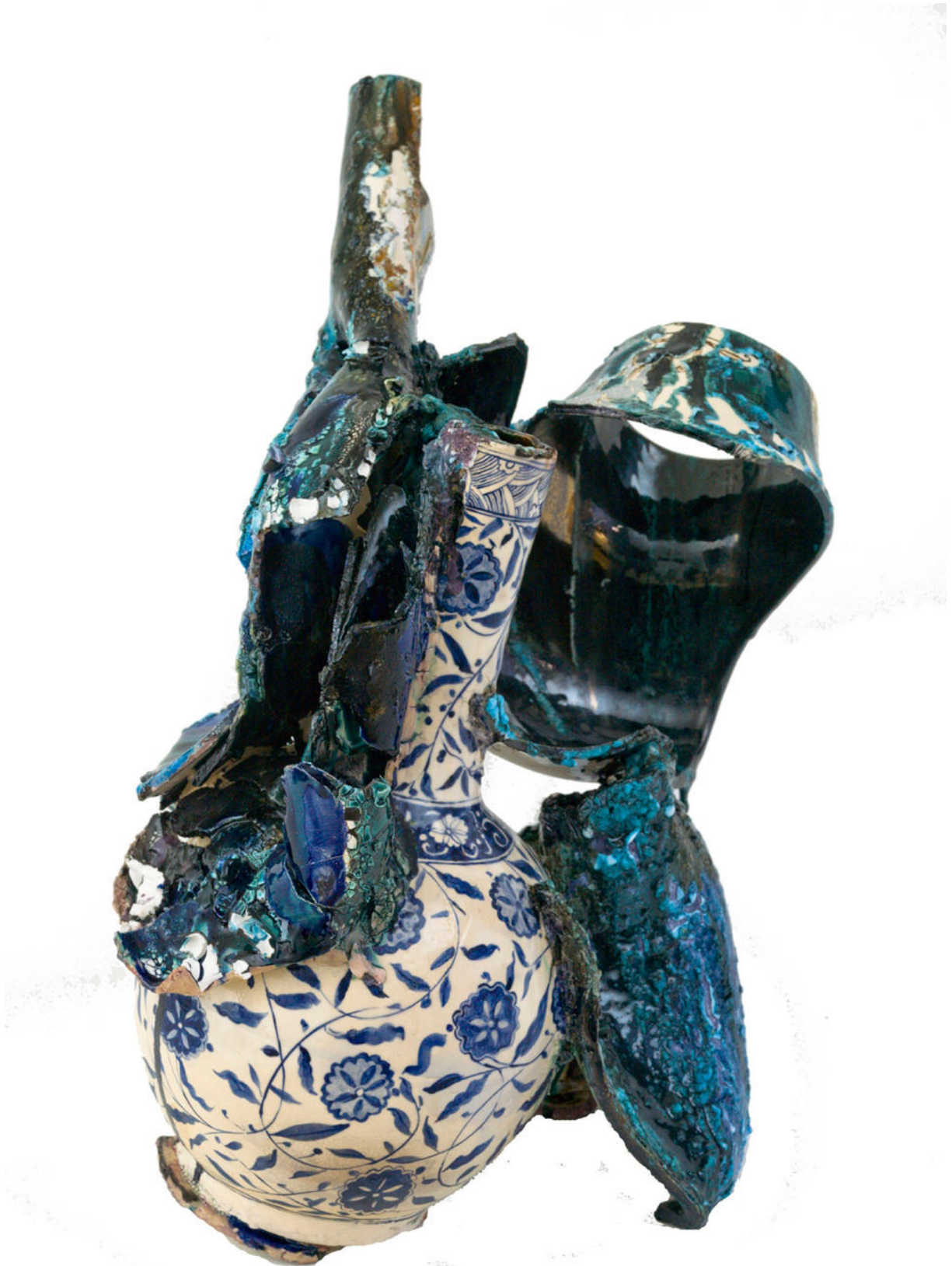
Francesca DiMattio. "Jingdezhen" (2012) China paint and underglaze on Porcelain ceramic 12.5 x 16 x 12 in.