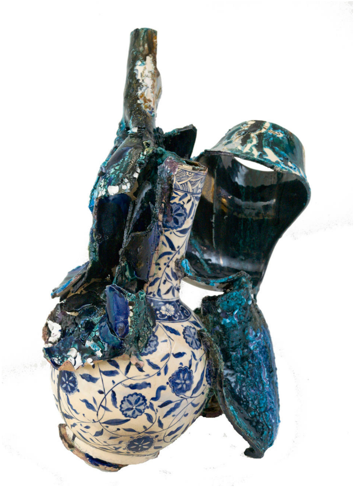
Francesca DiMattio. "Jingdezhen" (2012) China paint and underglaze on Porcelain ceramic 12.5 x 16 x 12 in.