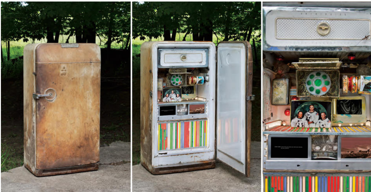
Laleh Khorramian. "Communication Shrine" (2013) Refrigerator, glass, neon, tin boxes, LED, and three DVD minidisk players 65 × 34 × 27 in.