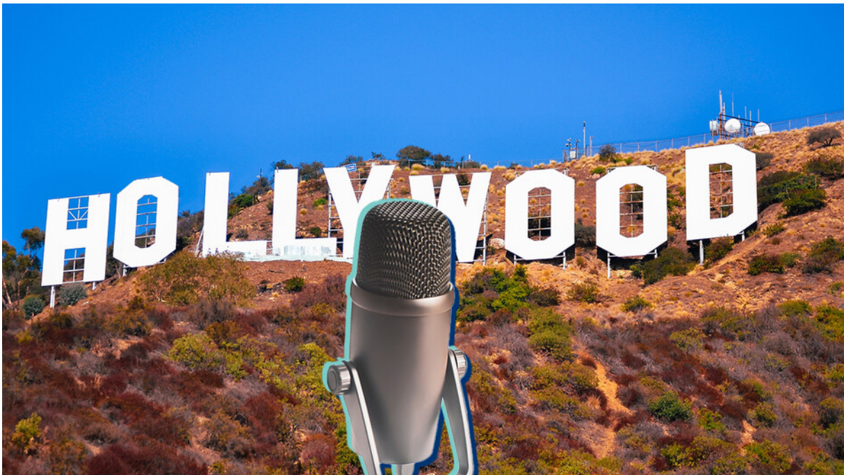
Photo-illustration by Columbia Magazine (Andrei_Diachenko / bettorodrigues / Shutterstock)