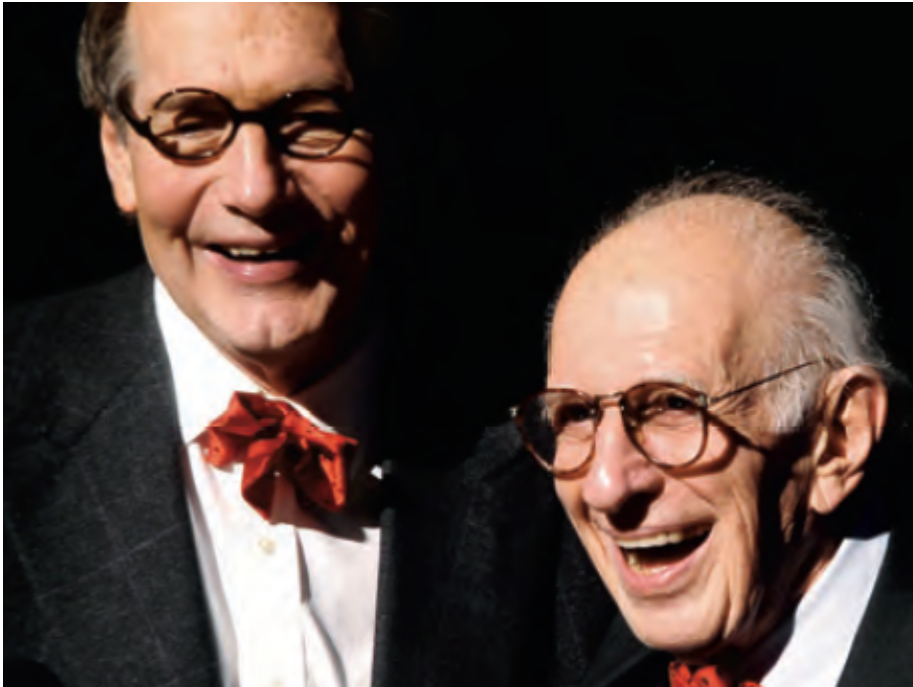
Charlie Rose and Eric Kandel

Columbia celebrated the 80th birthday of Nobel laureate neuroscientist and University Professor Eric Kandel with a daylong symposium on November 20. Seventeen colleagues and former students gave addresses describing how Kandel's work on brain function inspired their own research on topics ranging from the emotions of mice to the neuronal underpinning of moral thought. PBS talk-show host Charlie Rose, with whom Kandel is currently cohosting a yearlong series of special episodes on the brain, emceed a dinner. "One of the things that amazes me about being 80 years old is that I get as much joy out of science today as I did when I began," says Kandel. "That's because exciting things keep on popping up."