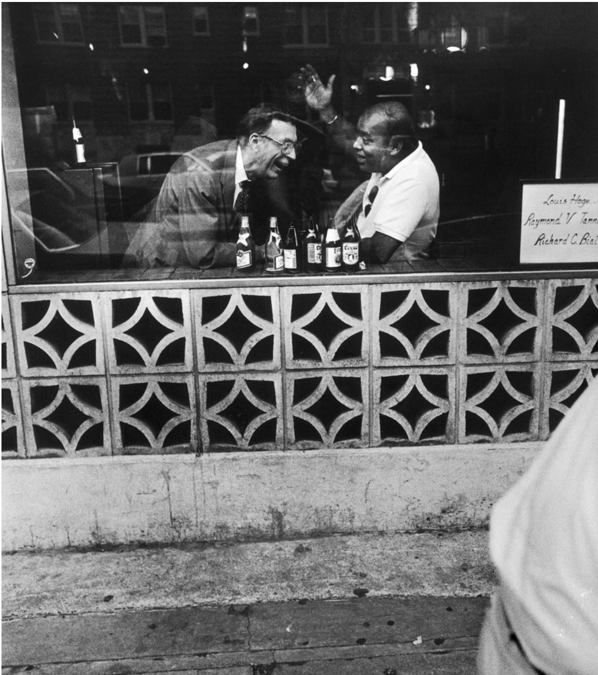
Two Friends at the Charles Village Pub, Baltimore, 1985

Look at this photograph of two friends in the window of a Baltimore bar. Eisenberg released the shutter at the peak of one man's laughter and when the other's gesture is at its most expressive. The composition — "the organization of forms" — is typical of Eisenberg: Our eye goes first to the strong, primary subject, and only on second glance notices the supporting players, those little extras that comment on the scene. In this case, the blurry figure to the right and the reflections in the glass tell us that this is a busy street — and that our two friends are oblivious to it. Capturing this is