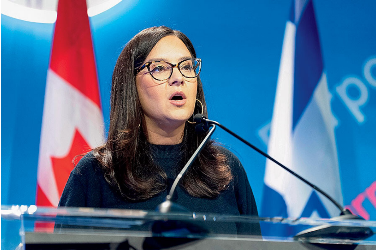
Bari Weiss

Bari Weiss '07CC, cofounder and CEO of the digital-media outlet The Free Press , was named editor in chief of CBS News. Tony Dokoupil '06GSAS was promoted to anchor of the network's evening-news program.