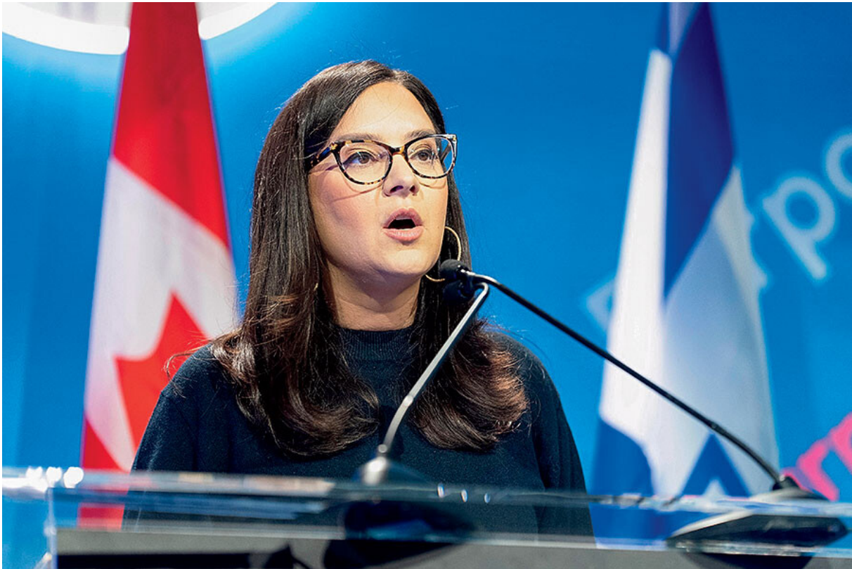
Bari Weiss