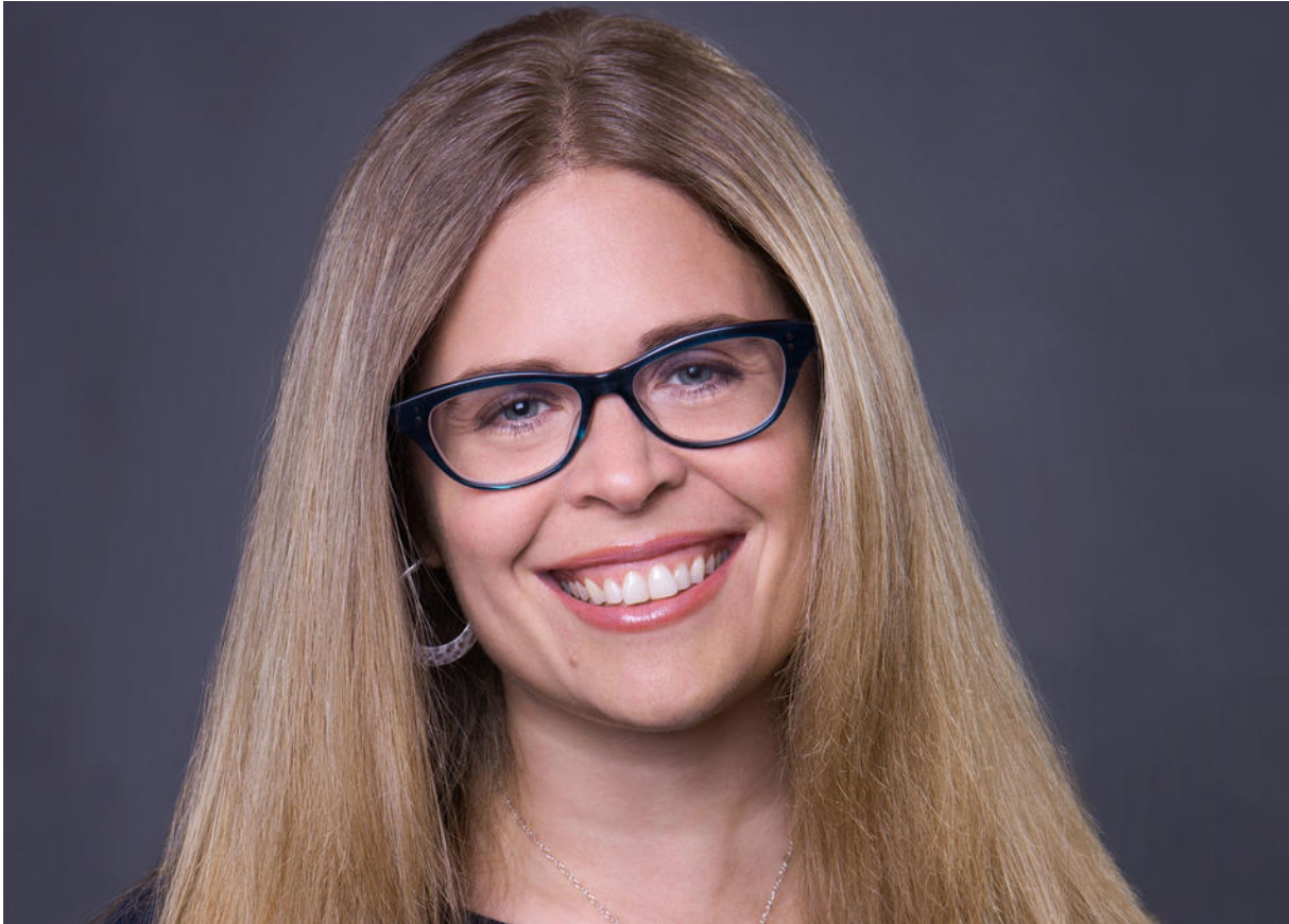
Jennifer Lee (Disney)