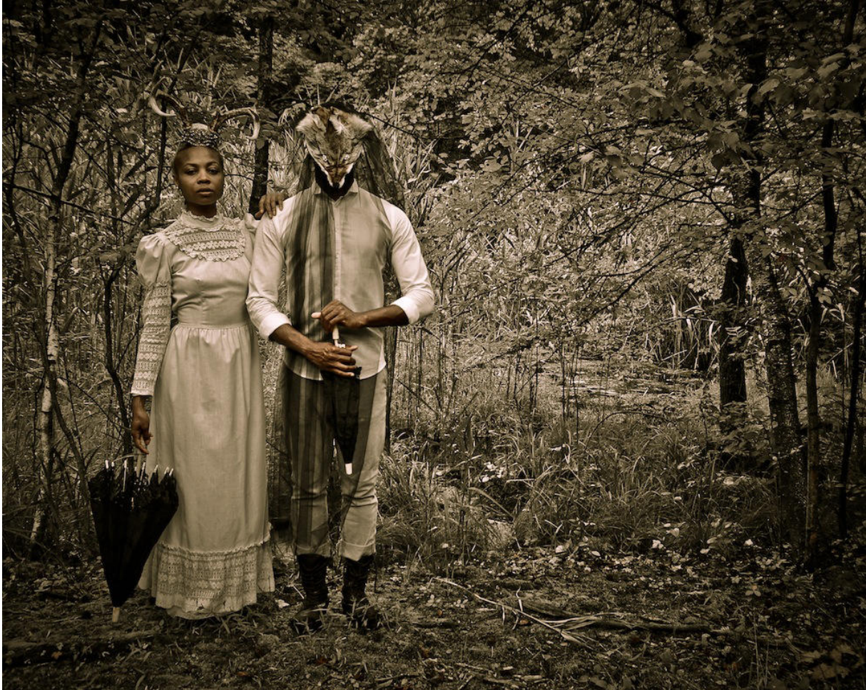
"Haints at Swamp II"