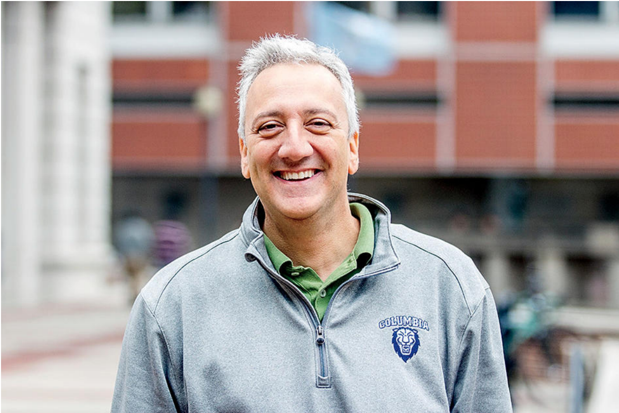
Mike Massimino