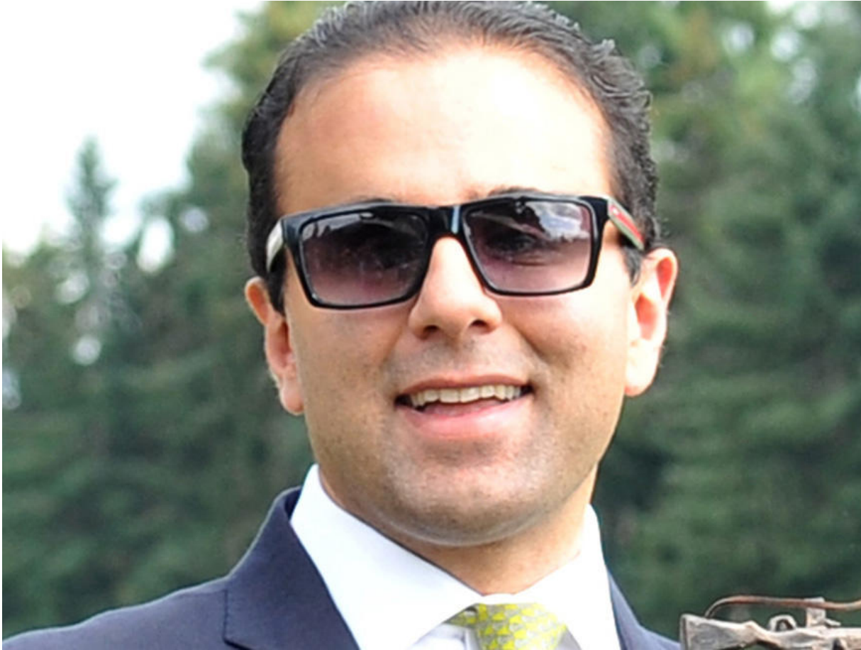
Cyrus Habib

Cyrus Habib '03CC was inaugurated as lieutenant governor of Washington State, becoming the highest-ranking Iranian-American elected official. Habib, who has been blind since age eight, was a Rhodes Scholar in English literature and also received a law degree from Yale. He has served in the Washington State House of Representatives and the Washington State Senate.