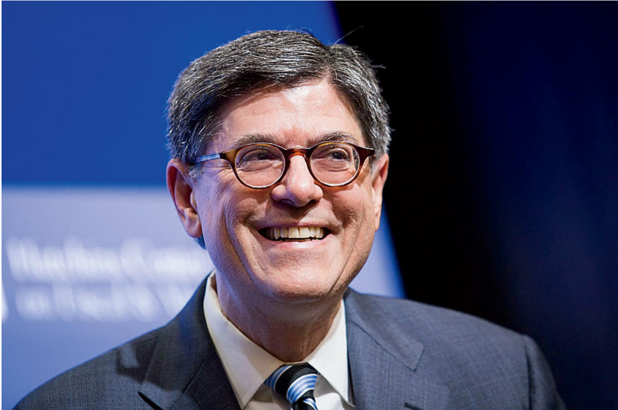
Jacob Lew

Jacob Lew, the outgoing US treasury secretary, has joined Columbia's School of International and Public Affairs as a visiting professor. An expert on international economics and fiscal and trade policy, Lew will teach graduate students and work with faculty members from across the University on a range of public-policy issues.