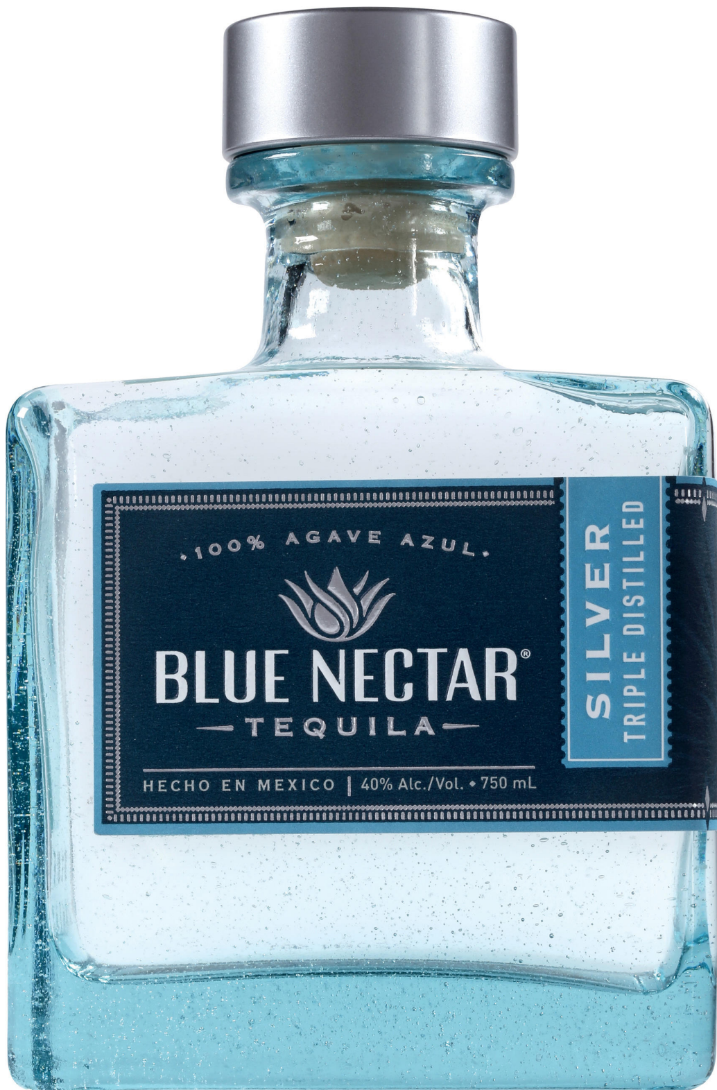
Blue Nectar Tequila