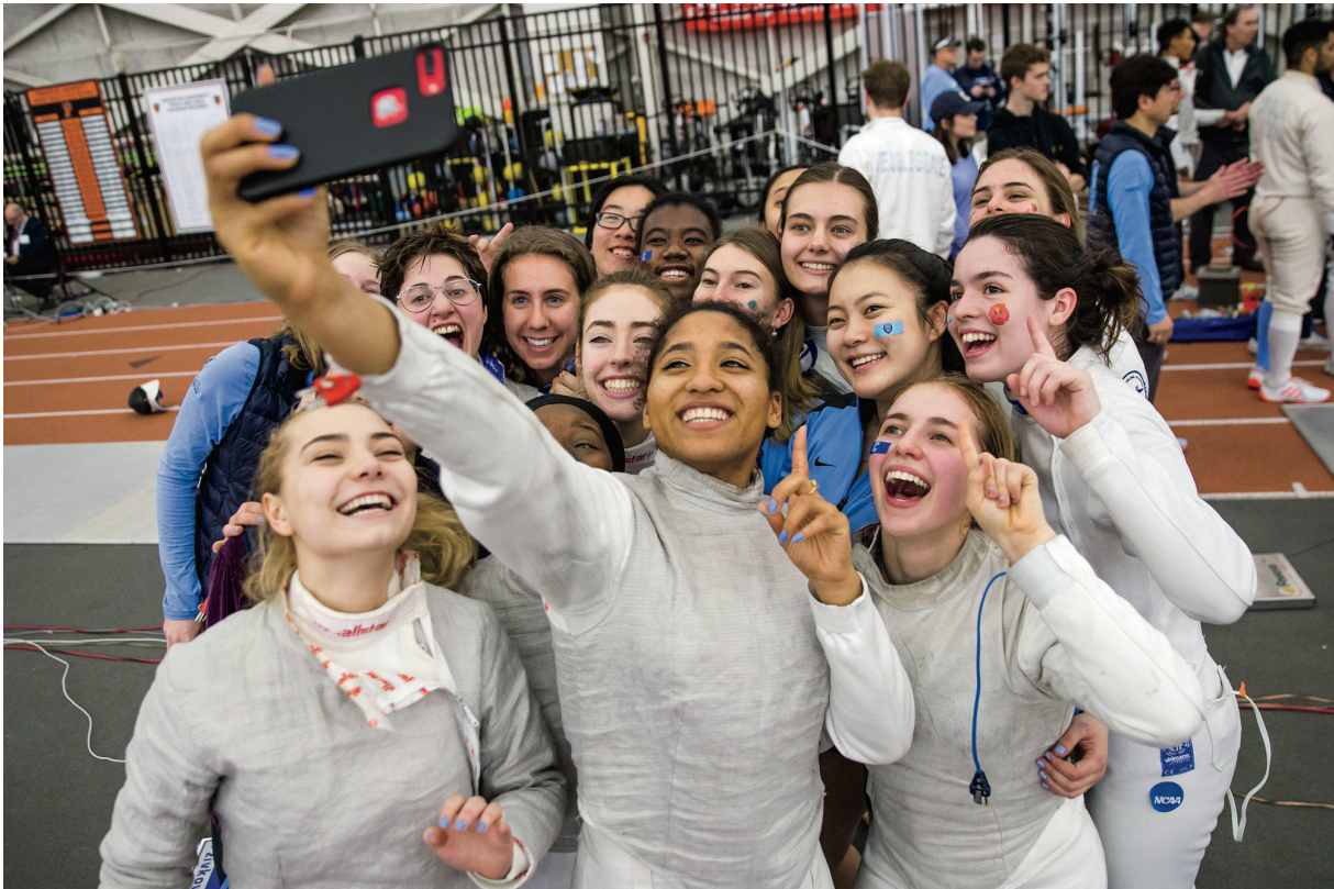
Members of the women's fencing team celebrate their Ivy title.