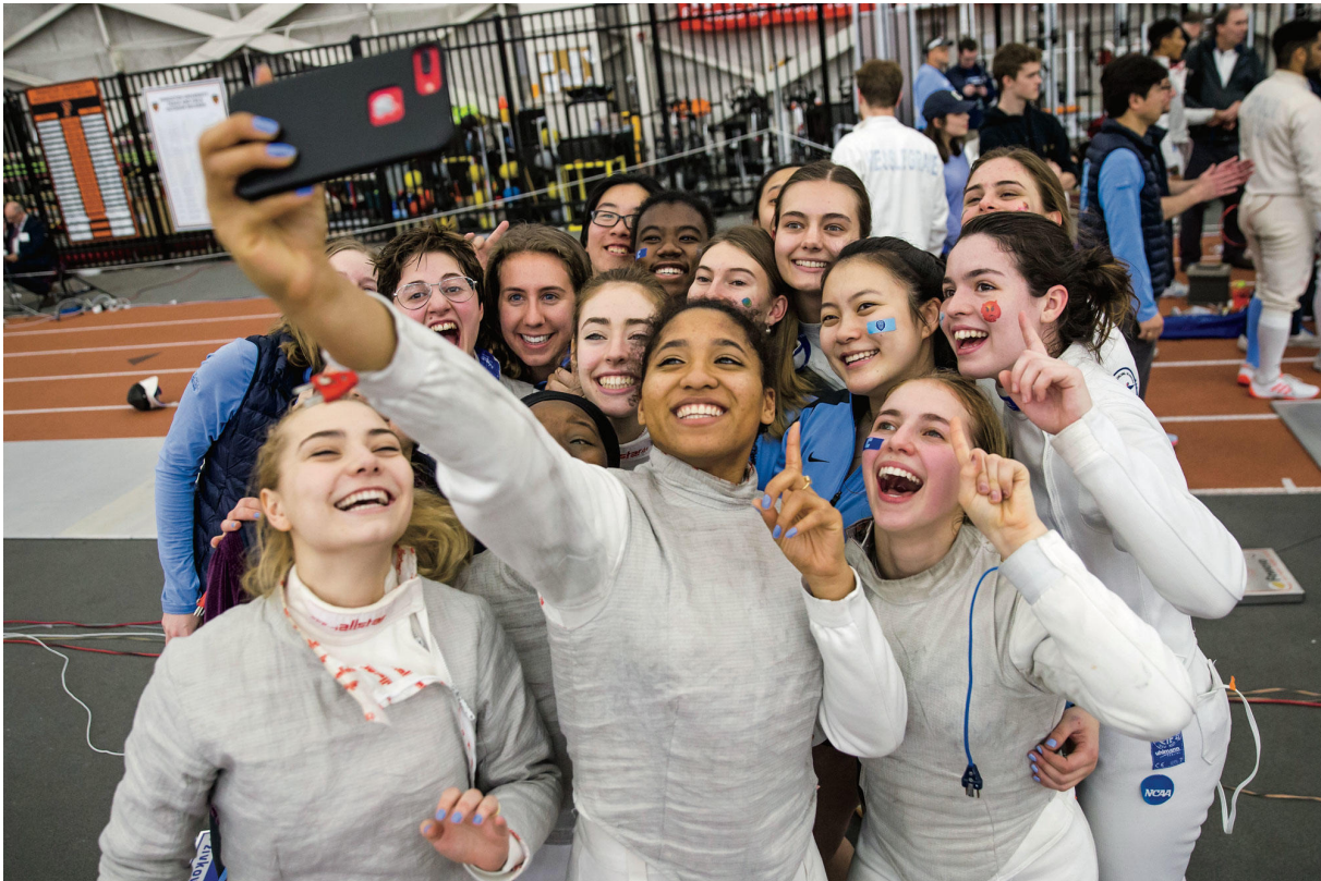
Members of the women's fencing team celebrate their Ivy title.