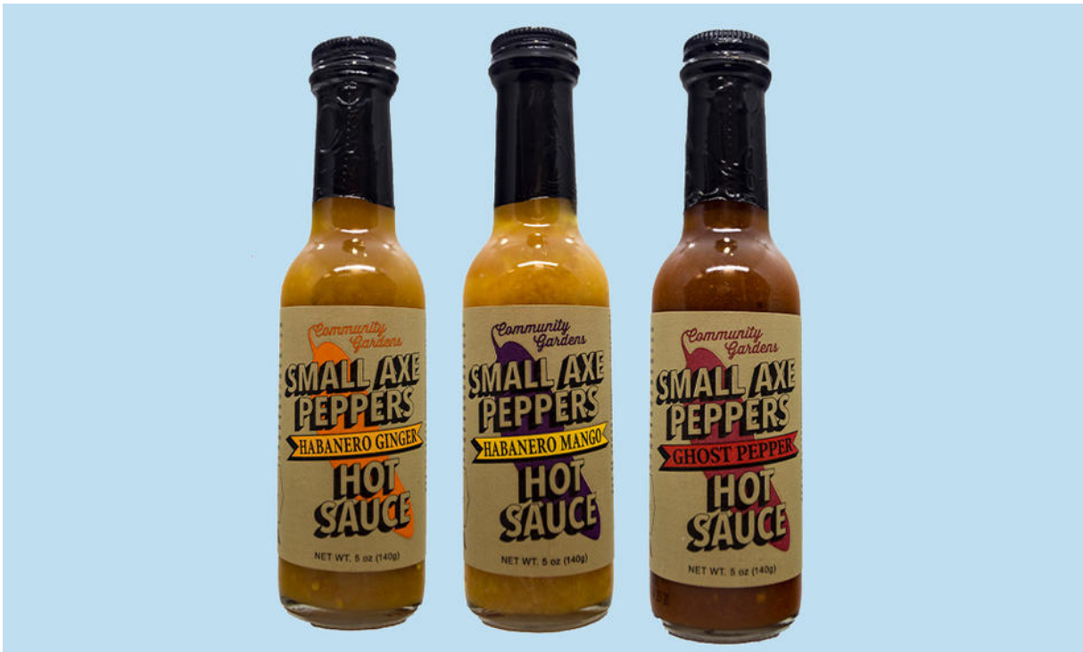
Small Axe Peppers

Community-garden hot sauce from Small Axe Peppers , cofounded by John Crotty '96BUS. Three-pack, $29.99.