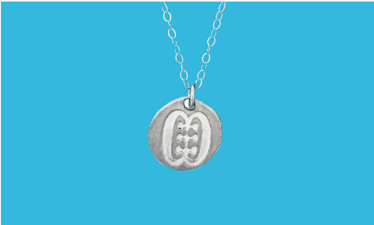
A Little Peace

Community-garden hot sauce from Small Axe Peppers , cofounded by John Crotty '96BUS. Three-pack, $29.99.