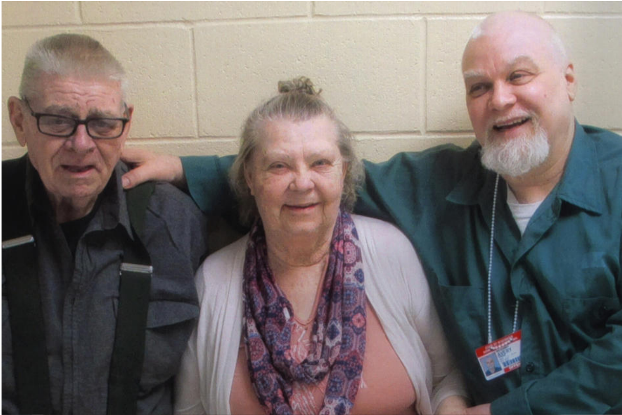
From left: Allan Avery, Dolores Avery, and Steven Avery. Making a Murderer, part 2 (Netflix)