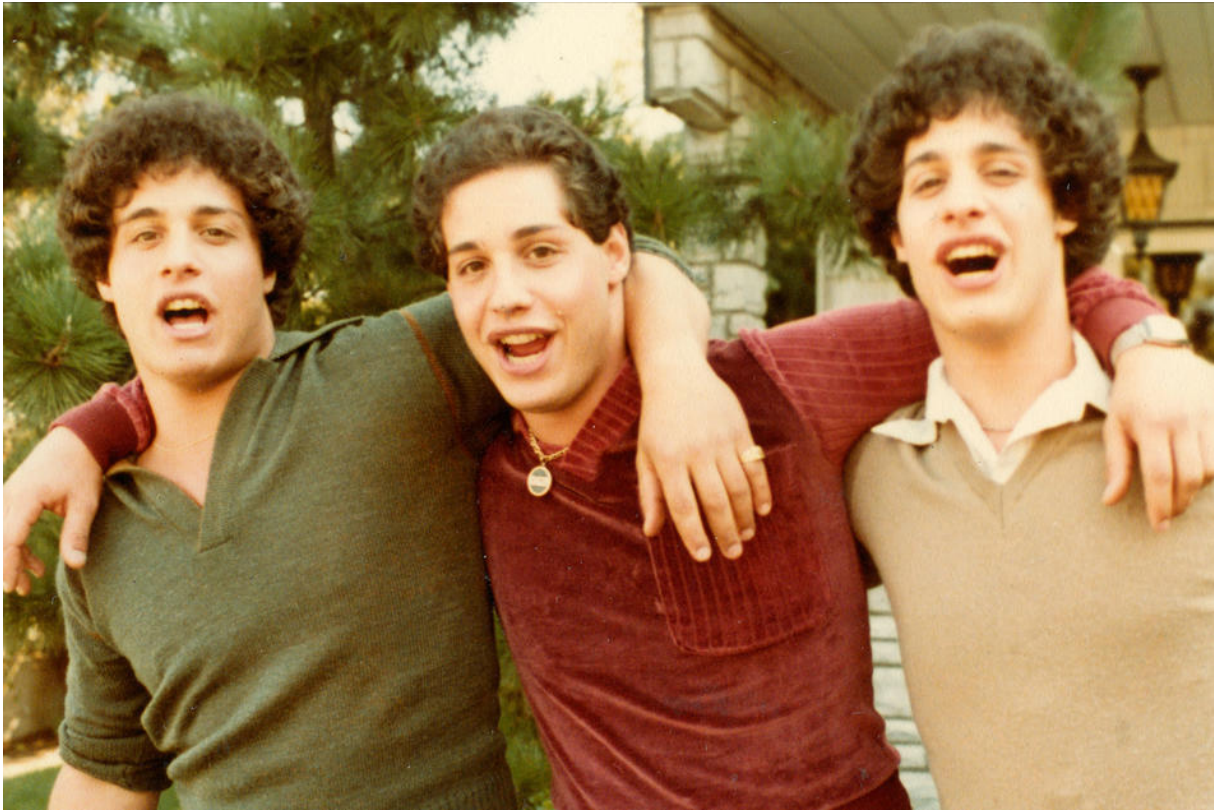
Three Identical Strangers (CNN Films)