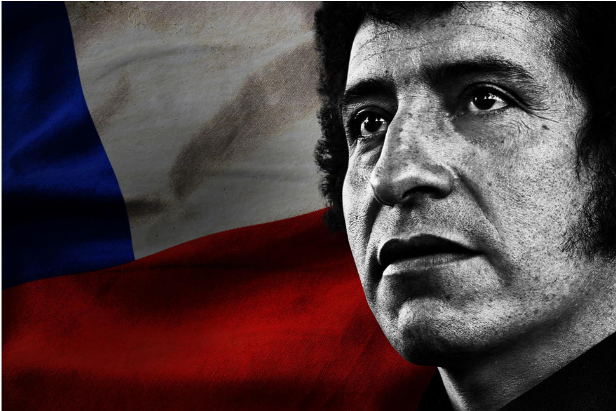
Víctor Jara. ReMastered: Massacre at the Stadium (Netflix)