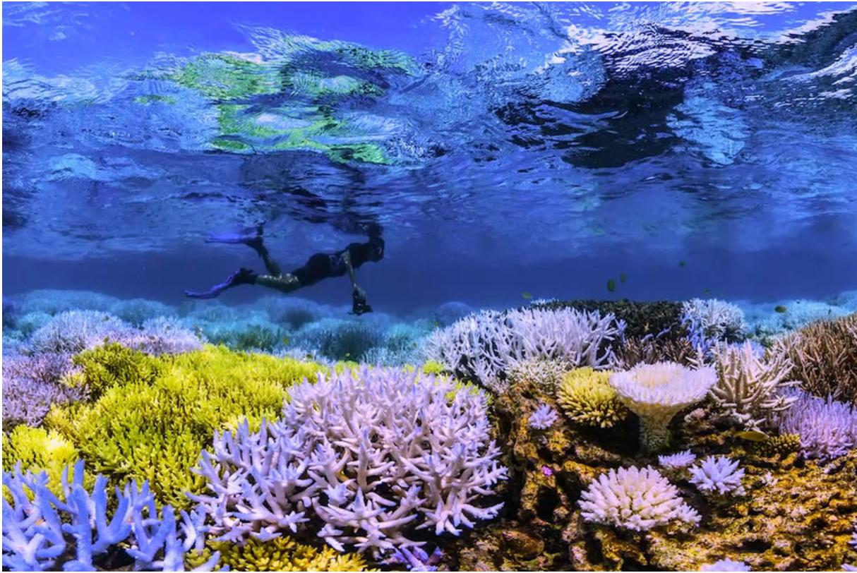
Chasing Coral (Netflix).