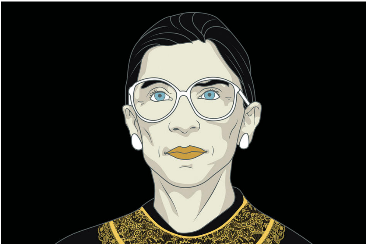
RBG (Magnolia Pictures / CNN Films)