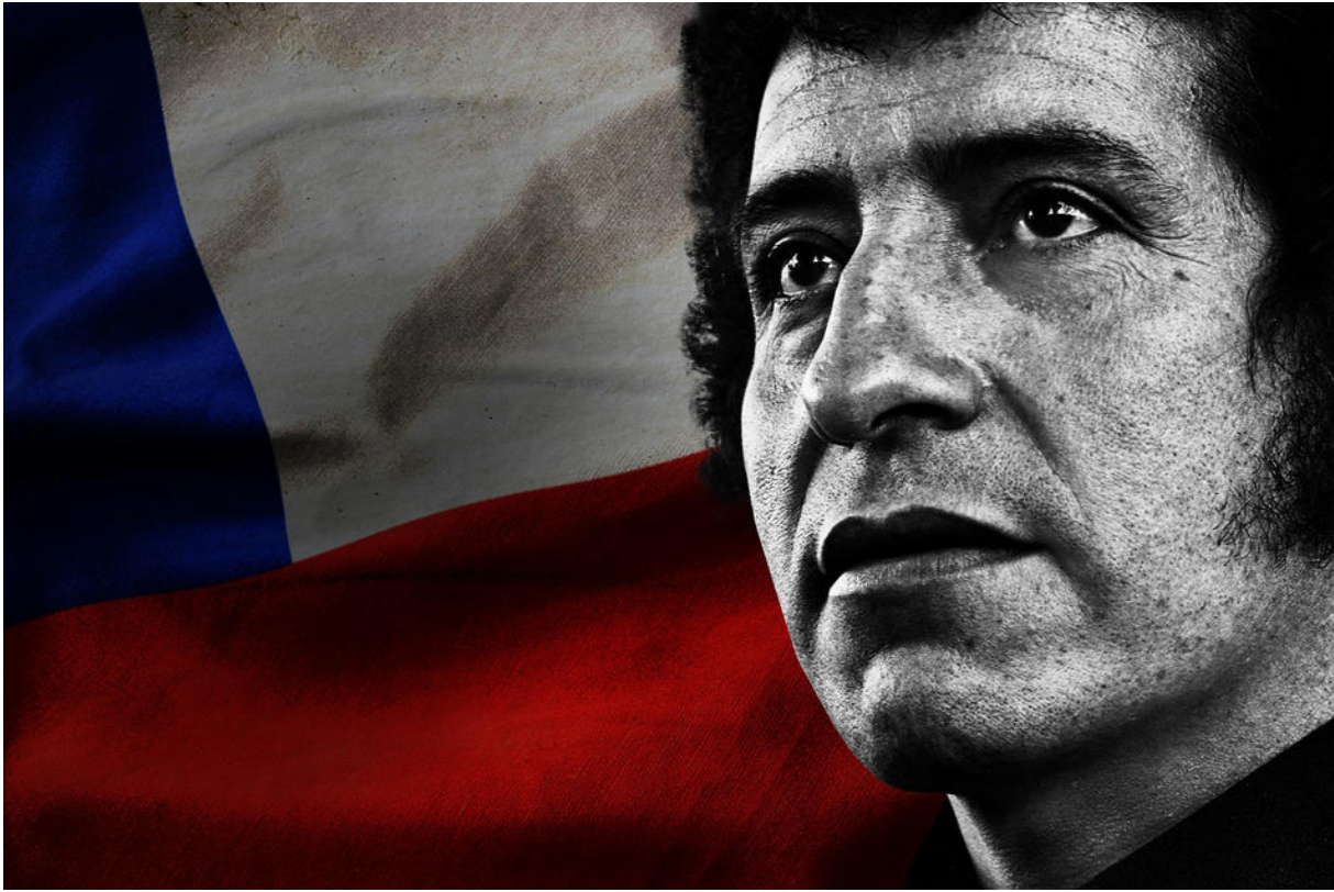
Víctor Jara. ReMastered: Massacre at the Stadium (Netflix)