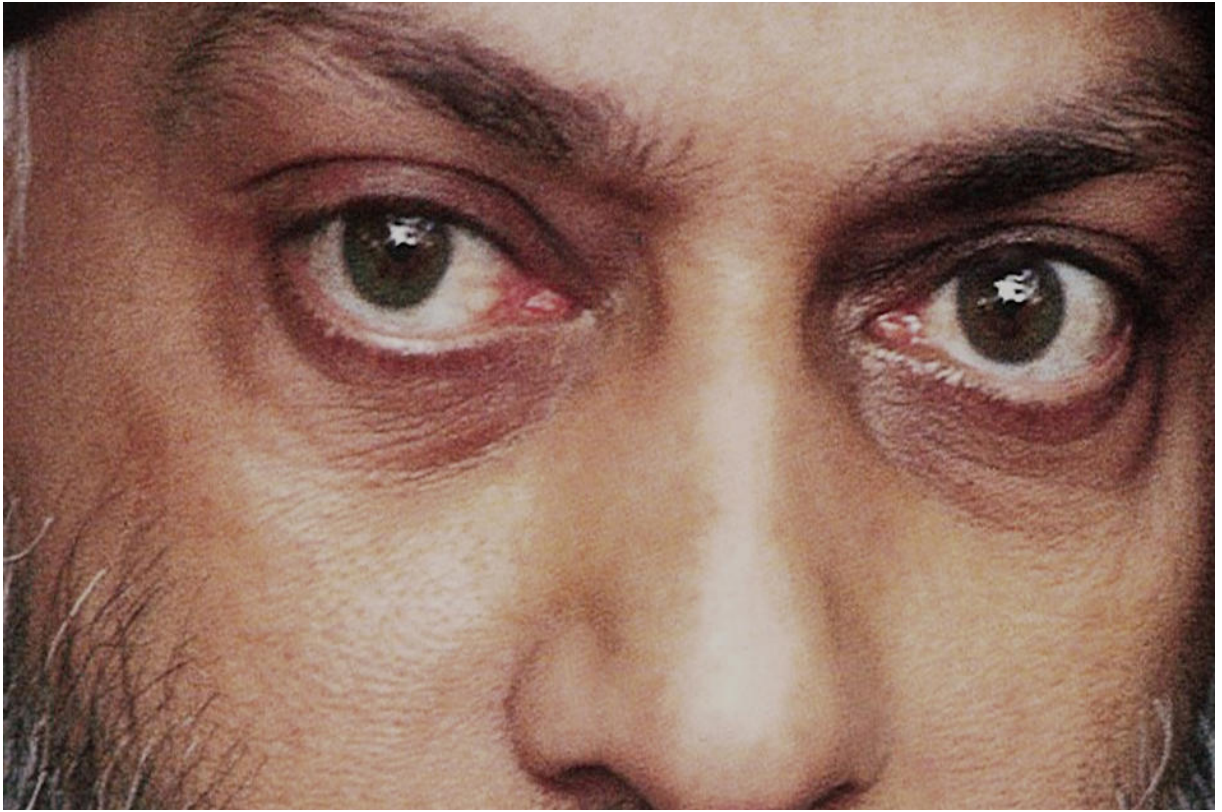
Bhagwan Rajneesh. Wild Wild Country (Netflix)