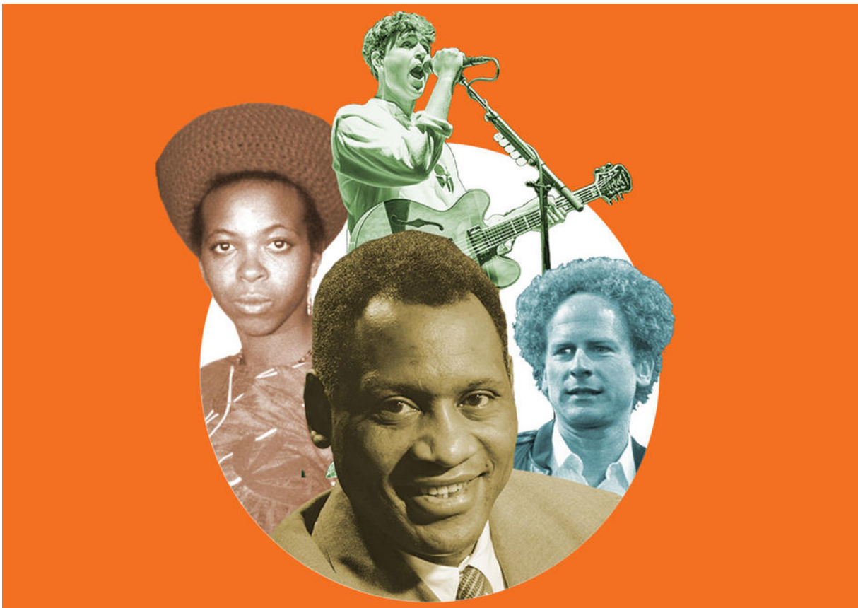
Clockwise from top: Roger Garfield / Alamy; Anefo Collection / Nationaal Archief, The Netherlands; Gordon Parks / Library of Congress; Pictorial Press Ltd / Alamy