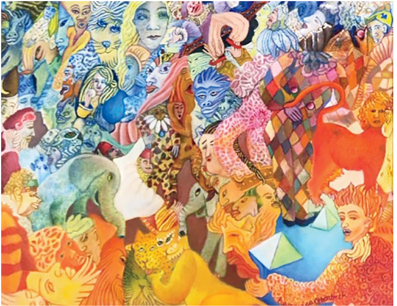
Distance , by Carmen Neal