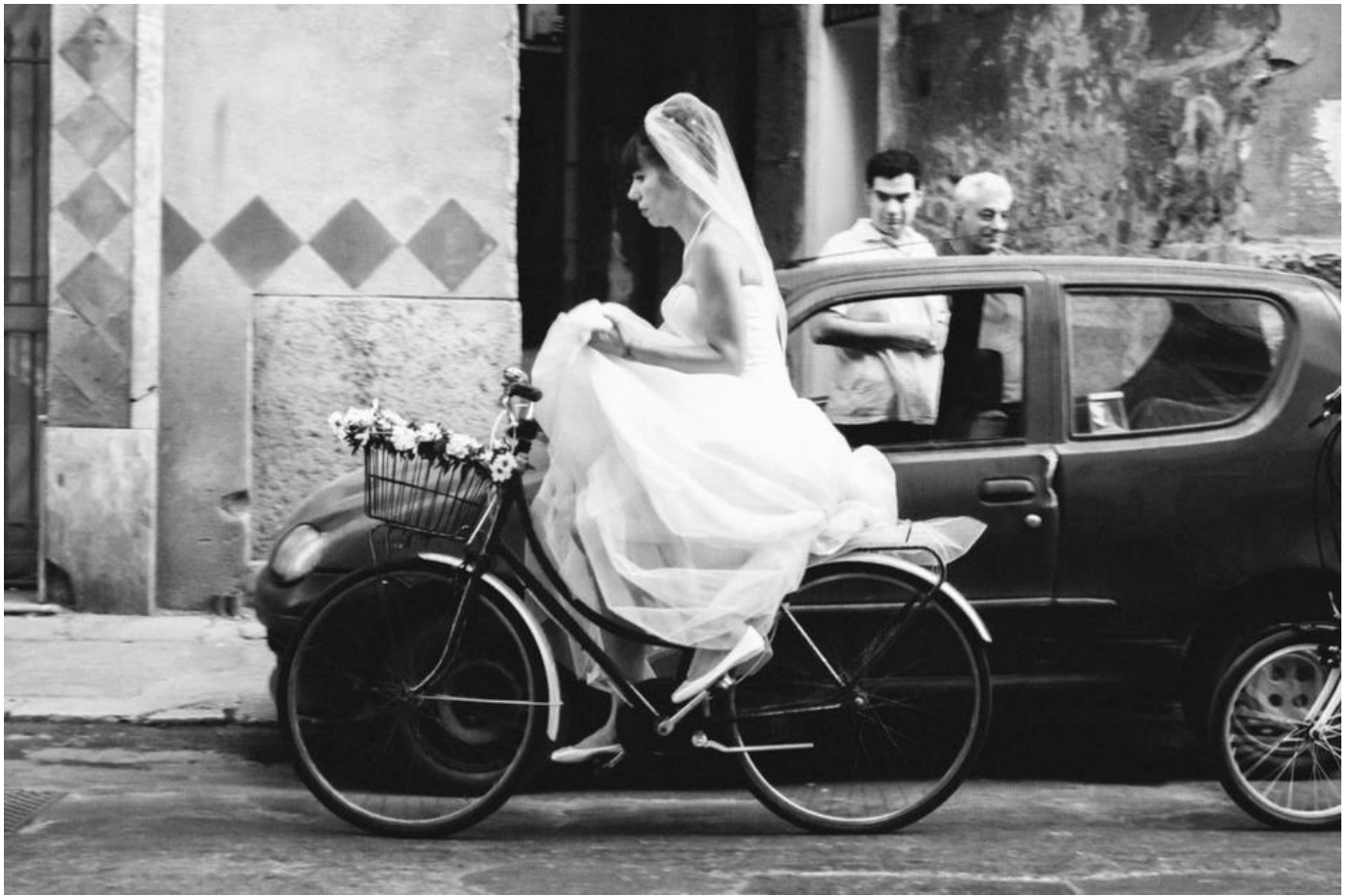
The Mystery of the Shirley Temple Sphinx , by Francesca Oberbeck