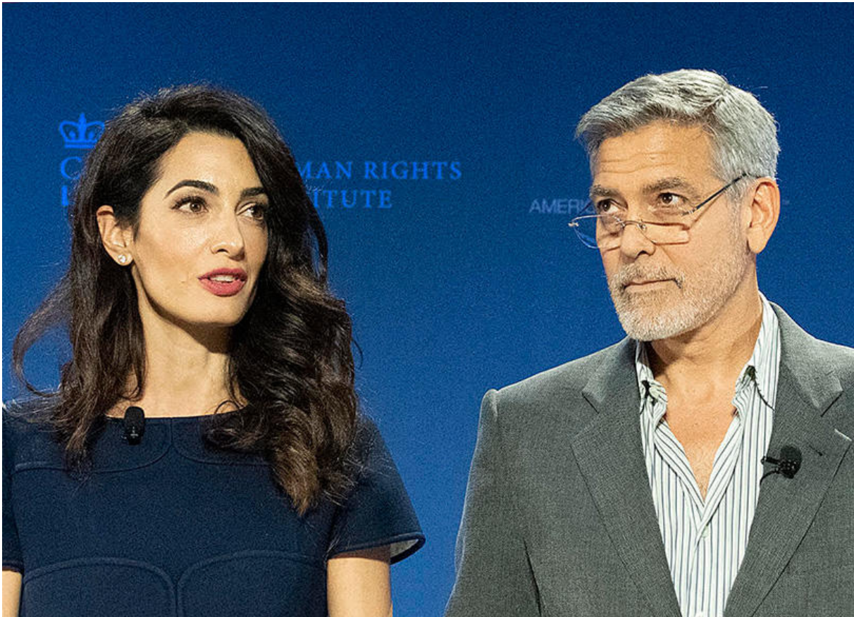
Amal and George Clooney at Columbia Law School.

The law school's Human Rights Institute and the Clooney Foundation for Justice have joined forces to train Columbia law students to monitor legal proceedings against journalists, dissidents, LGBTQ people, women and girls, members of religious minorities, and other vulnerable groups in countries where human rights are at risk.