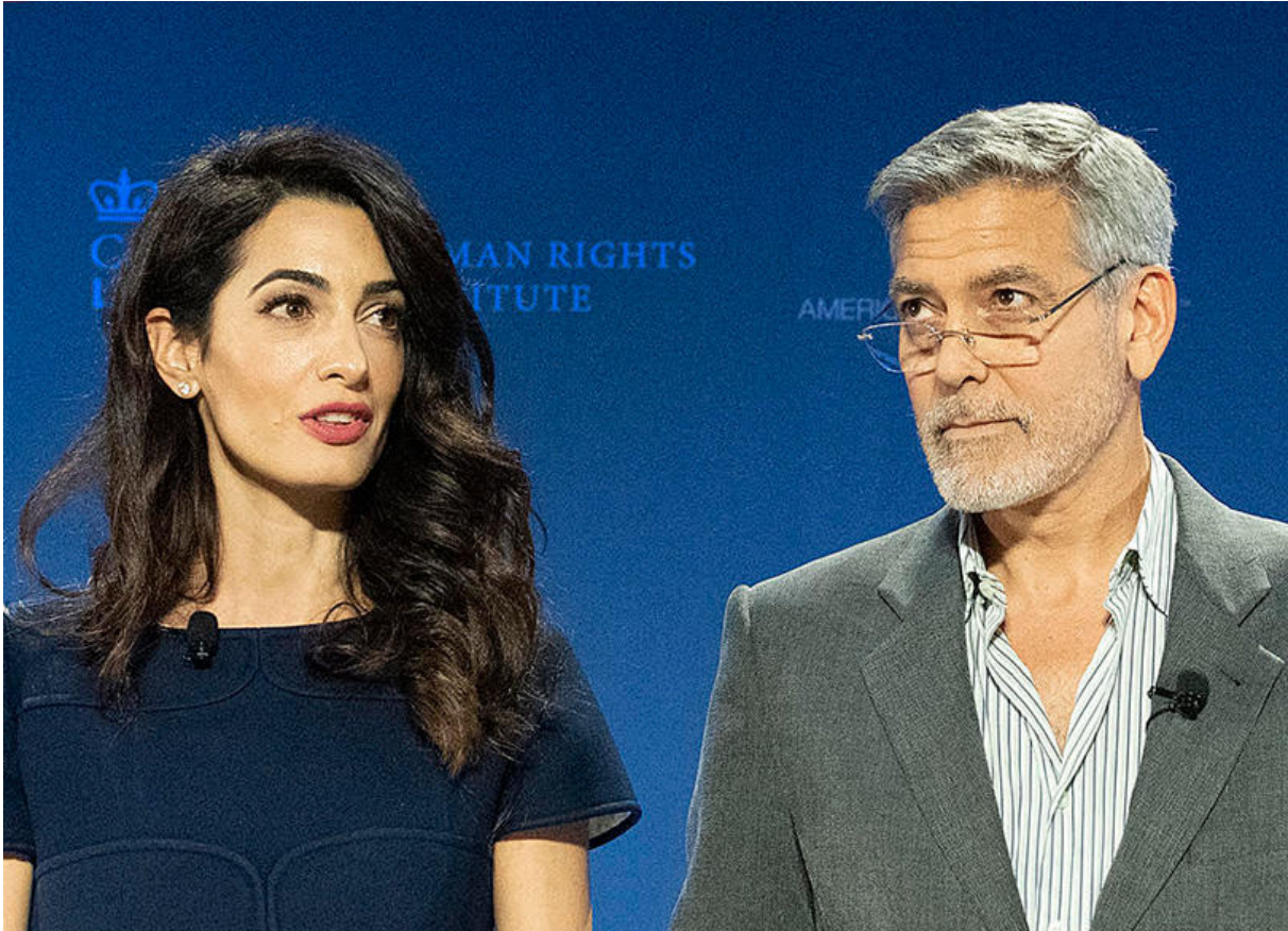
Amal and George Clooney at Columbia Law School.

The law school's Human Rights Institute and the Clooney Foundation for Justice have joined forces to train Columbia law students to monitor legal proceedings against journalists, dissidents, LGBTQ people, women and girls, members of religious minorities, and other vulnerable groups in countries where human rights are at risk.