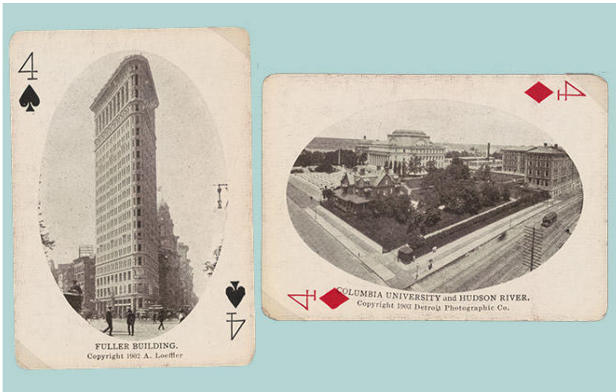
Albert Field Playing Card Collection, Columbia Rare Book and Manuscript Library