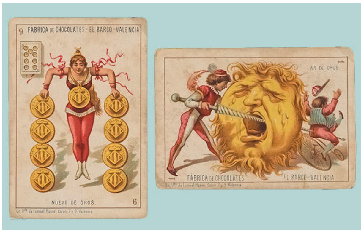
Albert Field Playing Card Collection, Columbia Rare Book and Manuscript Library