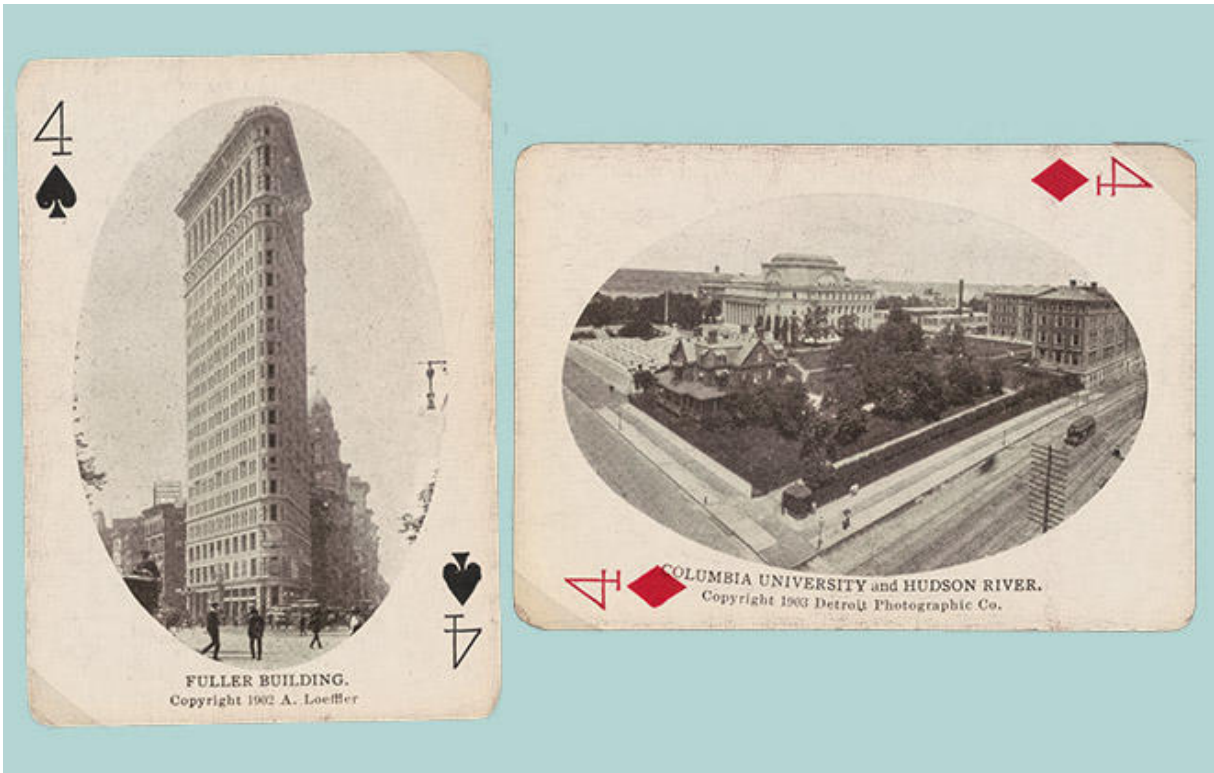
Albert Field Playing Card Collection, Columbia Rare Book and Manuscript Library