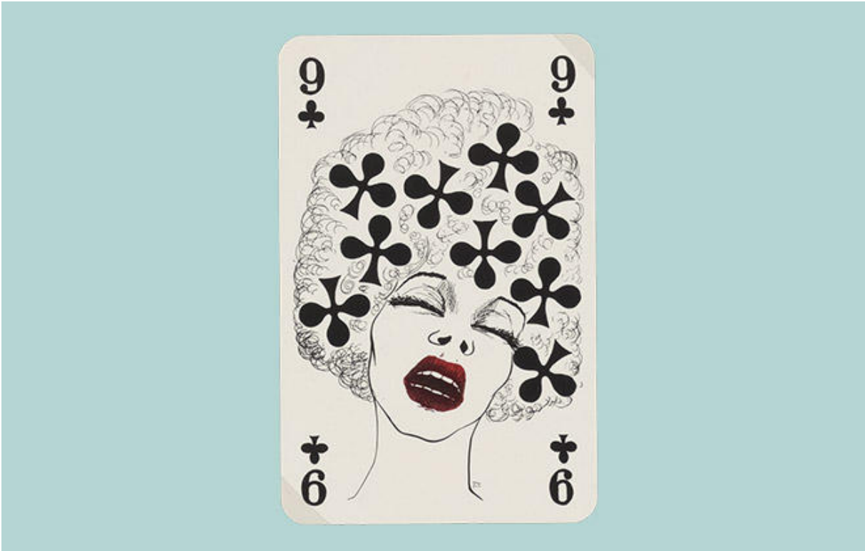
Albert Field Playing Card Collection, Columbia Rare Book and Manuscript Library

New York City, Standard Playing Card Co. Chicago, 1905.