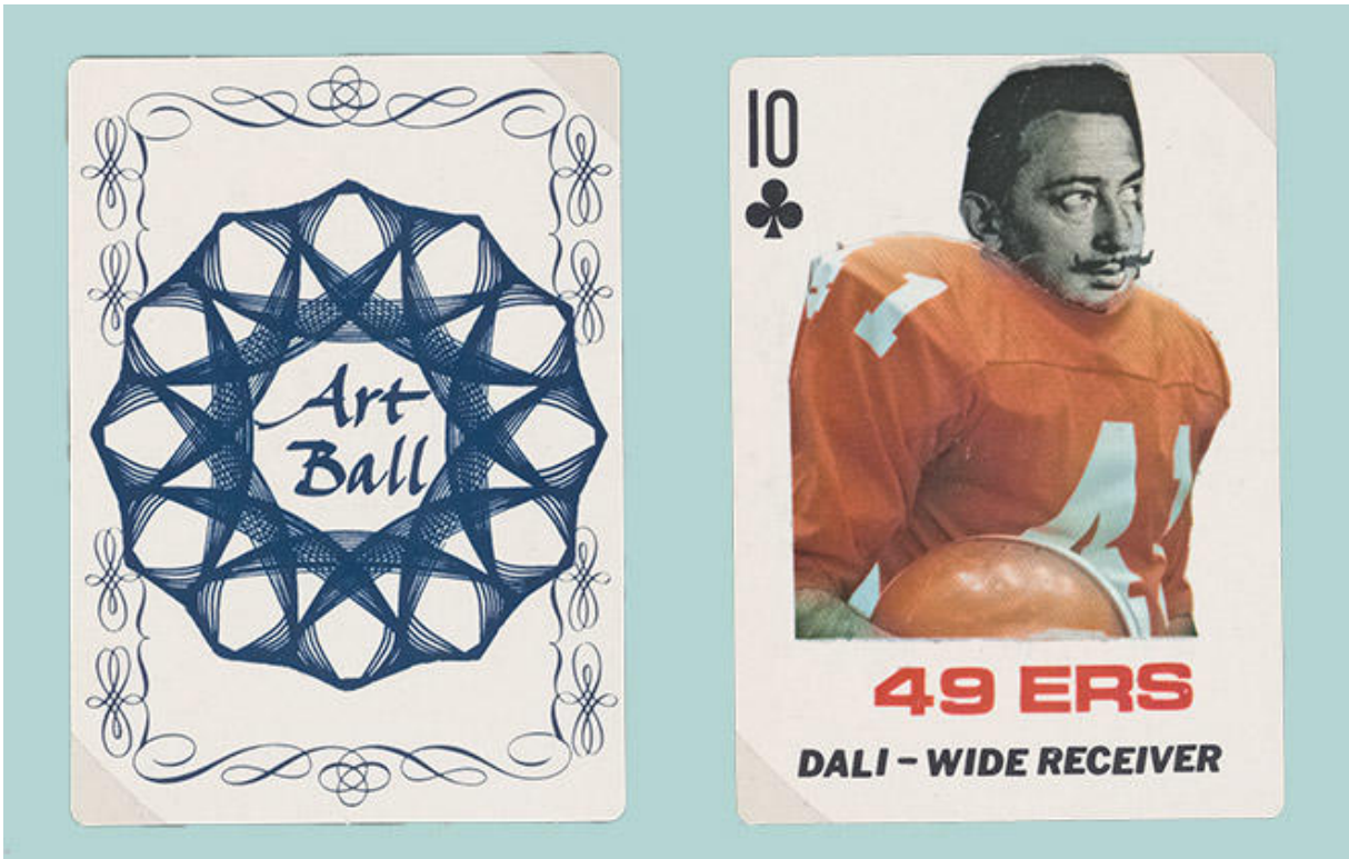
Albert Field Playing Card Collection, Columbia Rare Book and Manuscript Library

Rock'n Bubble, for Dandy Gum. Netherlands, circa 1986.