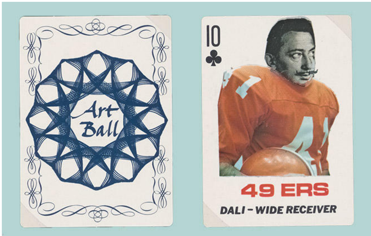
Albert Field Playing Card Collection, Columbia Rare Book and Manuscript Library

Rock'n Bubble, for Dandy Gum. Netherlands, circa 1986.