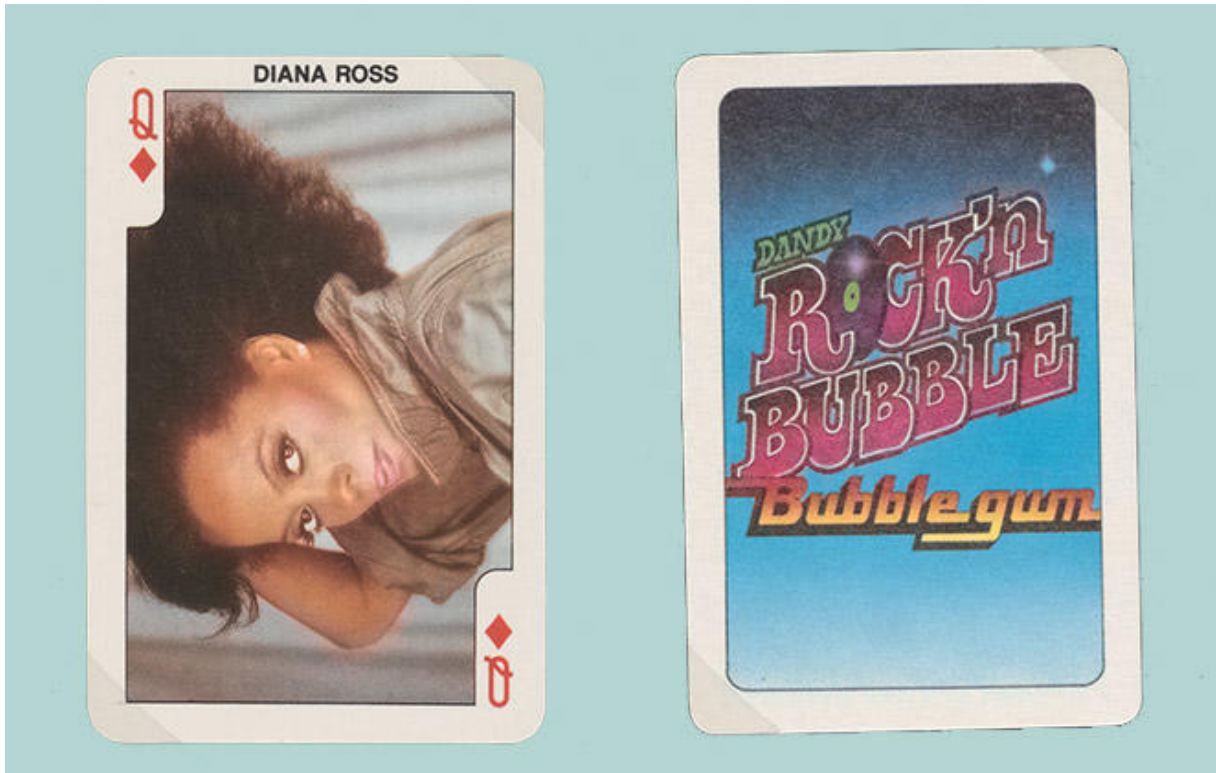
Albert Field Playing Card Collection, Columbia Rare Book and Manuscript Library