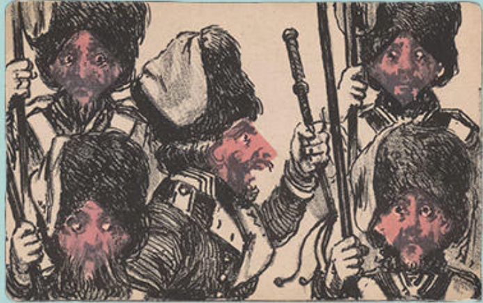
Albert Field Playing Card Collection, Columbia Rare Book and Manuscript Library

This article appears in the Fall 2019 print edition of Columbia Magazine with the title "Wild Cards."