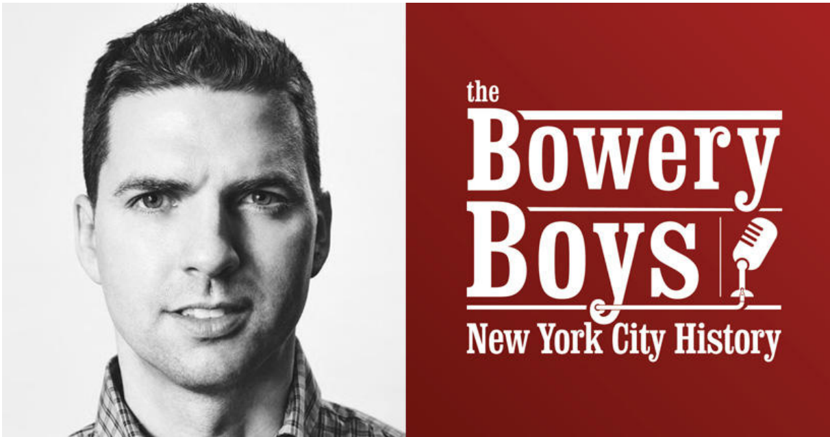
Tom Meyers.