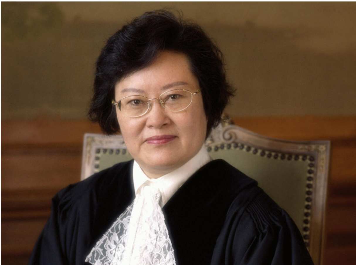
Xue Hanqin