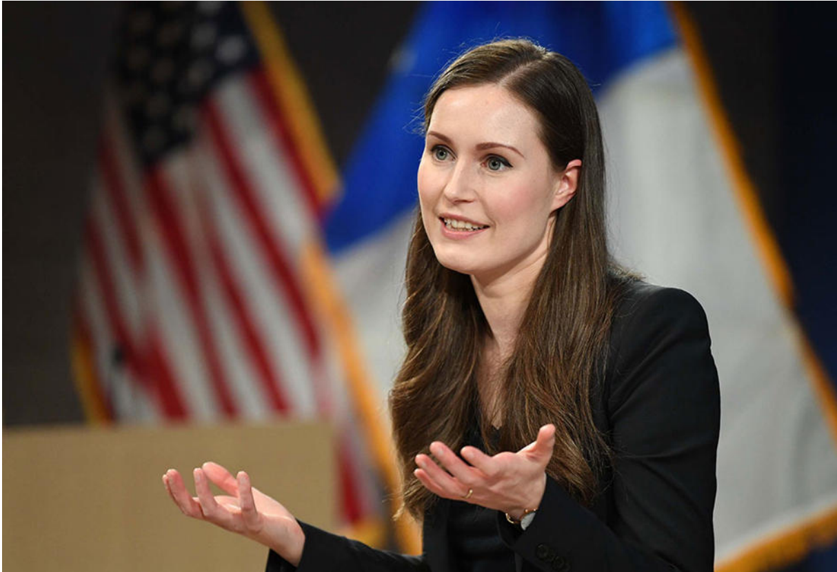
Sanna Marin.

Sanna Marin , Finland's thirty-four-year-old prime minister, came to Columbia to participate in its World Leaders Forum on March 6. In discussing her country's aggressive efforts to become carbon-neutral by 2035, she argued that, with proper planning, economic prosperity and equality can be achieved in tandem with environmental sustainability.