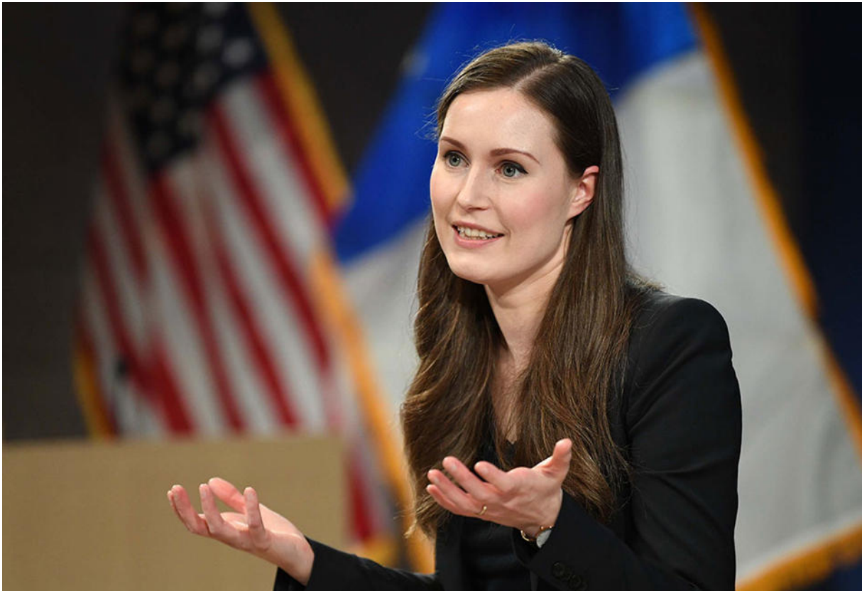
Sanna Marin.

Sanna Marin , Finland's thirty-four-year-old prime minister, came to Columbia to participate in its World Leaders Forum on March 6. In discussing her country's aggressive efforts to become carbon-neutral by 2035, she argued that, with proper planning, economic prosperity and equality can be achieved in tandem with environmental sustainability.