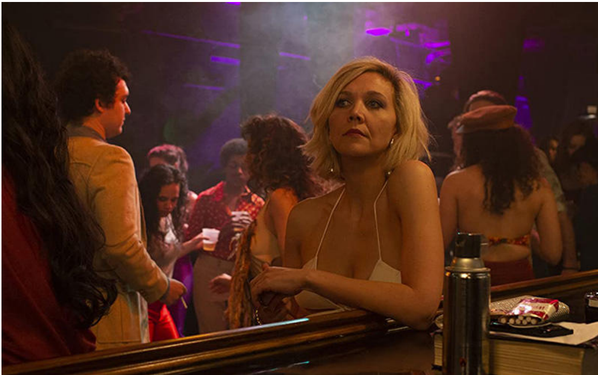
Maggie Gyllenhaal in "The Deuce."