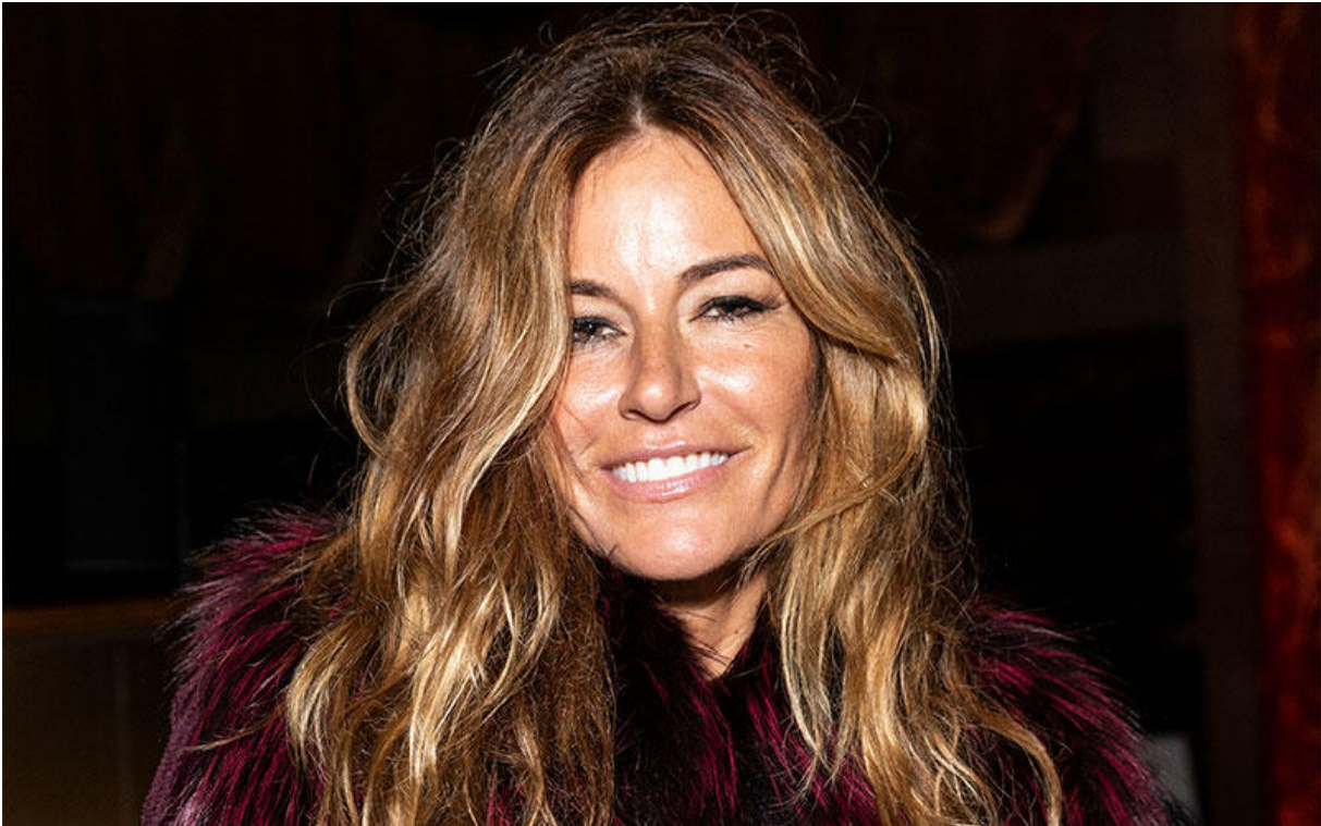
Kelly Killoren Bensimon.