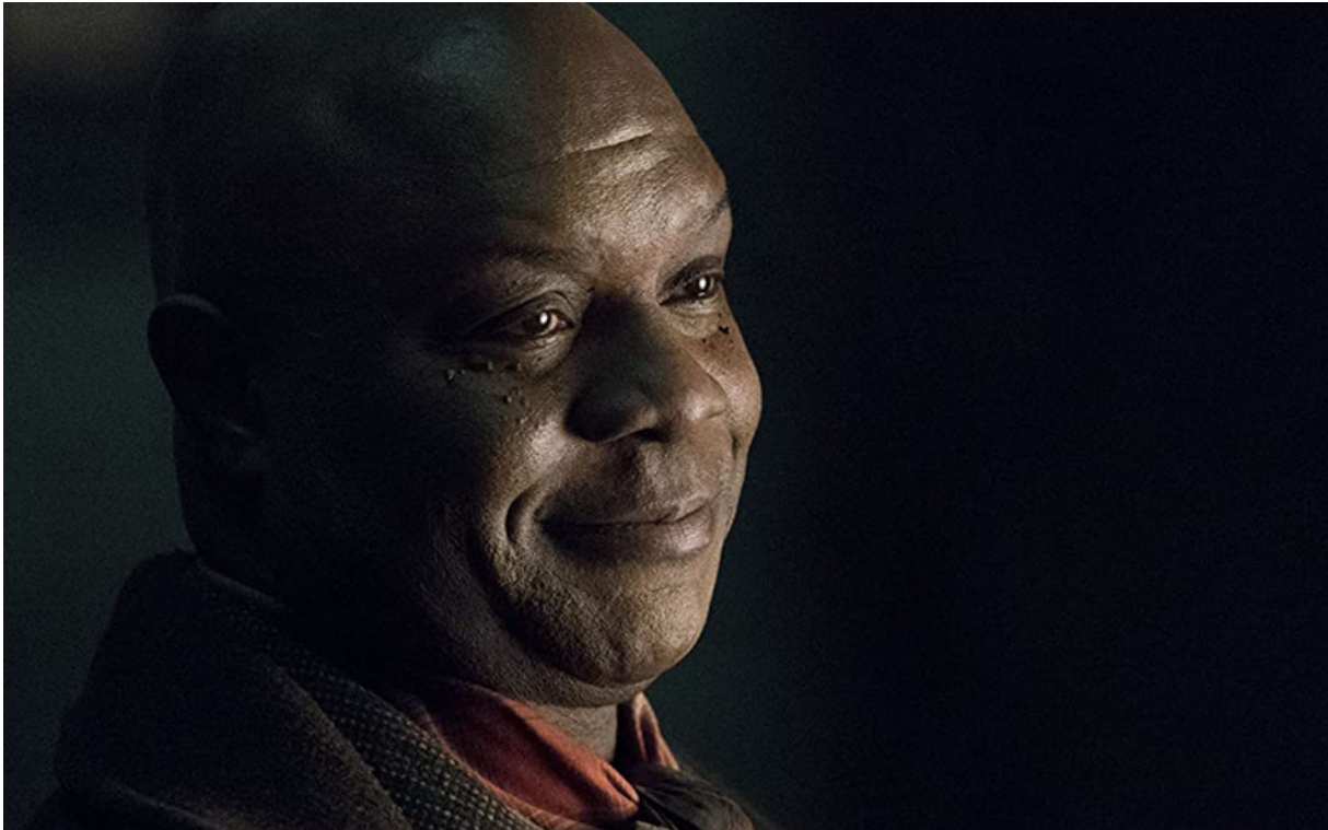
Robert Wisdom in "The Alienist" (2018).