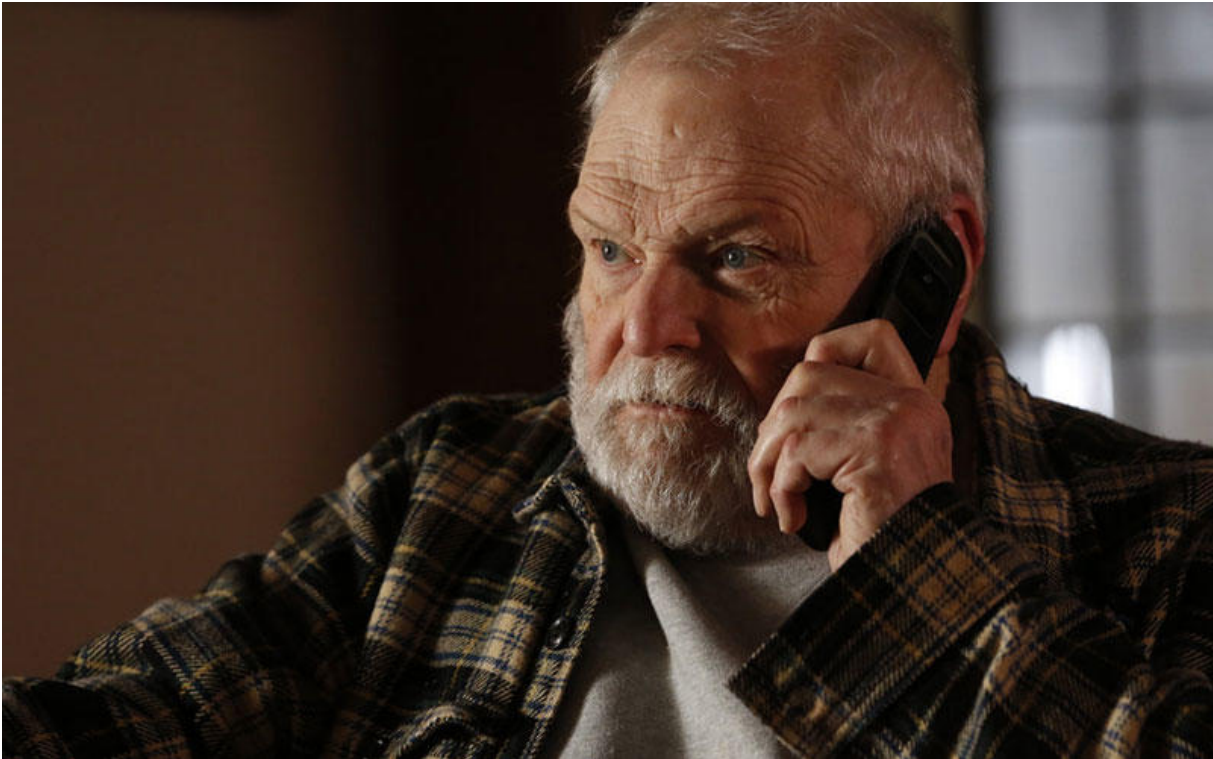
Brian Dennehy in "The Blacklist."