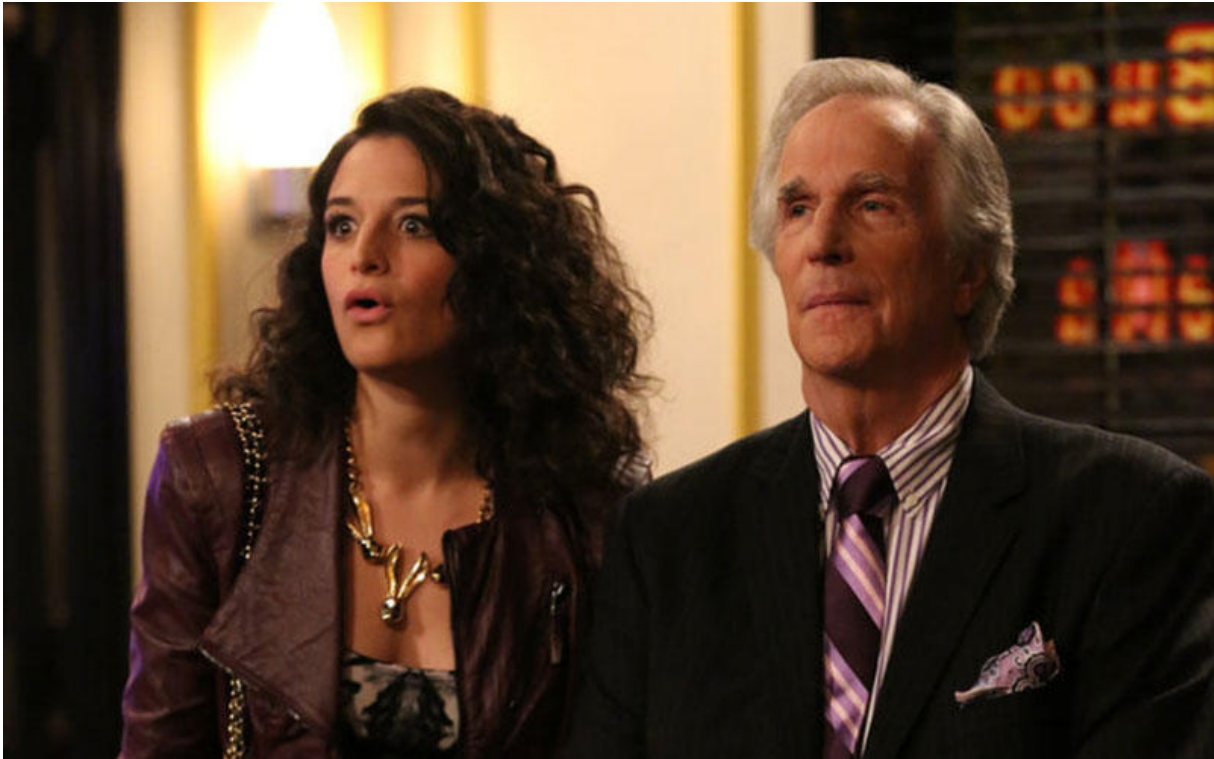
Jenny Slate with Harry Winkler in "Parks and Recreation."