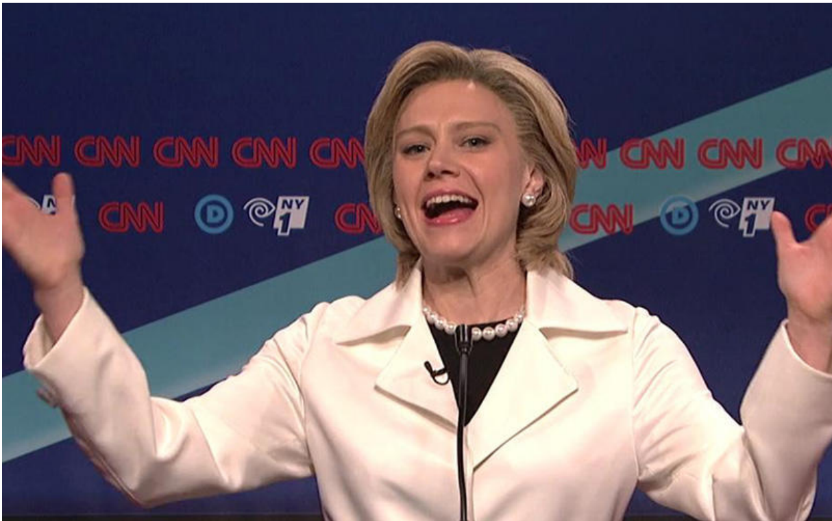
Kate McKinnon as Hillary Clinton on "Saturday Night Live."