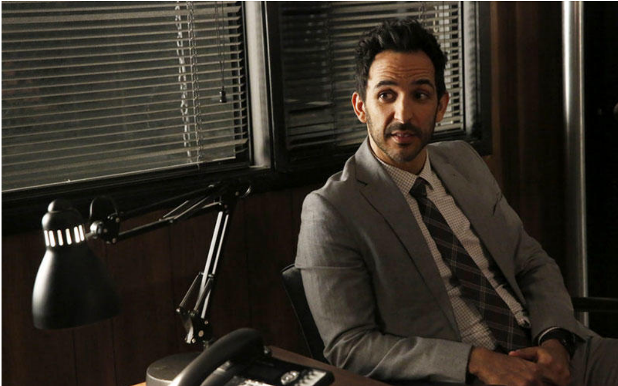
Amir Arison in "The Blacklist."