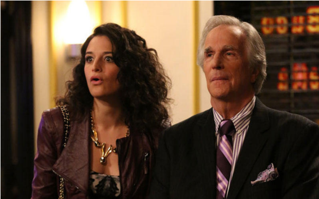
Jenny Slate with Harry Winkler in "Parks and Recreation."