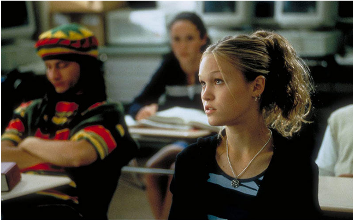
Julia Stiles in "10 Things I Hate about You."