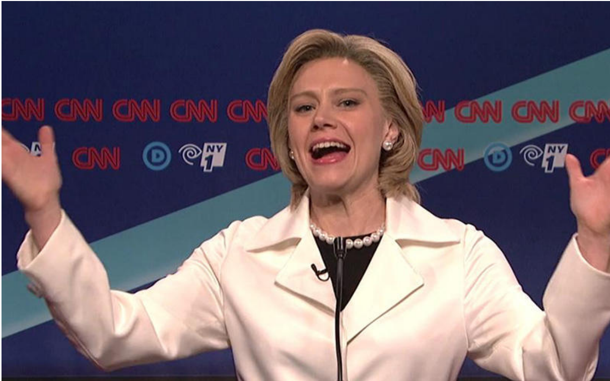
Kate McKinnon as Hillary Clinton on "Saturday Night Live."