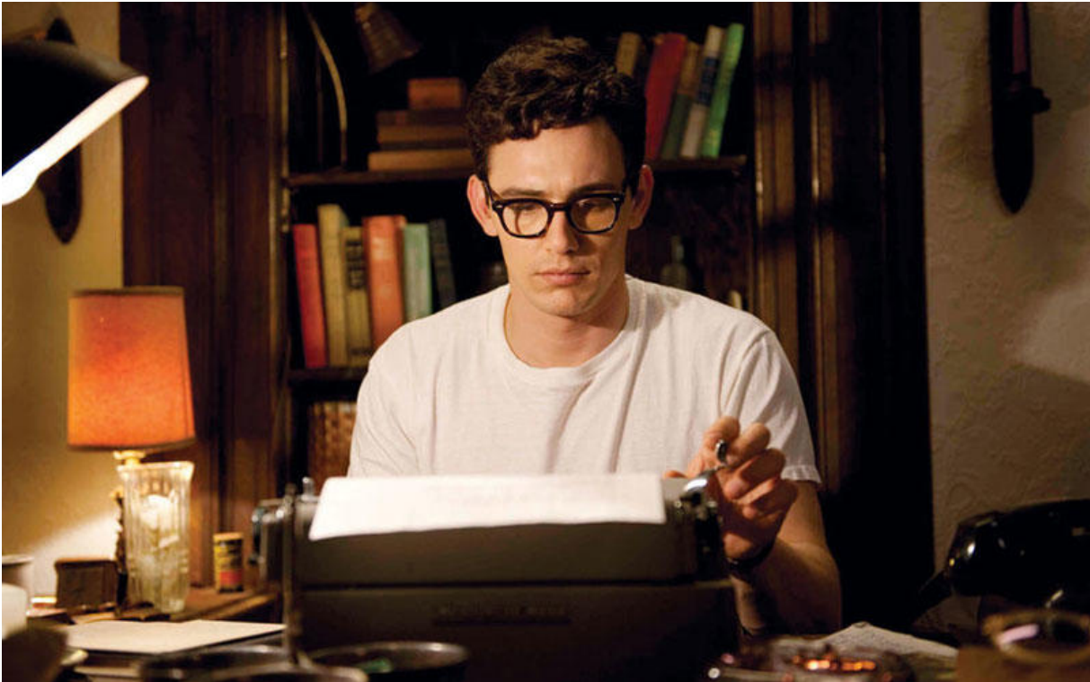
James Franco as Allen Ginsberg in "Howl."