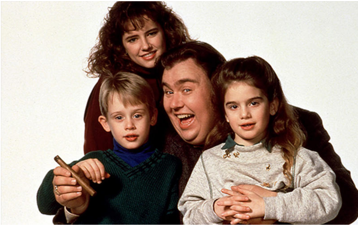
Jean Louisa Kelly (top) with the cast of "Uncle Buck": Macaulay Culkin, John Candy, and Gaby Hoffman.