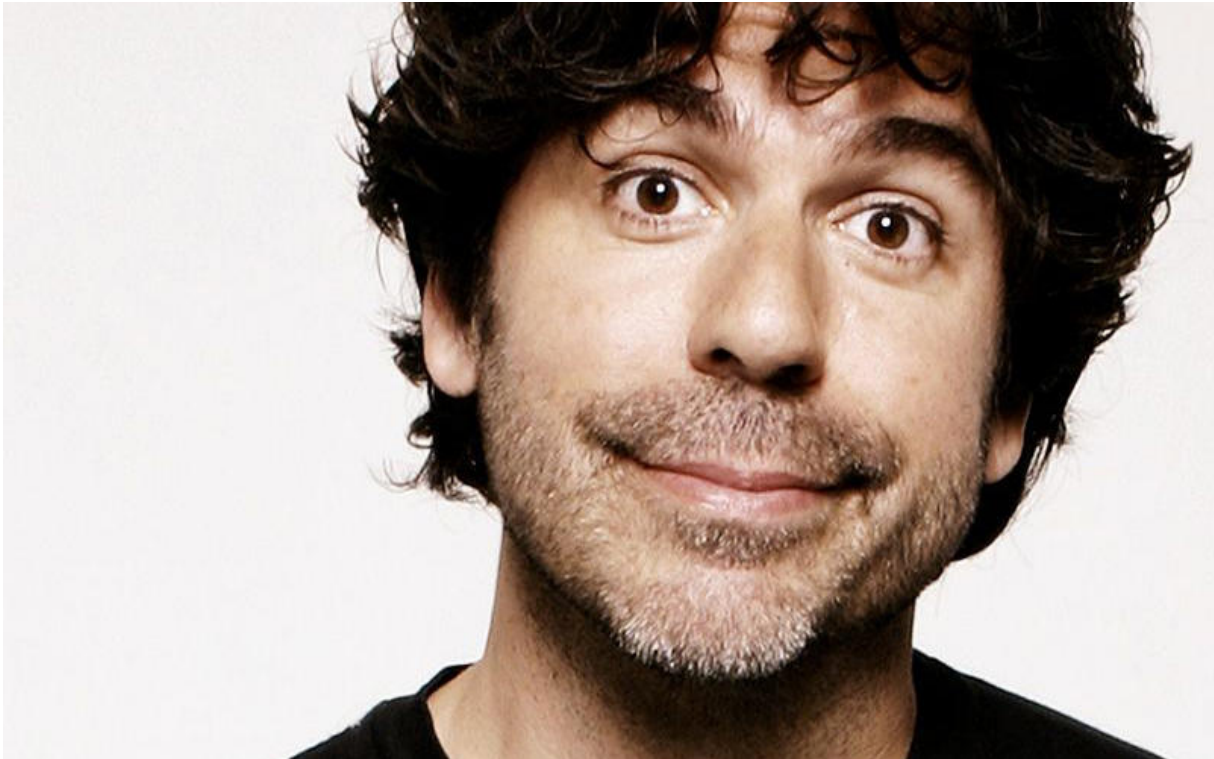
Greg Giraldo.