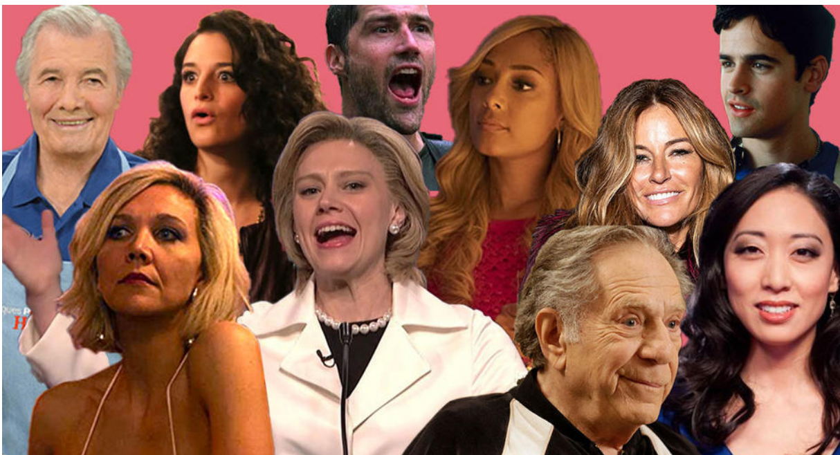
Collage by Len Small

These actors, comedians, and TV personalities have all called Morningside Heights home.