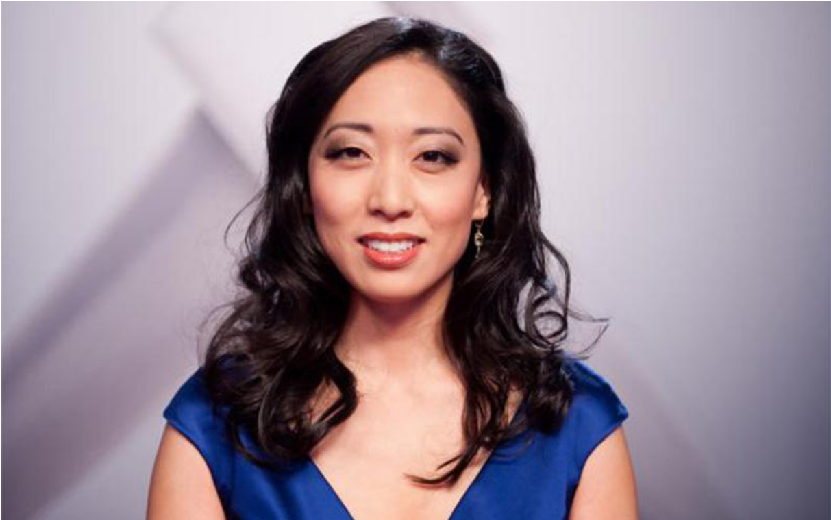
Judy Joo.