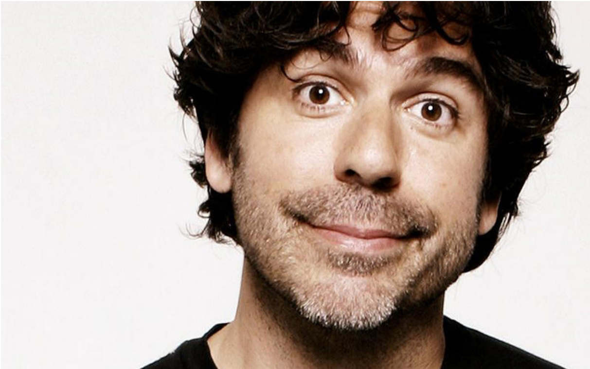
Greg Giraldo.