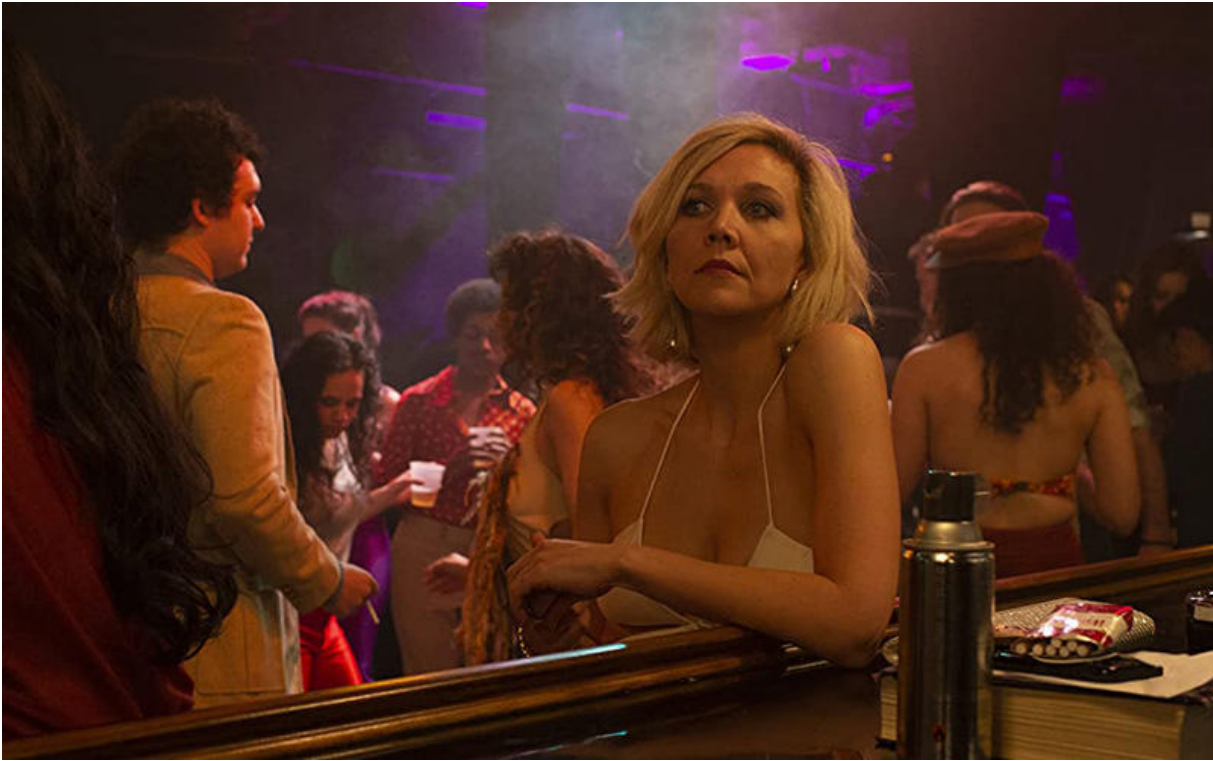
Maggie Gyllenhaal in "The Deuce."