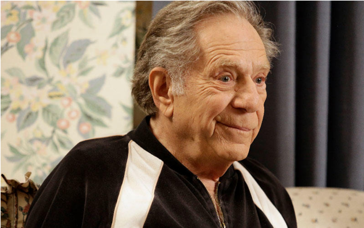
George Segal in "The Goldbergs."