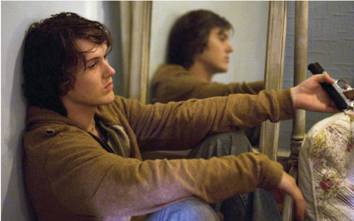
Spencer Treat Clark in "The Last House on the Left."