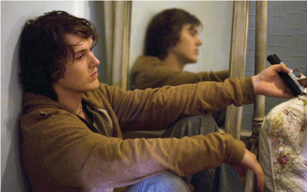
Spencer Treat Clark in "The Last House on the Left."