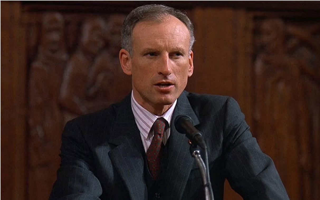
James Rebhorn in "Scent of a Woman."