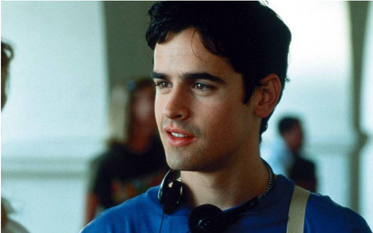
Jesse Bradford in "Bring it On."