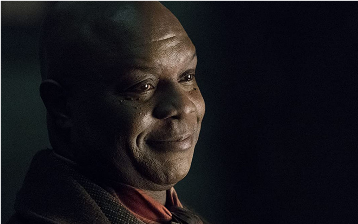
Robert Wisdom in "The Alienist" (2018).