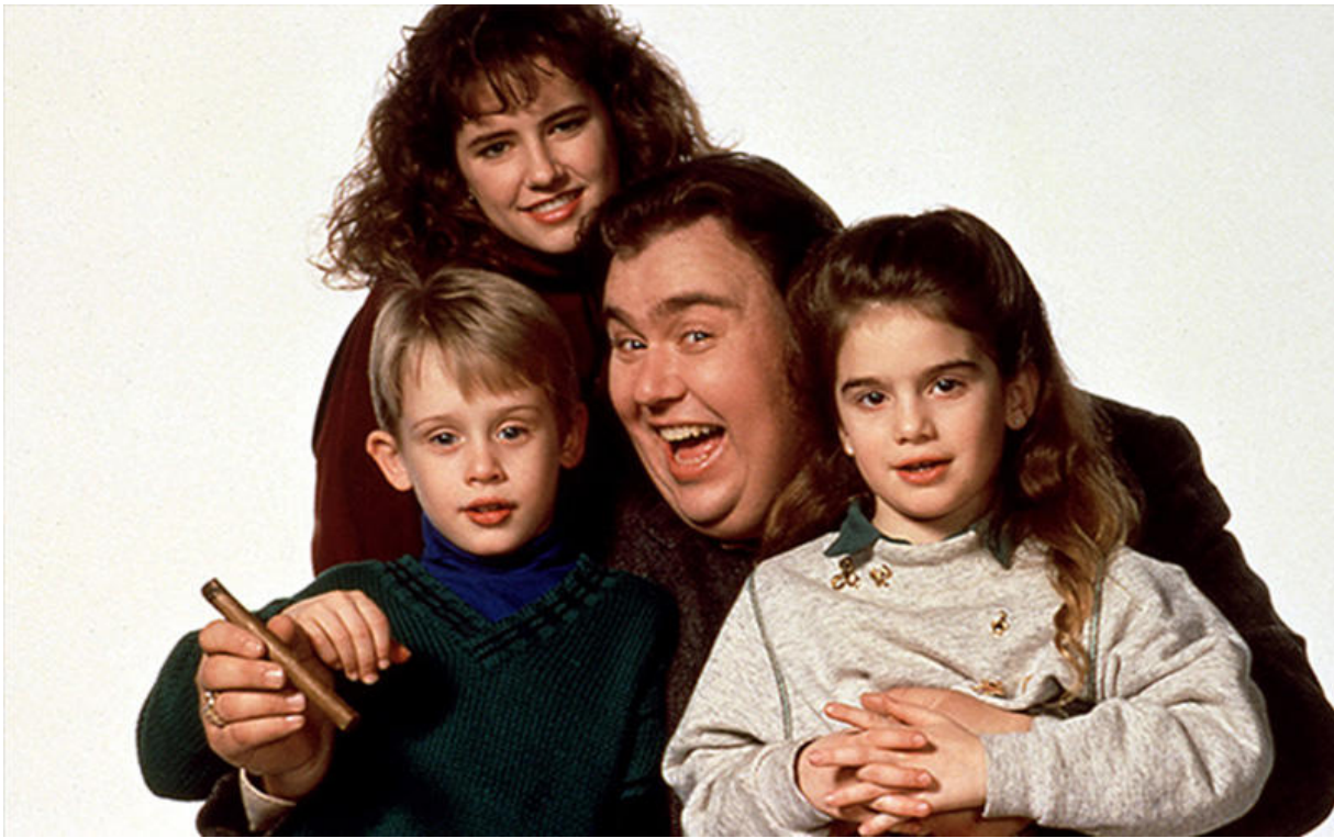
Jean Louisa Kelly (top) with the cast of "Uncle Buck": Macaulay Culkin, John Candy, and Gaby Hoffmann.