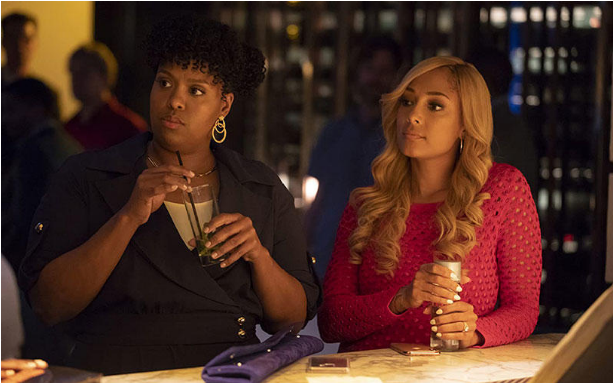
Amanda Seales (right) with Natasha Rothwell in "Insecure."