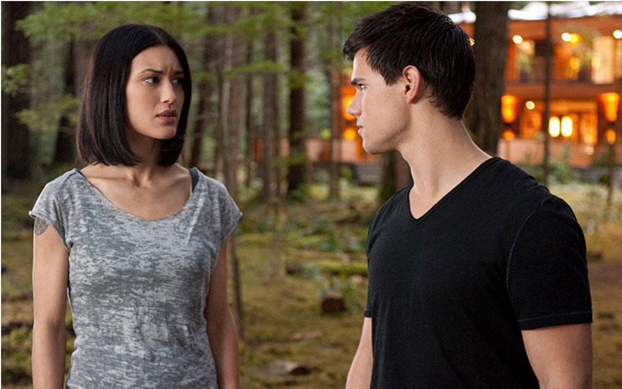
Julia Jones with Taylor Lautner in "The Twilight Saga: Breaking Dawn - Part 1."