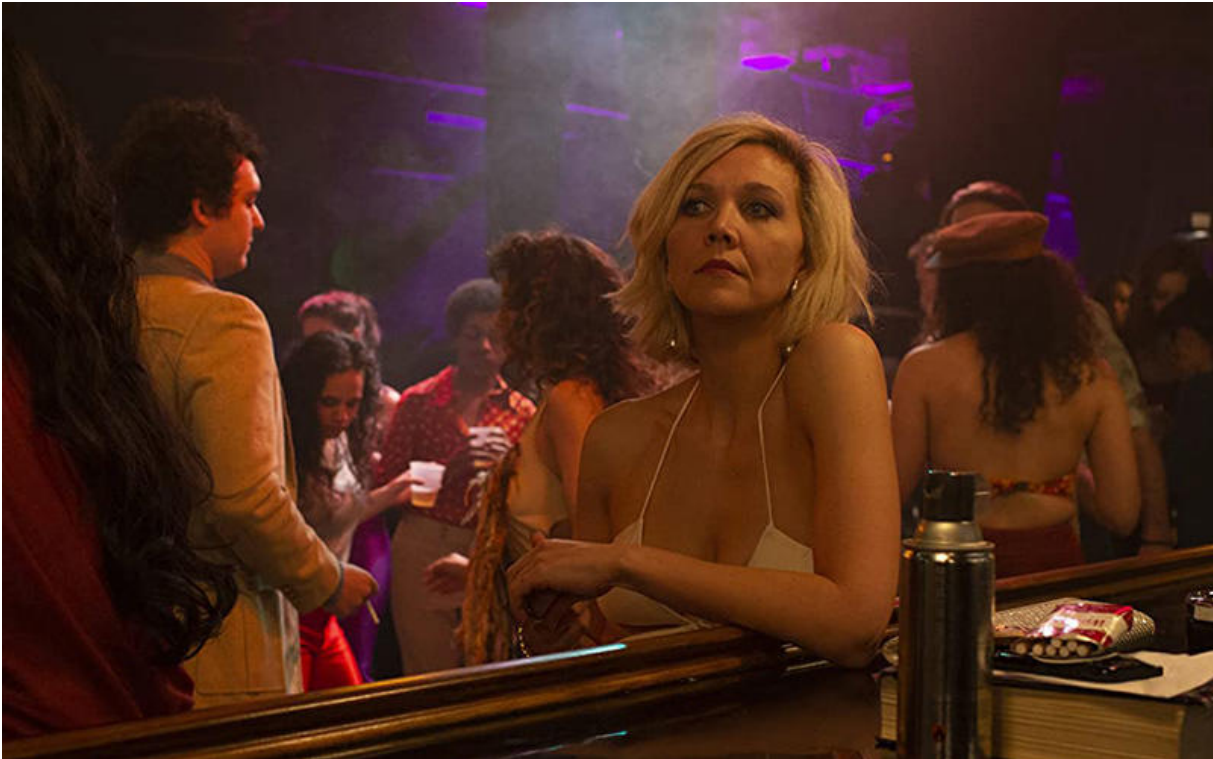
Maggie Gyllenhaal in "The Deuce."