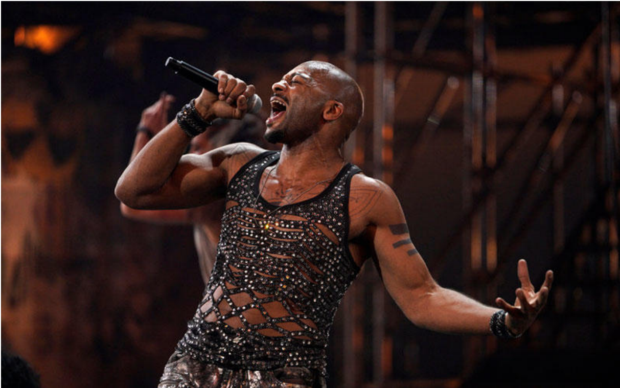
Brandon Victor Dixon in "Jesus Christ Superstar."