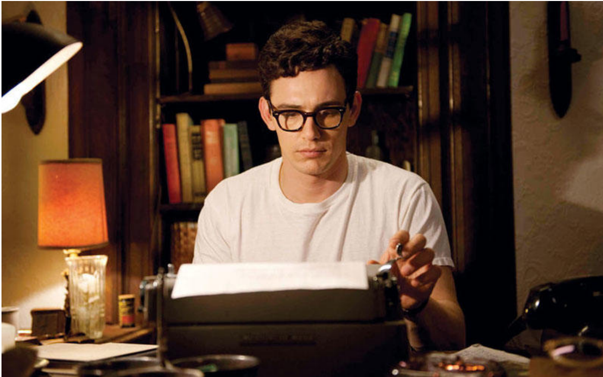
James Franco as Allen Ginsberg in "Howl."