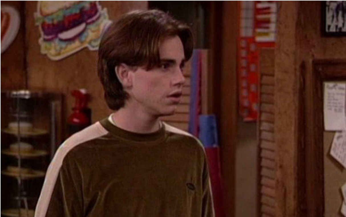
Rider Strong in "Boy Meets World."